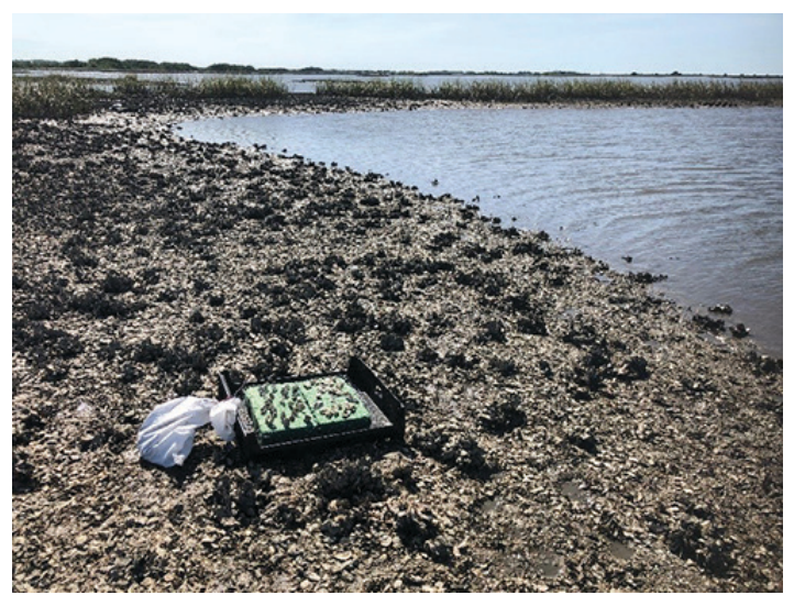
Figure 2. An oyster reef with an experimental tray used to assess changes in natural mortality.

There are several key ways in which climate change will alter estuaries and affect oyster reefs. Acidification is the decrease in overall oceanic pH as increasing amounts of atmospheric CO2 are absorbed by ocean waters (Sabine et al. 2004). Acidification threatens the shell strength of oysters and the structure of reefs. As the water becomes more acidic, juvenile oysters may struggle to grow their shells or have reduced growth, which will impact the health of individual oysters and their ability to construct reefs and which will cause existing shell reefs to disintegrate more quickly (Miller et al. 2009). Acidification is influenced by local geology, and, though it is occurring at a slower rate than in open ocean waters, estuarine oyster habitats are acidifying at similar rates across Florida (Robbins and Lisle 2018).