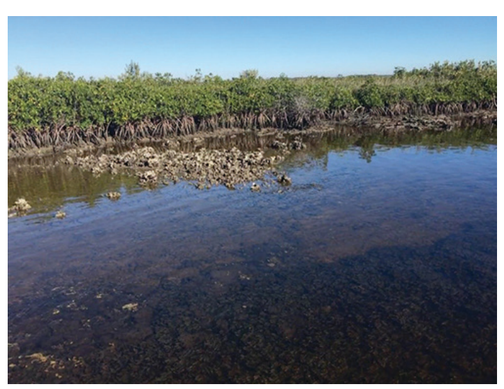
Figure 1. Oysters are a critical part of coastal ecosystems in Florida.

Eastern oysters (Crassostrea virginica) are commonly found in estuaries and bays in the Gulf of Mexico. They build recognizable reef structures that are well-recognized for providing many services for both the environment and for humans. These services include water nutrient cycling, creation of reef habitats for fish and crustaceans, carbon sequestration, protection of shorelines from erosion and storms by buffering wave energy, increased overall biodiversity, and sustaining commercial and recreational oyster fisheries important for many coastal communities (Grabowski and Peterson 2007; Grabowski et al. 2012). Oyster fisheries have historically provided a reliable source of protein and income for these communities, with Gulf of Mexico oyster landings valued at over $100 million USD in 2017 (NOAA 2019). Therefore, the health of oyster populations is incredibly important to ecosystems and for human interests.