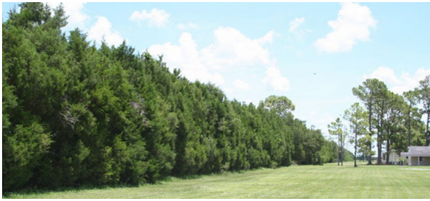
Figure 2. Single-row eastern red cedar windbreak at Southwest Florida Research and Education Center (UF), Immokalee, Florida. Credits: Bijay Tamang, July 11, 2007

countries (about 140 countries in 2006). However, the citrus industry is gradually declining due to adverse conditions and diseases. For these growers, windbreaks have the greatest potential to improve crop quality and yield. Some of the benefits growers may obtain by the use of windbreaks are discussed in the following sections.