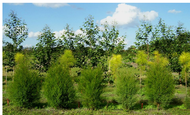
Figure 4. Three-row windbreak around citrus block – eastern red cedar (front), slash pine (middle) and eucalyptus (back row) – at Plant Science Research & Education Unit (UF), Citra, Florida. Credits: Bijay Tamang, December 13, 2007