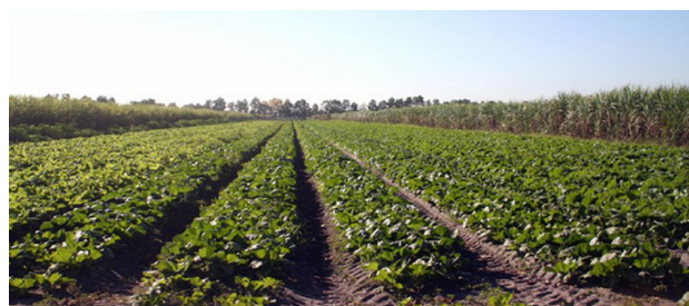
Figure 1. Sugarcane (left and right) and tree (far end) windbreaks around vegetable farm at C&B Farms, Clewiston, Florida. Credits: Bijay Tamang, December 21, 2007

shrubs and in some cases tall grasses (Figure 1 and Figure 2). Artificial windbreaks are vertical structures made from a variety of materials including metal and plastic cloth. One of the primary economic advantages of a living windbreak is that it is a cheap and cost-effective technology due to low establishment and maintenance costs. The primary economic disadvantage is that a living windbreak may take several years to develop; therefore, the economic benefit is not immediate.