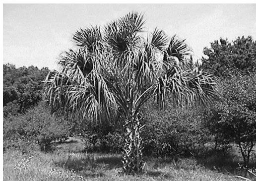
Figure 2. Reduce the fire hazard by removing the dead fronds. Credits: Photo: J. Douglas Doran

Many of these objections can be overcome, at least in part. Demonstration projects and educational programs help landowners find workable compromises between firewise landscaping principles and concerns about aesthetics, shade, privacy, and wildlife habitat (Monroe, Babb, and Heuberger 1999). Concerns about protecting nature can be countered with educational programs that emphasize the role of fire in the regeneration and life cycle of many species. Presentations of firewise techniques to landowners need to cautiously present these potential conflicts and show examples of how they have been resolved. Illustrations can provide landowners multiple views of landscape designs that are firewise, aesthetic, and private (Southern Center for