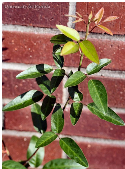
Figure 5. Dixie ticktrefoil, Desmodium tortuosum [Sw.] DC., a host plant for the silver-spotted skipper, Epargyreus clarus (Cramer).