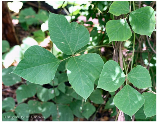
Figure 6. Kudzu, Pueraria montana [Lour.] Merr., a host plant for the silver-spotted skipper, Epargyreus clarus (Cramer).