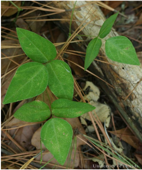
Figure 4. American hogpeanut, Amphicarpaea bracteata [L.] Fernald, a host plant for the silver-spotted skipper, Epargyreus clarus (Cramer).