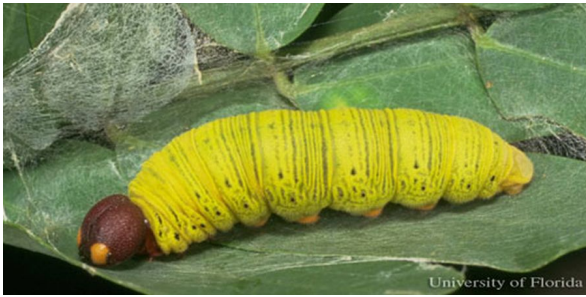
Figure 2. Larva of the silver-spotted skipper, Epargyreus clarus (Cramer), in opened leaf-shelter on false indigo.

Pupa: The pupa is dark brown with black and white markings.