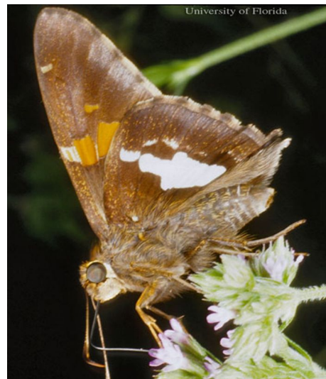
Figure 1. An adult silver-spotted skipper, Epargyreus clarus (Cramer), feeding at a flower.

Adult: The wing spread is 1.75 to 2.40 inches (Daniels 2003). The upper-side of the wings is brown with a median row of yellowish-gold spots on the forewing that is also visible from beneath. The wing fringe is dashed with white. The under-side of the wings is brown with a large median irregular-shaped white patch on each wing and a short rounded tail. The Butterflies of America web site (Warren et al. 2007) has excellent photographs of pinned male and female adults.