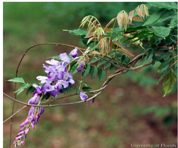
Figure 8. Chinese wisteria, Wisteria sinensis [Sims] DC., a host plant for the silver-spotted skipper, Epargyreus clarus (Cramer).