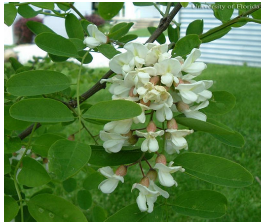
Figure 7. Black locust, Robinia pseudoacacia L., a host plant for the silver-spotted skipper, Epargyreus clarus (Cramer).