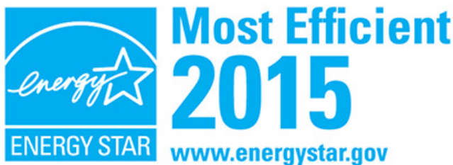
Figure 3. Sample ENERGY STAR Most Efficient logo for use on qualified products only

Note that the Environmental Protection Agency (EPA) has a designation ENERGY STAR Most Efficient 2015 (Figure 3). This label recognizes products that deliver cutting-edge energy efficiency along with the latest in technological innovation. The year included on the label designates that the device or appliance meets the criteria for the year indicated. Ceiling fans are one of several appliances or devices that have units meeting these criteria. If interested, begin your search at http://www.energystar.gov/mostefficient .