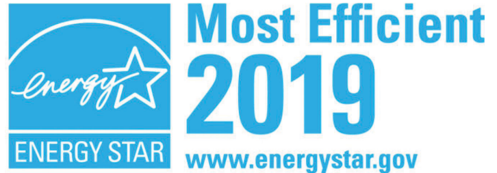
Figure 3. Sample ENERGY STAR Most Efficient logo for use on qualified products only.

Note that the Environmental Protection Agency (EPA) has a designation ENERGY STAR Most Efficient 2019 (Figure 3). This label recognizes products that deliver cutting-edge energy efficiency along with the latest in technological innovation. The year included on the label designates that the device or appliance meets the criteria for the year indicated. Ceiling fans are one of several appliances or devices that have units meeting these criteria. If interested, begin your search at https://www.energystar.gov/products/most_efficient .