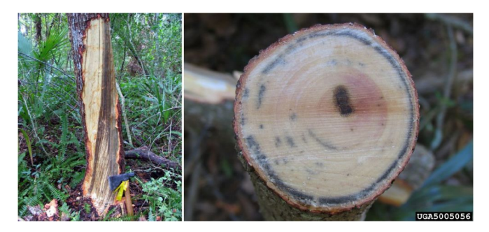
Figure 5. Symptoms of laurel wilt in redbay trees: a) removing the bark reveals dark staining of the sapwood and b) the dark color of the outer ring of sapwood below the bark indicates the tree has been infested by the redbay ambrosia beetle and the wood colonized by the laurel wilt fungus. The fungus that has colonized the sapwood blocks water and nutrient movement in the tree.