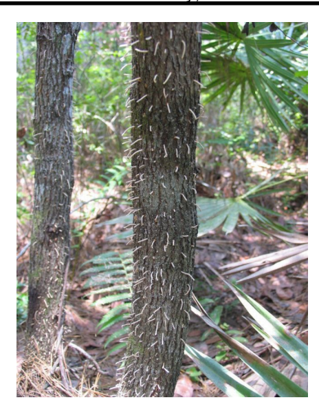
Figure 6. Small strings of compacted sawdust protrude from the small bore holes along the trunk of a tree.