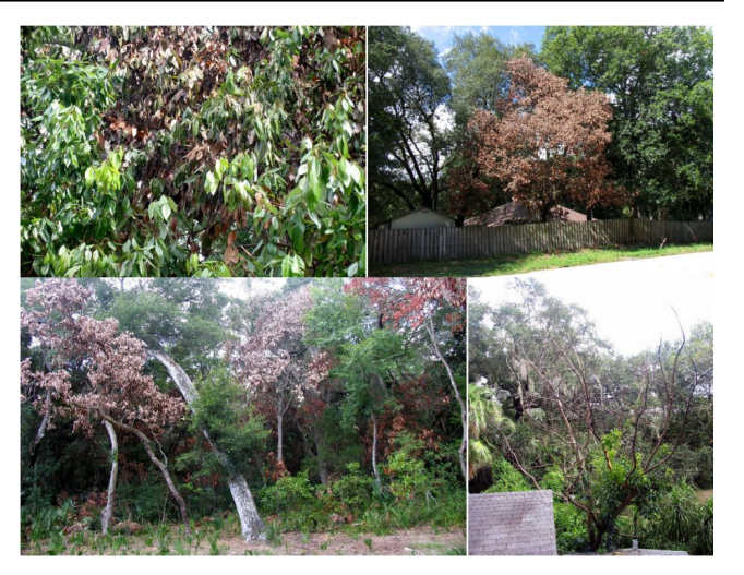
Figure 3. Whole redbay trees killed by laurel wilt.