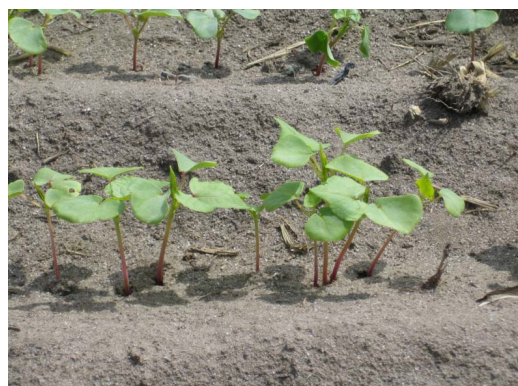
Figure 5. Young seedlings of buckwheat in Citra, Florida. This buckwheat was seeded with a drill at a rate of 50 lbs/acre (56 kg/ha.)

The dense, fibrous root system is concentrated in the top 25 cm (10 in) of the soil, and may perform better than cereal grains on low-fertility soils due in part to its root morphology (Bowman et al., 1998). The short taproot and its branches account for 3% to 8% of the dry weight of the plant (Robinson, 1980). The percent of dry weight is much less than the root system of small grains, which may comprise 6% to 15% of the total weight of the plant. Because of its