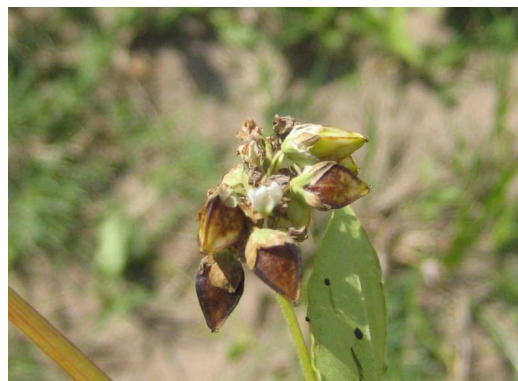
Figure 6. Six week old buckwheat in seed in Citra, Florida.

small size, the root system acquires water from a limited volume of soil, which may be a partial explanation for wilting that occurs in hot, dry weather. It is planted in the northeastern states and Canada in the summer, and in the southeastern U.S., it is typically planted in the early spring or fall.