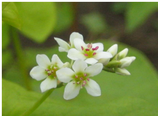
Figure 4. Four-week-old buckwheat in flower in Citra, Florida. This buckwheat was planted on March 13.

termination by frost (Figure 4). It germinates in three to five days (Figure 5), and flowers in approximately three to five weeks. In ongoing experiments on buckwheat as a weed-suppressive cover crop in Citra, Florida, flowers appeared in three weeks in late spring, and four weeks in the fall (Huang, unpublished data). In those same experiments, mature seeds formed in six weeks in late spring, and eight weeks in the fall (Huang, unpublished data) (Figure 6). The crop requires 12 weeks to harvest mature seed. Buckwheat is tolerant of a wide range of soil types and fertility levels, but performs best when the climate is cool and moist. It germinates at temperatures between 7° and 40°C (45 – 104°F). It is well suited to production on sandy soils, as clayey or nutrient-rich soils may cause irreversible lodging. Although the crop will perform well on residual fertilizer, some nitrogen is needed to ensure optimal response. For grain production, recommended nitrogen rates in Wisconsin and Minnesota range from 1 to 58 kg ha -1 (1 – 52 lb a -1 ) when organic matter is less than two percent (Oplinger et al., 1989). Buckwheat can tolerate acidic soils and will respond to liming when the pH is less than five.