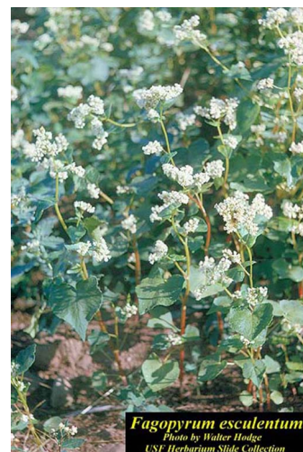
Figure 1. Commercially available buckwheat, F. esculentum .

Buckwheat [ Fagopyrum esculentum (Moench)] (Figure 1) is a cool-season annual introduced to the New World by European colonists in the 17th century. Evidence suggests it may have been cultivated in China as early as 5000 B.C. (Ohnishi, 1998). Species of buckwheat grown commercially include F. sagittatum Gilib, F. emarginatum Moench, F. esculentum , and F. tartaricum (L.) Gaertn. It is a multipurpose crop mainly cultivated as forage or milled into flour for human consumption. Buckwheat is unique among commercial grains because it is a member of the Polygonaceae family, rather than Poaceae, and as such is often referred to as a “pseudocereal.” Diseases of dicot cereals are not important for buckwheat, nor are insects a problem (Robinson, 1980). Wild buckwheat ( Polygonum convolvulus L.) is an annual weed resembling buckwheat but with smaller seeds and a vining growth habit.