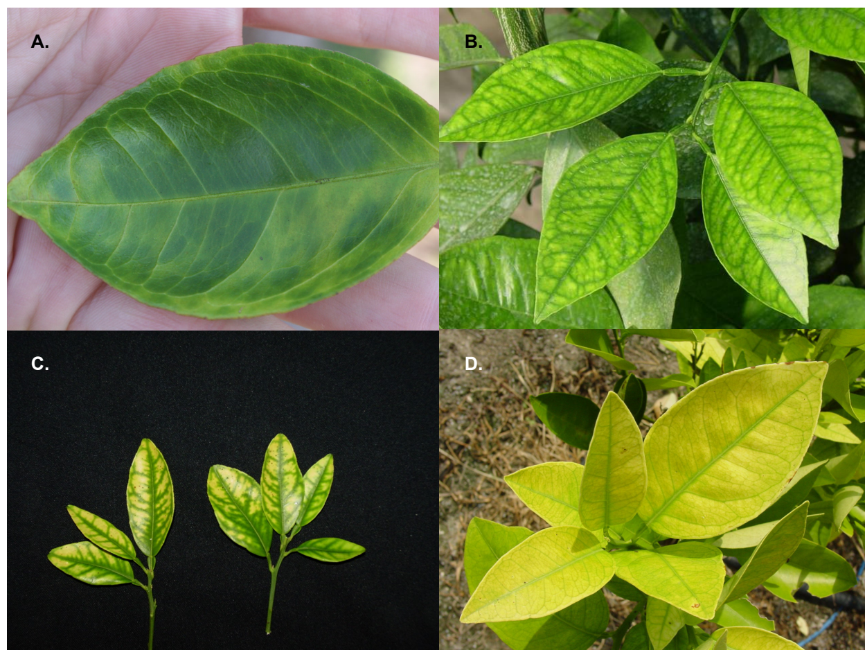
Figure 1. Citrus leaves showing HLB symptoms (A), manganese (B), zinc (C) and iron (D) deficiency symptoms.