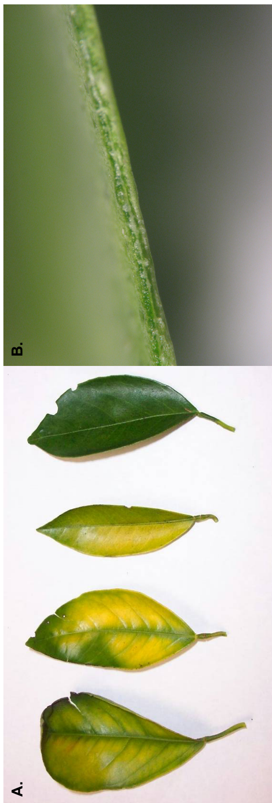
Figure 5. Leaves showing various yellowing symptoms, not typical of HLB, probably due to nutrient deficiency (A) do not stain darkly when immersed in iodine solution (B), indicating that these would not be good samples to submit for PCR analysis.