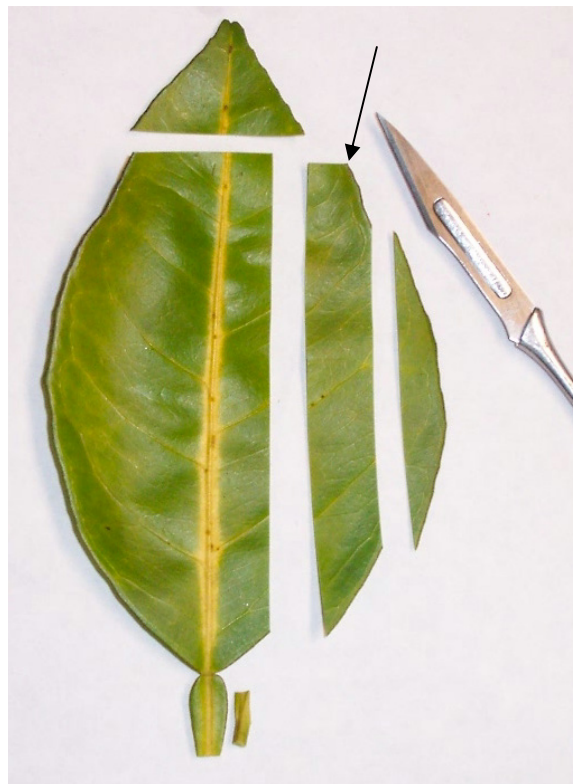
Figure 2. A citrus leaf with the vein corking symptom of HLB properly sectioned for the iodine test. The arrow indicates the symptomatic section to be used for testing.

Figures 3-5 show a series of leaf sections, including healthy leaves, HLB-positive leaves and nutrient-deficient leaves, after iodine staining. Healthy leaves may show some starch staining; however, it is generally confined to a few cell layers at the upper side of the leaf and does not show the same intensity of staining as an HLB-positive leaf (compare Figures 3B and 4). HLB-positive leaves stain a very intense dark grey to black throughout the entire cut surface (Figure 4). Nutrient-deficient leaves generally stain similar to a healthy green leaf (Figure 5).