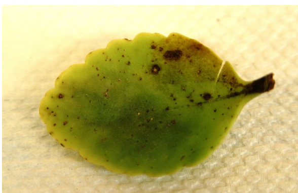
Figure 7. Oedema on kelanchoe.

green or pale yellow-green areas in leaves because of root oxygen deficiency (Fig. 8). Oxygen-starved roots do not function properly and are unable to withdraw water and nutrients from the soil. Of course, wet conditions also foster the development of root-rot fungal diseases, which will be described further in Guidelines for Identification and Management of Plant Disease Problems: Part II. Diagnosing Plant Diseases Caused by Fungi, Bacteria and Viruses ( http://edis.ifas.ufl.edu/MG442 ).