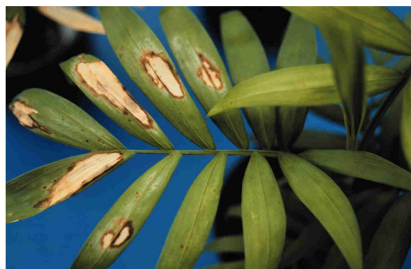
Figure 9. Sunburn on palm leaf.

On the other hand, plants can also become "sunburned". If a plant is transplanted from a shady to a sunny location, the old leaves may develop large necrotic areas in the leaf center from the sudden sun exposure (Fig. 9). Leaves that develop after transplanting will be better adapted to the sun. Sunburn damage can often occur after a wind storm if the shade coverage is lost in the landscape. Keep in mind that some plants are not well adapted to full sun and will never look "normal" in sunny locations.