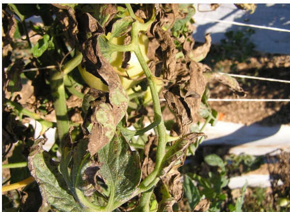
Figure 4. Freeze damaged tomato.

Many fruit, ornamental, and — to a lesser extent—vegetable plants grown in Florida are quite sensitive to cold weather. This is especially true of plants that are native to tropical areas, such as papaya, begonia, and many palm species. Therefore, it should come as no surprise that these plants are frequently injured by low temperatures. This damage may even occur above 32°F (0°C) on particularly cold-sensitive species. Freezing temperatures damage plants by inducing ice-crystal formation in or between cells. Cell membranes rupture on contact with the sharp edges of these crystals. As large numbers of adjacent cells die, the damage (necrosis) becomes visible to the naked eye. Hence, a primary symptom of frost or freeze injury is areas of necrotic tissue, especially at leaf tips and margins (Fig. 4).