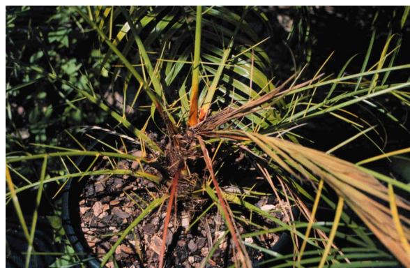
Figure 14. Snapshot herbicide damage to palm.

It is important that Master Gardeners inquire into pesticide use over the past three months on both injured plants and other plants in their proximity. It