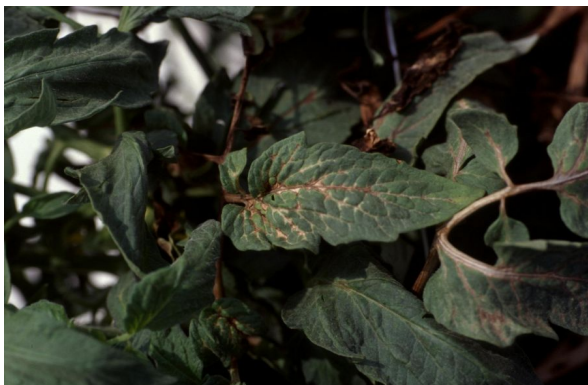
Figure 13. Metribuzin herbicide injury to tomato leaves.

It is important that Master Gardeners inquire into pesticide use over the past three months on both injured plants and other plants in their proximity. It