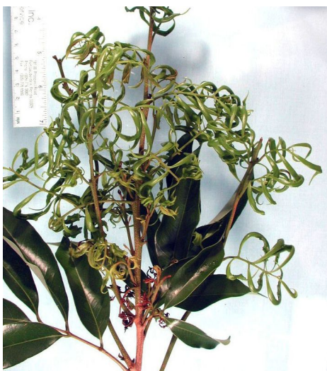
Figure 12. 2,4-D herbicide damage to litchi.

A great range of symptoms are associated with injury from other pesticides. These include bleached (white) spots, marginal yellowing and browning (necrosis) of leaves, stunted growth, stem and branch dieback, and interveinal or veinal yellowing (Figs. 13 and 14). Each pesticide and host interaction is unique, but, in general, contact and systemic pesticides applied as foliar sprays result in localized yellow or necrotic "spots" wherever the spray has landed on the plant, although damage is usually greatest where droplets accumulate, such as leaf tips. Systemic pesticides applied to the soil (granules, drenches, etc.) affect new growth.