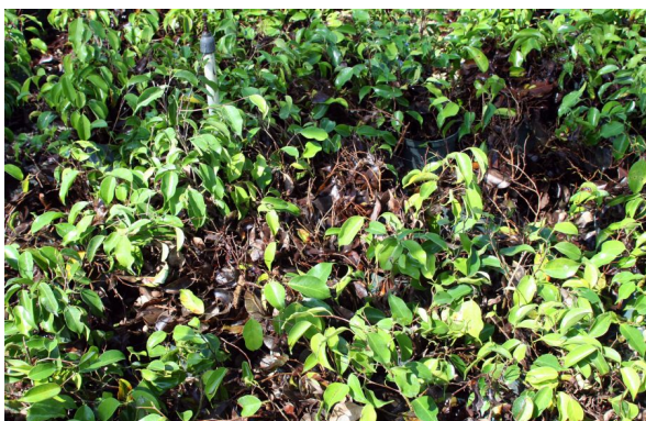
Figure 8. Excess water on ficus.

green or pale yellow-green areas in leaves because of root oxygen deficiency (Fig. 8). Oxygen-starved roots do not function properly and are unable to withdraw water and nutrients from the soil. Of course, wet conditions also foster the development of root-rot fungal diseases, which will be described further in Guidelines for Identification and Management of Plant Disease Problems: Part II. Diagnosing Plant Diseases Caused by Fungi, Bacteria and Viruses ( http://edis.ifas.ufl.edu/MG442 ).