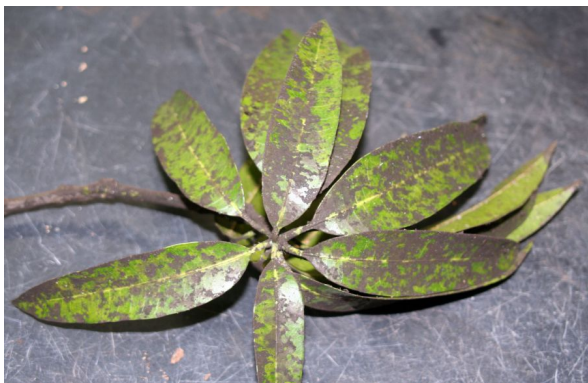
Figure 3. Sooty mold.

behind--and sooty mold , associated with sucking insects. Sooty mold is the black superficial growth of a fungus on the honeydew or other material excreted by sucking insects, such as aphids or mealy bugs (Figure 3). The fungus growing on the excretion is not harmful to the plant. When sooty mold is found, the Master Gardener should examine the plant more closely for the presence of insects such as aphids, using a hand lens if needed.