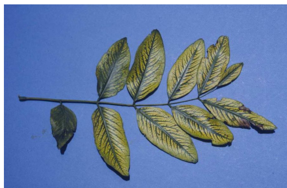
Figure 11. Manganese (Mn) deficiency on Cassia fistula .

Excess minerals may also injure plants. Toxicity from excess Cu and B are particularly noteworthy. Excess Cu or B fertilizer sprays may result in necrotic leaf spots on leaves that can easily be confused with fungal leaf spots or contact pesticide damage. In these cases, damage is greatest where droplets of the fertilizer spray accumulate, such as leaf tips. If excessive B fertilizer has been applied to the soil, B toxicity symptoms include marginal or tip necrosis on the oldest leaves.