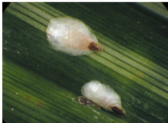
Figure 1. Oleander Scale.

spot. Even smaller insects like scales (Fig. 1) and related parasites such as mites can be readily seen with a 10x power hand lens. Insect damage is also conspicuous, often consisting of holes in leaves or fruit, leaves with a ragged appearance due to insects chewing along leaf margins, or deformed leaves (Fig. 2).