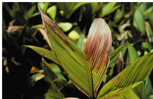
Figure 6. Drought stress on Geonoma.

dark colored. Drought symptoms vary, depending on the plant species. Common symptoms include leaf tip and marginal necrosis (Fig. 6), or an overall dehydration that is usually indicated by a color change. For example, St. Augustine grass suffering from drought will turn blue-gray or green-gray, and the leaves will fold in half longitudinally.