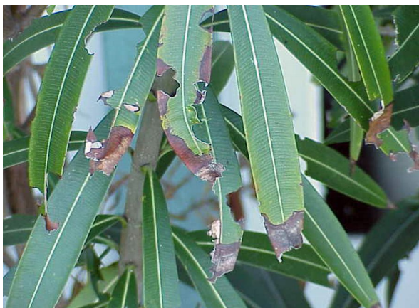
Figure 2. Caterpillar damage.

behind--and sooty mold , associated with sucking insects. Sooty mold is the black superficial growth of a fungus on the honeydew or other material excreted by sucking insects, such as aphids or mealy bugs (Figure 3). The fungus growing on the excretion is not harmful to the plant. When sooty mold is found, the Master Gardener should examine the plant more closely for the presence of insects such as aphids, using a hand lens if needed.