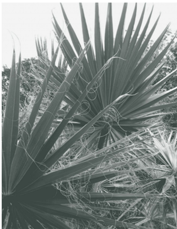
Figure 2. Washingtonia filifera leaves - note filaments hanging from leaf margins.

Palms are increasingly appreciated by consumers. Cold hardy palms are in great demand and the nursery industry is responding with additional production. Currently, palms that are most widely available are in the genera Butia (pindo palm), Chamaedorea (parlor palm), Livistona (fan palm), Phoenix (date palm), Rhapidophyllum (needle palm), Rhapis (lady palm), Sabal (palmetto), Serenoa (saw palmetto), Syagrus (queen palm), Trachycarpus (windmill palm), and Washingtonia (washington palm; Figure 2). Refer to Table 1 for specific species and their cold hardiness information. Other cold hardy palms may be found at better garden centers and specialty nurseries.