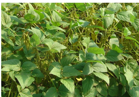
Figure 2. Soybean in vegetative state

also be used for biodiesel. However, the planting and management knowledge is already in place for soybean and it is one of the easiest crops to grow because it makes a good rotation crop with corn or cotton. The procedure for processing these crops into oil is fairly simple and can be done on-farm with small extruders. Oil extracted from soybean can be washed with water and undergoes an esterification process which removes glycerin and allows the oil to perform like traditional diesel. Initially most of this biodiesel may be destined for use in farm equipment, but U.S. automakers are now embarking on putting small diesel engines in passenger vehicles, which will create more demand for diesel as well as biodiesel. Many tractor manufacturers already have warranties on tractors that use blends up to 5-15% biodiesel. Biodiesel provides power similar to conventional diesel fuel, is cleaner burning and has a higher lubricating effect than petroleum diesel.