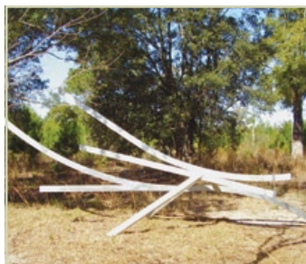
Shoal Sanctuary Mossy Head, FL