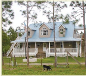
Farmer Brown's Bed & Breakfast Brooksville, FL