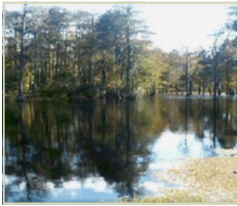
DP Nature Tours White Springs, FL