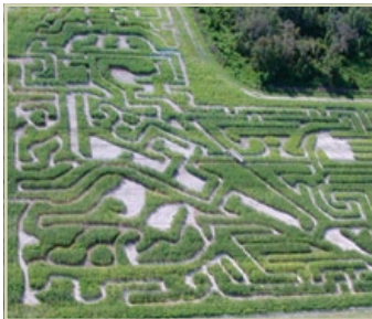
Long & Scott Farms and Corn Maze Adventure Mount Dora, FL