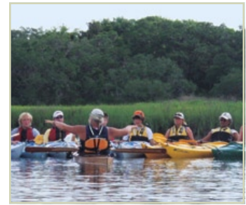
Kayak Amelia Jacksonville, FL