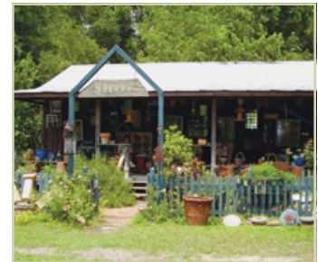
O'Toole's Herb Farm Madison, FL