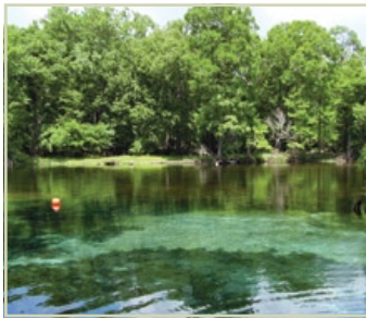
Ginnie Springs Outdoors, LLC High Springs, FL