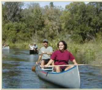
Ichetucknee Family Canoe and Cabins Fort White, FL