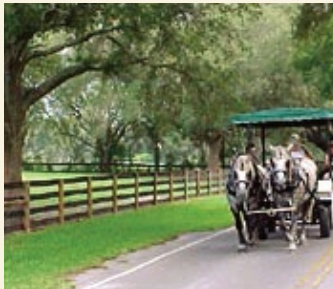
Ocala Carriage & Tours Ocala, FL