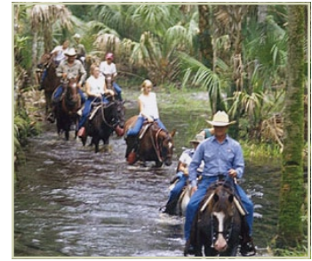
Florida Eco-Safaris St. Cloud, FL