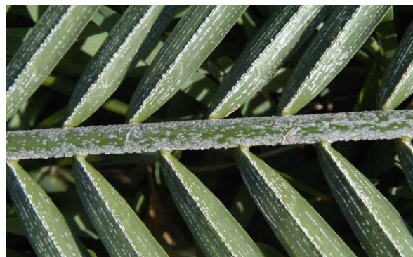
Figure 9. White scurf on young leaf of Phoenix roebelenii .

In some palms (e.g., Wodyetia bifurcata , Veitchia spp.) black-colored scurf appears at the bases of the petioles (Fig. 10). This black scurf is very similar in appearance to the sooty mold often associated with palm aphids, scales, or mealybugs. In other palms, new spear leaves and young petioles are covered with a thick pinkish to brown fuzzy scurf that is easily rubbed off. The light salmon-colored scurf on new growth of Latania palms (Fig. 11) is useful in distinguishing this species from the similar Bismarck palm ( Bismarckia nobilis ), which has very little scurf.