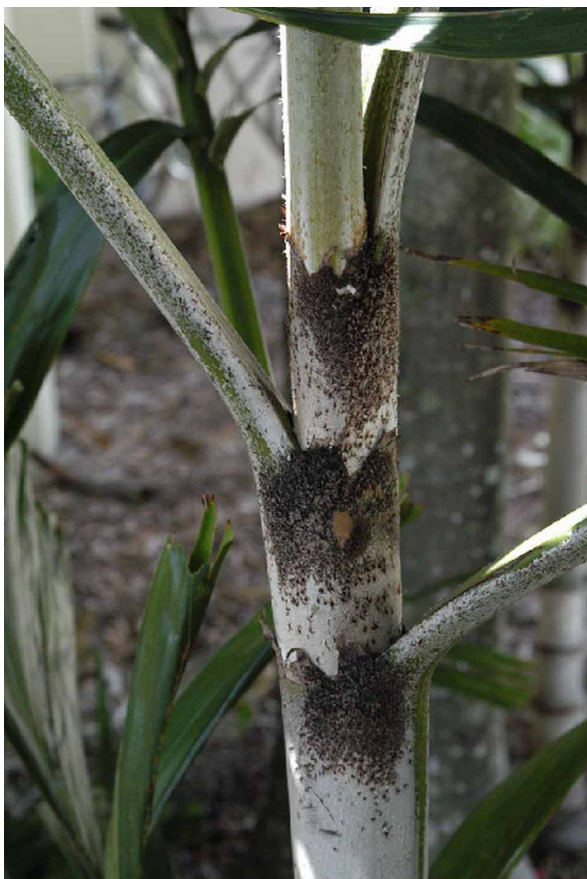
Figure 10. Black scurf on crownshaft of Veitchia sp.