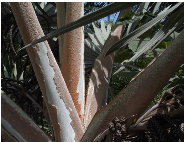
Figure 11. Pinkish scurf on spear and petioles of Latania lontaroides .