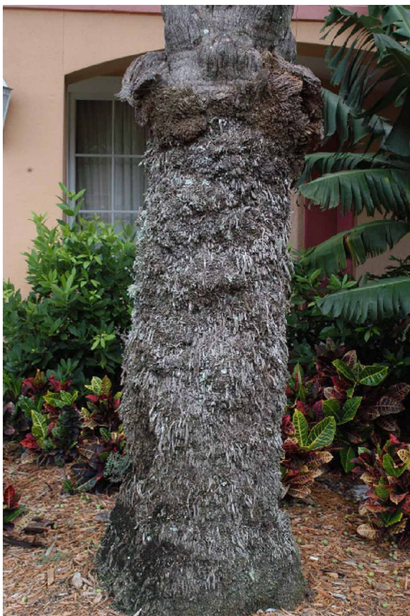
Figure 2. Root initiation zone extending several feet up the trunk in Phoenix dactyifera .