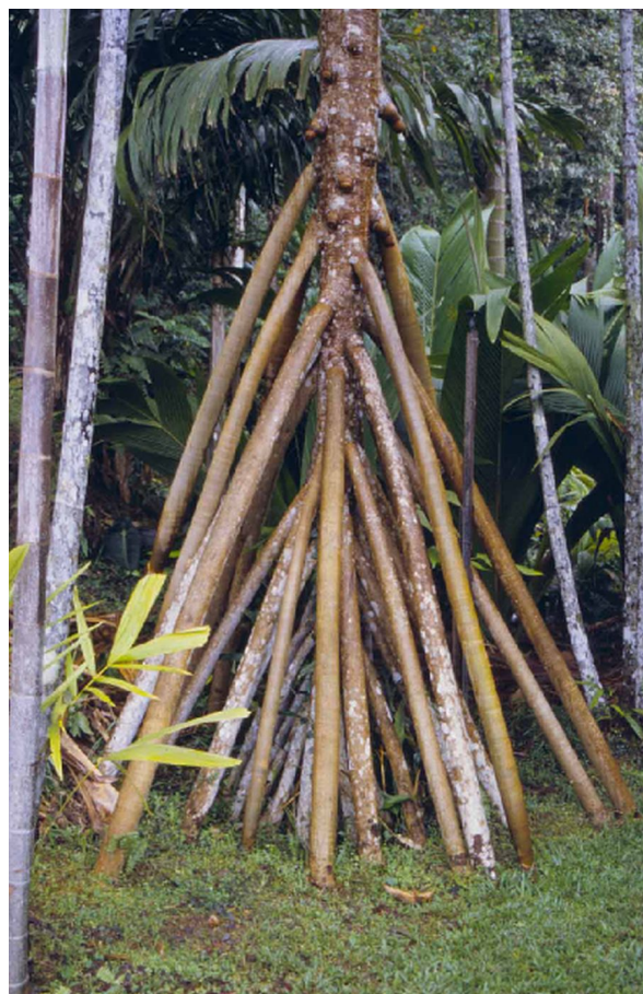
Figure 4. Stilt roots on Iriartea sp.

largely confined to palms within the genera Iriartea , Socratea , and Verschafeltia .