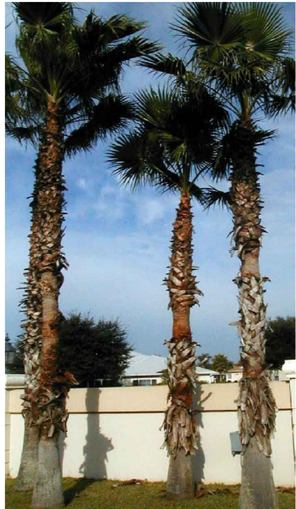
Figure 6. Older (10-15 years old) Washingtonia robusta dropping old leaf bases.

In sabal palms ( Sabal palmetto ), people often ask why some trunks are smooth and others have an