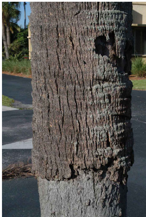
Figure 8. Eroded trunk cortex of old Sabal palmetto .

Many people, when they first look closely at a young leaf of a pygmy date palm ( Phoenix roebelenii ), believe that they are seeing a severe infestation of a scale insect (Fig. 9). These white, elongated, slightly-raised "objects" are all longitudinally oriented along the axis of the rachis and leaflets of relatively young leaves in this species. As the leaves age, this scurf eventually falls off.