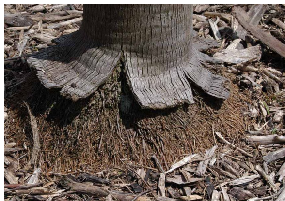
Figure 3. Flared "bark" caused by development of root initials underneath.

A few genera of palms, commonly referred to as stilt palms, normally produce a few large-diameter roots from the above-ground portion of the root initiation zone. Unlike most aerial root initials, those in stilt palms can continue their development, even in the absence of a moist soil environment. These large roots grow downward into the soil, supporting and anchoring the palm stem above ground. These roots are referred to as stilt roots (Fig. 4). Stilt roots are