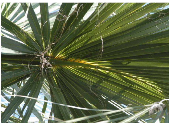
Figure 13. Translucent area on leaf of Sabal palmetto .

normal in appearance, but may occasionally show some crumpling. Subsequent leaves will appear normal.