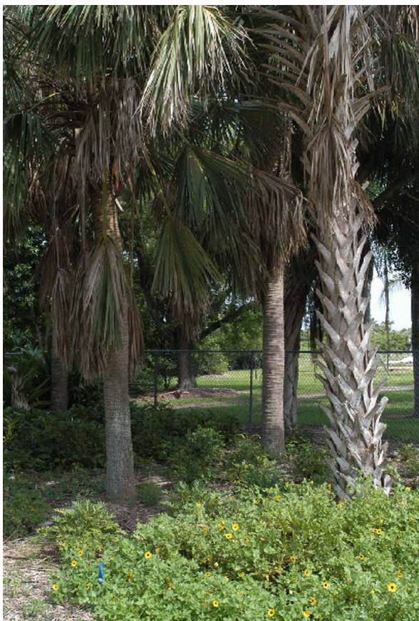
Figure 7. Smooth and "booted" trunks on Sabal palmetto of similar ages.

tissue that is in the process of falling off. This erosion of the softer cortical tissue from the outside of the trunk is considered normal for older specimens of some species. In most cases the central cylinder, which contains fibers and vascular tissue, remains intact due to the high concentration of sclerified fibers. Loss of sections of palm trunk cortex does not seem to negatively impact palm structural strength or the uptake of water and nutrients, although it certainly can be unsightly.