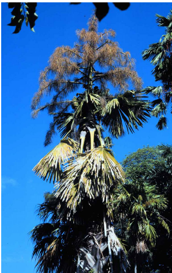
Figure 16. Terminal flowering in mature Corypha sp. It will die after fruiting.