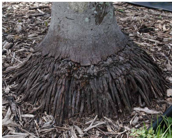
Figure 1. Typical aerial portion of the root initiation zone on a mature palm.

environment and their growth and development are arrested. These root initials can resume growth at any time if their environment becomes moist enough to support their growth. Although the visible aerial portion of the root initiation zone on most palms extends up the trunk no more than six to 12 inches (Fig. 1), on some date palms ( Phoenix spp.) the root initiation zone can extend several feet up the trunk (Fig. 2).