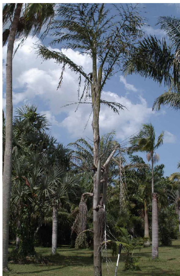
Figure 17. Dead Caryota urens that has just completed its fruiting.