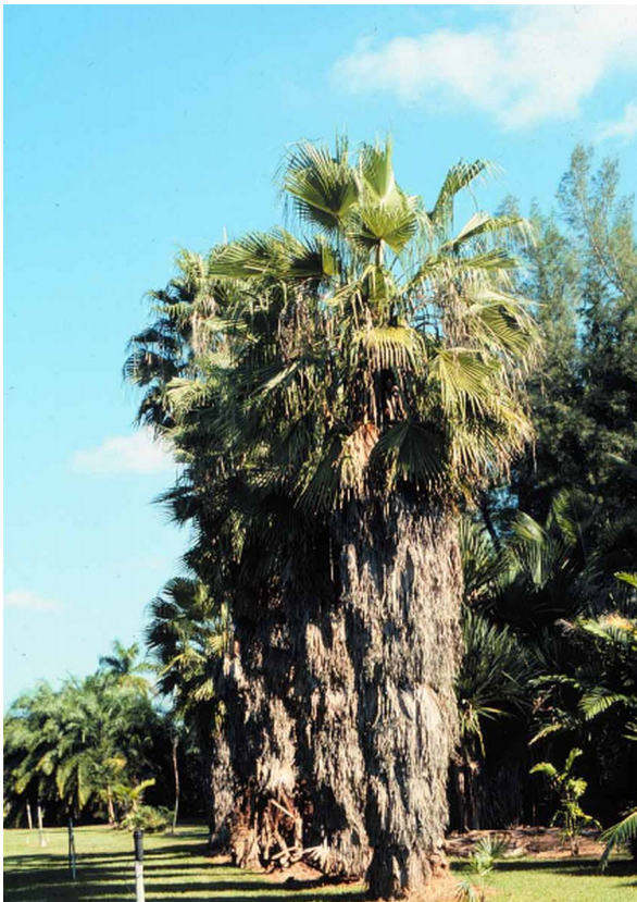
Figure 5. Young Washingtonia robusta showing skirt of retained dead leaves.

When Mexican fan palms ( Washingtonia robusta ) are relatively young (less than 10 years old), old dead leaves remain firmly attached to the trunk, forming a skirt of dead leaves (Fig. 5). If these leaves are cut off at the petioles, the leaf bases will also remain tightly attached to the trunk. After these palms reach a certain age or stage of maturity (about 10-15 years in Florida), these old leaves or leaf bases will suddenly begin to fall off in large numbers, leaving gaps in the skirt of leaves or leaf bases (Fig. 6). Within a year or so, virtually all of the old dead leaves and leaf bases will have been shed, leaving a clean trunk with a canopy of living leaves at the top. Once this stage of maturity is reached, the palm becomes largely self-cleaning, that is, old leaves will fall off naturally as they die rather than having to be cut off manually.