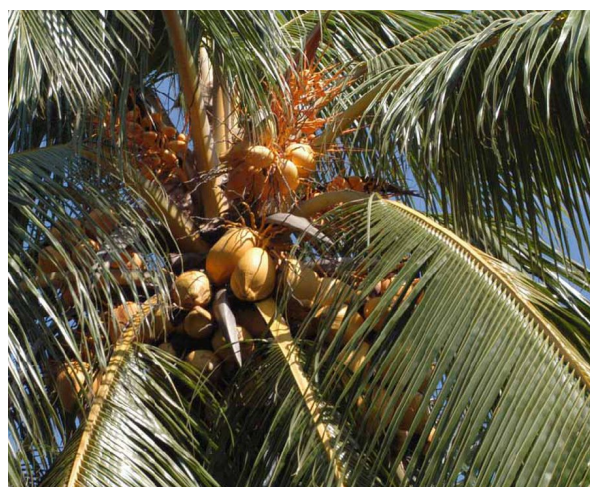
Figure 15. Normal golden yellow colored petioles, rachi, and inflorescences in 'Golden Malayan Dwarf' coconut palm.

Although golden yellow petioles and crownshafts in areca palms are an indication of nitrogen deficiency, this same pattern on some cultivars of coconut palms is genetically determined and thus is perfectly normal for the variety (Fig. 15). For example, in coconut cultivars such as 'Golden' (= 'Red') 'Malayan Dwarf', 'Yellow Malayan Dwarf', and 'Red Spicata', properly fertilized specimens will have light yellow to intense orange-red colored petioles, rachi, inflorescences, and immature fruits. Leaflets on these palms should have dark green lamina, but the midvein can be yellow. If the leaflets are not green, that is an indication of a nutrient deficiency.