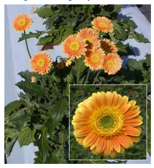
Figure 1. Flowers and plants of 'UF Multi-flora Peach' gerbera grown in a raised bed.

lobed, with deep lobes on the base, medium in the central part and slight at the apice. The flowers were semi-double and 3 1/2 inches in diameter. The average peduncle height of immature and mature flowers is 14 and 18 inches, respectively. The disc florets were a deep bright yellow and the inflorescence center light yellow. The upper surfaces of the outer ray florets were orange-red diffusing into yellow.