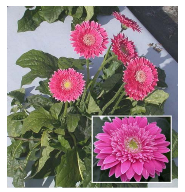
Figure 2. Flowers and plants of 'UF Multi-flora Pink Frost' gerbera grown in a raised bed.

Plant growth and flowering of 'UF Multi-flora Peach' and 'UF Multi-flora Pink Frost' were compared to 'Revolution Formula Mix' and 'Louisville'. 'Revolution Formula Mix' is a popular