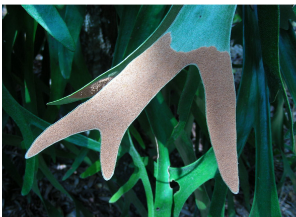
Figure 3. Underside showing sporangia