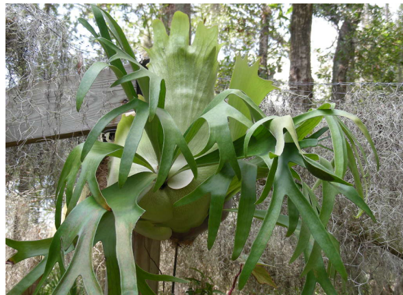
Figure 4. Small staghorn

at local nurseries. As you become accustomed to their culture and growth habits, you can start to acquire some of the harder-to-grow and more expensive species. A partial list of species is provided below with specific cultural information and notes on their ease or difficulty in growing.