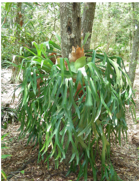
Figure 1. Big staghorn

Once uncommon, staghorn ferns are now popular and widely available. They are ideally suited to south Florida's growing conditions and will grow well in central and north Florida provided care is given to protect them from freezing temperatures.