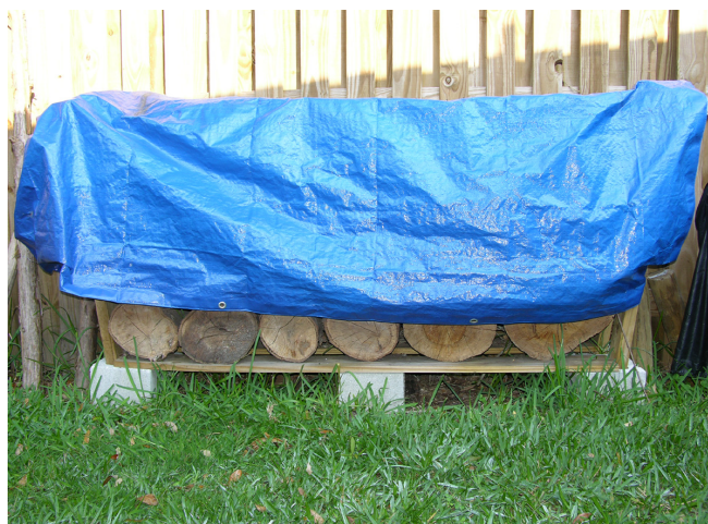
Figure 1. Firewood should be stacked neatly on a rack. Wood piles on the ground provide many hiding spots for snakes.

First, you should address your yard – do you have tall grass, overgrown shrubs or piles of brush, debris, or wood? If so, these may provide hiding spots for snakes, and tall grass can make it difficult to watch your step. Keep your grass mowed, and keep shrubs and tree branches trimmed away from the house. Do not mow to the edge of lakes or ponds, as this will destroy important habitat for frogs, turtles, and birds – rather, warn children to stay away from the water unless accompanied by an adult and keep pets away from these areas. Installing chain-link or privacy fence is an effective solution to keep pets and children away from wetland and lake edges. You should not completely remove brush piles and vegetation from your yard because these can provide habitat for wildlife, but should keep brush piles well away from buildings and areas where children play. Piles of firewood should also be moved away from these areas, and firewood should be stored neatly on a rack, rather than on the ground (Figure 1).