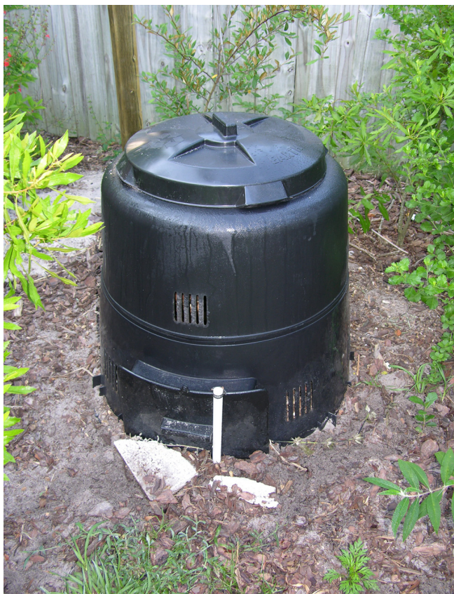
Figure 6. Mulch piles and compost bins can be inviting to rodents, which may attract snakes. Sturdy, sealed containers such as this can help to "rodent-proof" your yard. Note the PVC pipe used to hold the door securely in place.

If you frequently encounter venomous snakes and find that the measures described above do not deter them, you may consider using fencing in some areas (i.e., along edges of wooded areas or margins