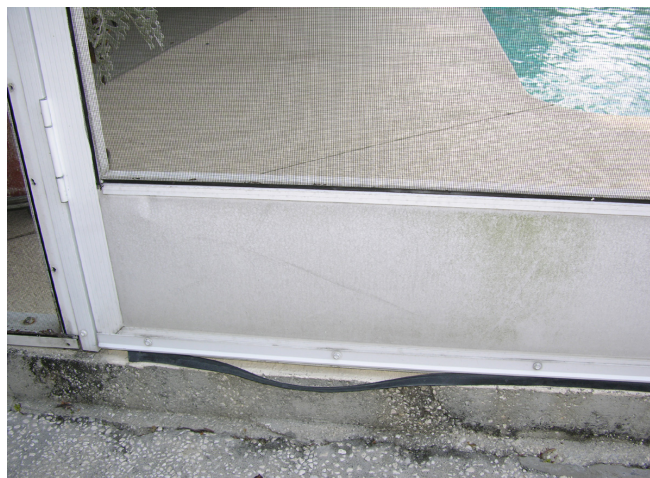
Figure 3. Door sweeps can prevent snakes from inadvertently slipping into the home under a door, but must be checked periodically. This rubber door strip is in disrepair, leaving large gaps beneath the door.

access holes can be fitted with secure doors, and plumbing vent stacks or other potential roof access points can be protected with inexpensive hardware cloth (Figure 5).