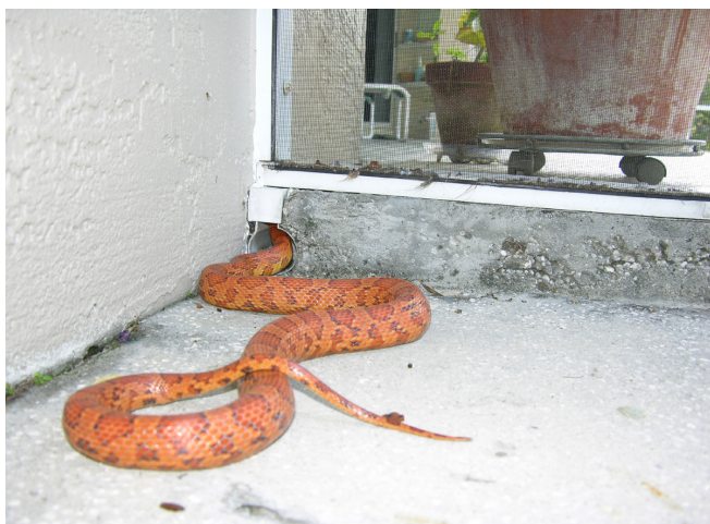
Figure 2. Uncovered holes, such as this patio pool drain are inviting hiding spots for snakes in search of a cool place to rest, and can allow a snake access to your home.

Next, you should examine your house, garage, shed (or other outbuildings), and porch. Are there gaps under doors, holes in walls, or openings on your roof that might allow snakes to easily enter your home? Are there any holes or gaps in the screens on your windows, doors, or porch, or open drain pipes from enclosed pools? Snakes may enter garages, basements, or attics in search of prey if rodents are present or may simply slip in through a drain pipe or crack under a door in search of a cool hiding spot (Figure 2).