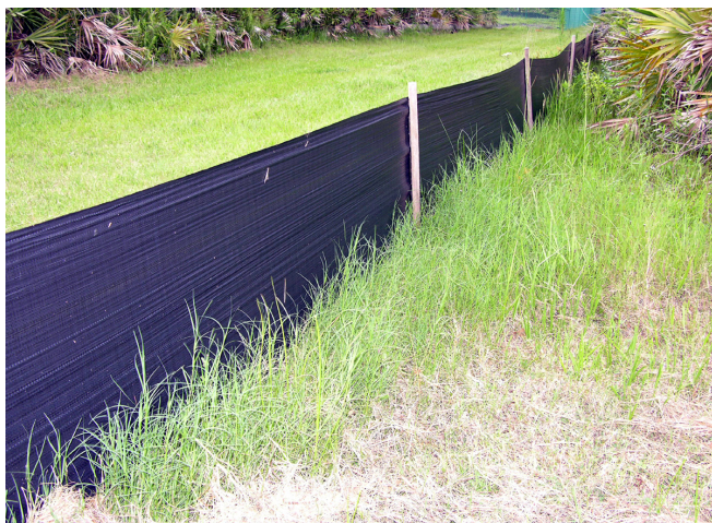
Figure 7. Snake fences, such as this one made of silt fencing, can prevent some snakes from entering your yard when used correctly, but can be costly and time consuming to install and do not prevent all species of snakes from entering. Such measures should only be used as a last resort.

posts already attached) are commonly available at hardware stores.