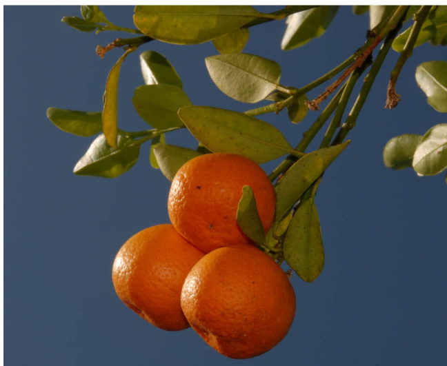
Figure 3. Honey bees are important pollinators of the nation's crops. Pollen adheres to bee's bodies when they visit flowers (like this citrus flower in picture a). As they go from flower to flower, they transport the pollen between flowers, thus pollinating the flower. Flowers that are adequately pollinated produce fruit (b), vegetables, or nuts. Higher fruit set, larger fruit, uniformly-shaped fruit, and better taste are all indications of successful pollination.