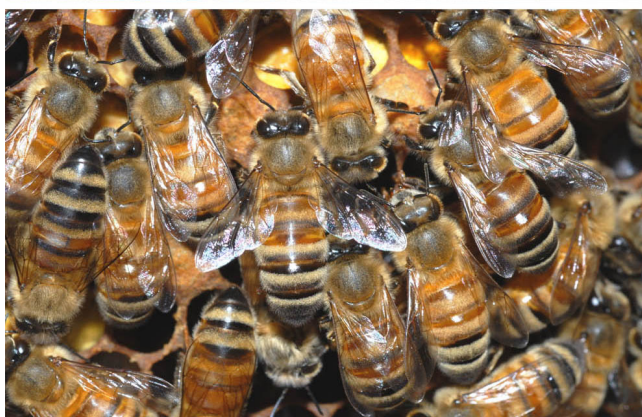
Figure 2. Healthy colonies of bees (a) contain thousands of worker bees (b). Colonies suffering from Colony Collapse Disorder have few or no bees remaining in the hive.