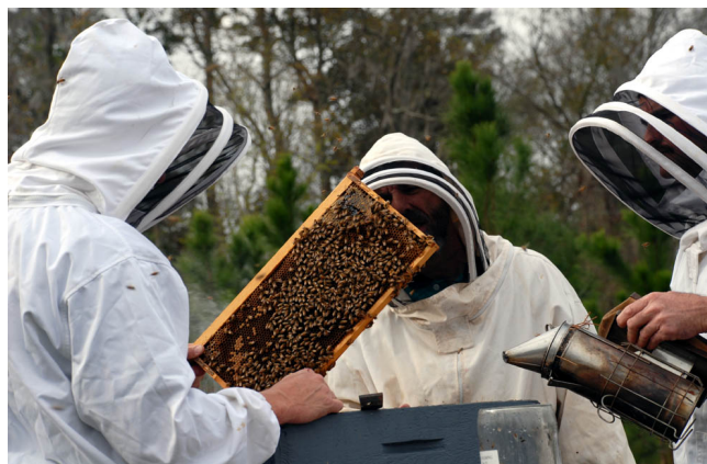
Figure 4. Scientists are trying to determine the source of Colony Collapse Disorder.

In the past, most of the work on CCD has been conducted by those affiliated with the CCD Working Group. That is changing as more scientists are beginning to investigate various avenues of CCD. Beekeepers, governmental officials, and scientists from universities, industries, and the USDA have initiated a number of investigations into the possible causes of CCD. At this point, it is safe to assume that most potential causes of CCD are being investigated. In addition to this, many granting agencies realize the importance of honey bees and have begun to distribute research funds in an effort to find the cause and a cure.