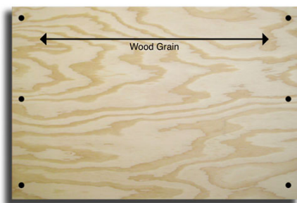
Plywood is strongest in the direction of its wood grain.

Due to the temporary nature of plywood shutters, the panel weight, and the installation labor required, we recommend using them as a last resort. Pick up our “Install Window Shutters” document to review other options.