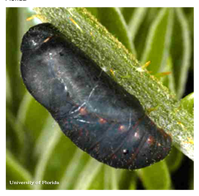
Figure 4. Pupa of the Miami blue butterfly, Cyclargus thomasi bethunbakeri (Comstock & Huntington).

Females lay the small eggs singly on the terminal growth and developing flower stalks of gray nickerbean, Caesalpinia bonduc Roxb. (Caesalpiniaceae) or on the developing seed pods of balloon vine Cardiospermum spp. (Sapindaceae). The extant Bahia Honda State Park population only utilizes gray nickerbean.