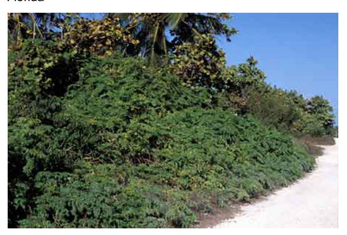
Figure 6. Habitat of the Miami blue butterfly, Cyclargus thomasi bethunbakeri (Comstock & Huntington), in Bahia Honda State Park in the Lower Florida Keys.