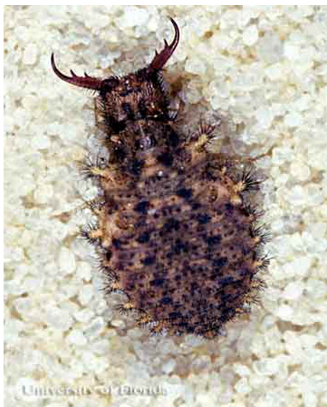
Figure 2. Larva of Glenurus sp., an antlion.

The authors found as many as three Glenurus larvae in one hollow, and in one instance, a larva of Dendroleon obsoletus (Say) was coinhabiting. Natural enemies and parasites are unknown. Larvae complete their life cycles in one or two years, depending upon the abundance of food and the duration of warm nights in their habitat during the year. Of two larvae reared by the authors, both