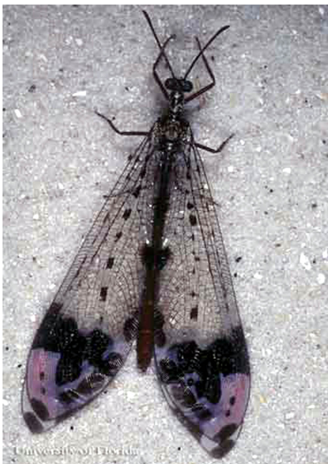
Figure 1. Adult Glenurus gratus (Say), an antlion.