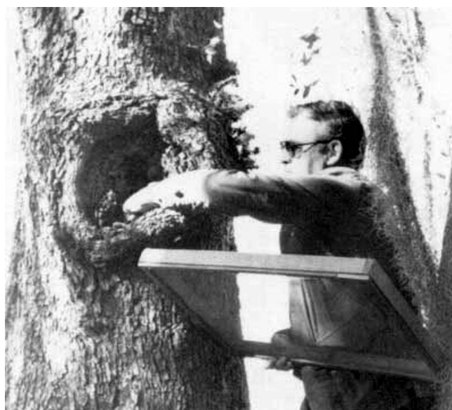
Figure 6. Typical habitat of the larvae of Glenurus gratus (Say) , an antlion.