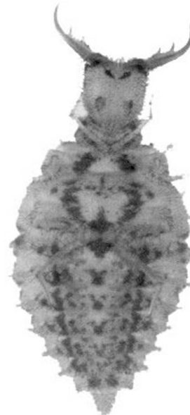
Figure 3. Ventral view of larvae of Glenurus gratus (Say), an antlion.

constructed cocoons measuring 13 mm in diameter which were completely but shallowly buried beneath the debris. Cocoon construction to emergence of the adult required 28 days in both instances.