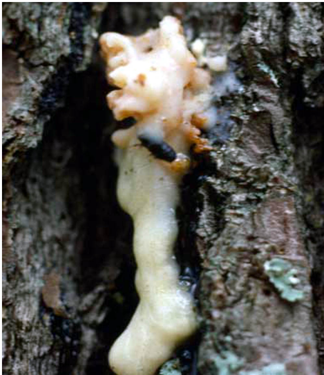
Figure 13. Pitch tube, a possible sign of an Ips engraver beetle infestation.

involve promoting tree vigor and reducing the amount of vulnerable host material within the stand.