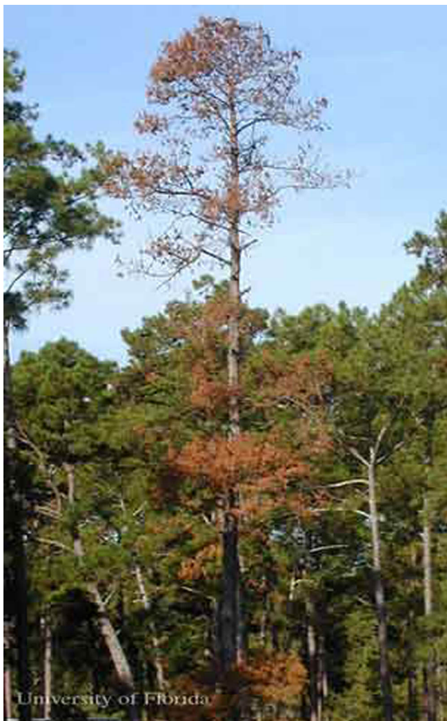
Figure 10. Fading crown, a possible sign of an Ips engraver beetle infestation.

Often the first noticeable indication of an Ips infestation is the fading of foliage from green to yellow to reddish brown as the host tree wilts due to plugging of the xylem by blue-stain fungi.