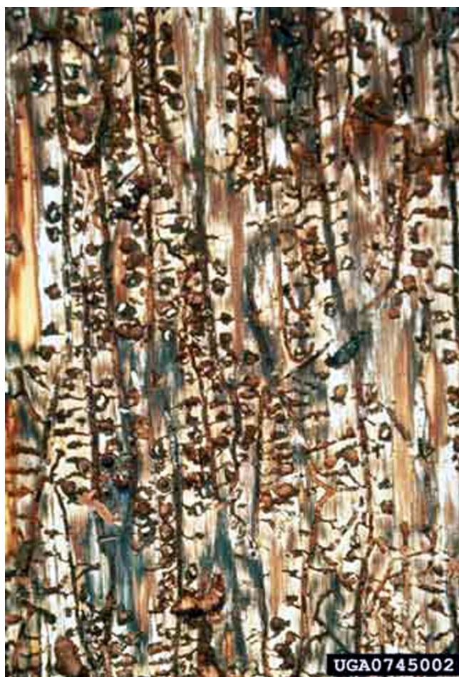
Figure 9. Inner bark gallery characteristic of Ips avulsus (Eichhoff).

The three species of Ips tend to colonize different parts of the tree, although there is considerable overlap between these territories (Coulson and Witter 1984). I. calligraphus usually attacks the lower bole or portions of stumps, trunks, and large limbs greater than 10 cm (4 in) in diameter (Connor and Wilkinson