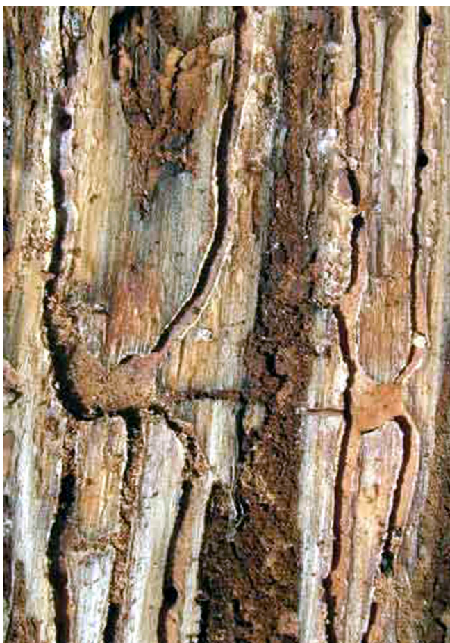
Figure 8. Inner bark gallery characteristic of the eastern five-spined ips, Ips grandicollis (Eichhoff).

as four miles in their first dispersal flight to find a new host tree (Kinn 1986).