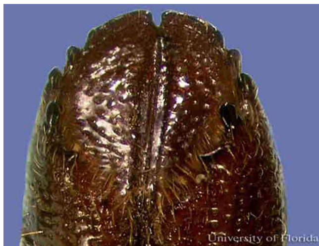
Figure 4. Dorsal view of the elytral apices of an adult eastern fivespined ips, Ips grandicollis (Eichhoff).

Larvae: Larvae are small, whitish, legless, and grub-like with reddish colored heads that are <1 mm wide.