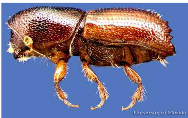
Figure 5. Adult small southern pine engraver, Ips avulsus (Eichhoff).