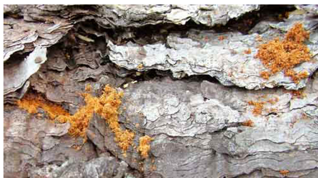
Figure 12. Boring dust, a possible sign of an Ips engraver beetle infestation.

If there is sufficient resin pressure within the host, attacked trees will exhibit dime-sized, whitish or reddish-brown globs of resin and boring dust called "pitch tubes" on the bark at each point of beetle attack.