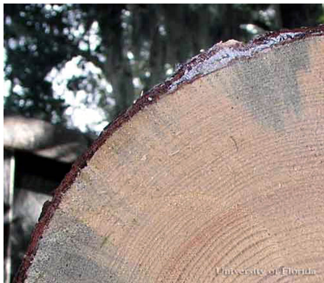
Figure 11. Blue-stain fungi in the sapwood, emanating from an Ips gallery in the phloem, a possible sign of an Ips engraver beetle infestation.

These color changes can occur in two to four weeks in warm weather, but may take several months in the winter. In cooler weather, the beetles have frequently vacated the tree by the time the needles fade. Early signs of attack include the accumulation of reddish-brown boring dust on the bark, nearby cobwebs, or understory foliage.