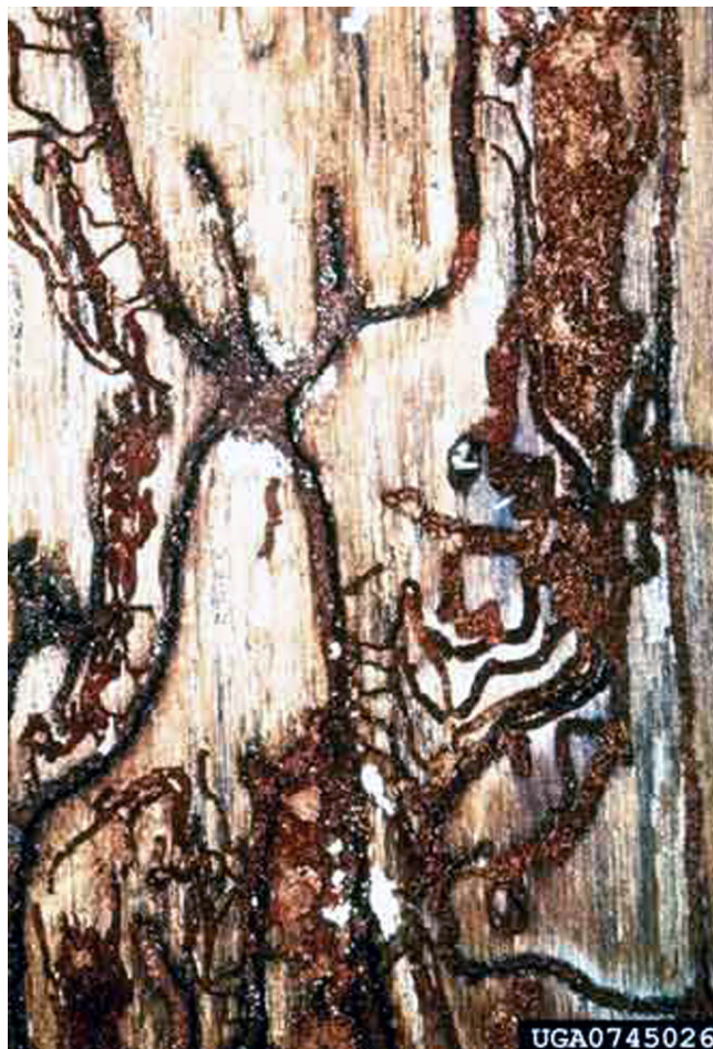
Figure 7. Inner bark gallery characteristic of the sixspined ips, Ips calligraphus (Germar).

The adult male bores into the phloem and excavates a nuptial chamber, where it mates with one to five (commonly three) females. After mating, each female excavates an egg gallery that extends away from the nuptial chamber and usually parallel to the wood grain, resulting in an overall I-, H- or Y-shaped gallery pattern.