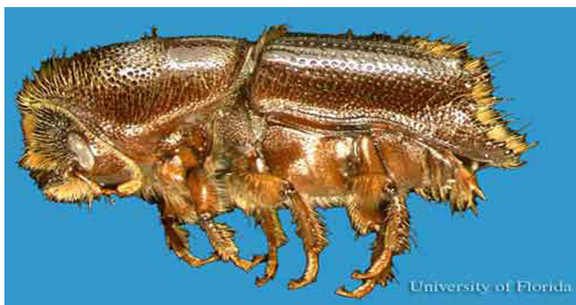
Figure 1. Adult sixspined ips, Ips calligraphus (Germar).

Sixspined ips, I. calligraphus , 3.5 to 6.5 mm long, six spines per side.