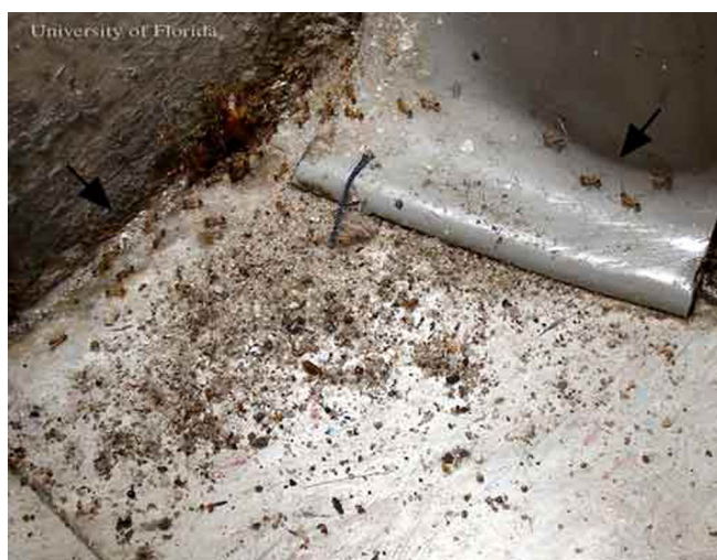
Figure 2. Debris caused by bigheaded ants, Pheidole megacephala (Fabricius), inside a structure on a tiled floor. Arrows indicate trailing ants.