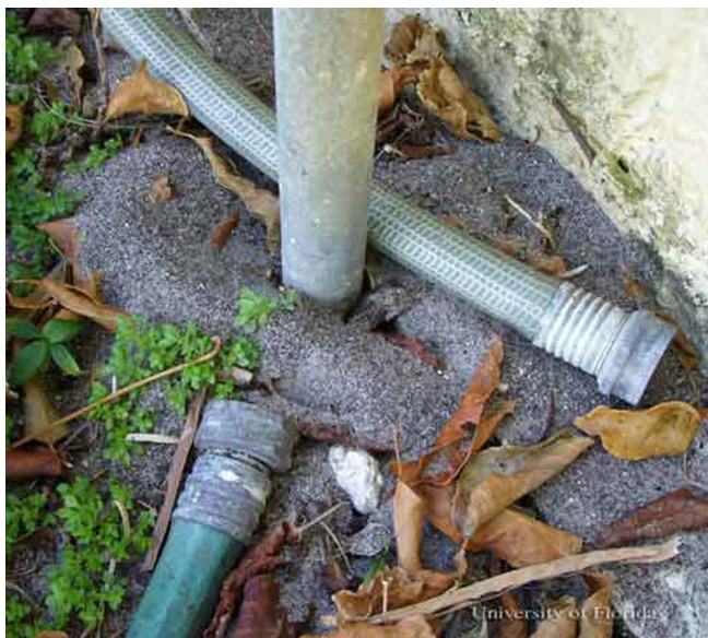
Figure 11. Soil displaced by bigheaded ants, Pheidole megacephala (Fabricius), digging around a water pipe.