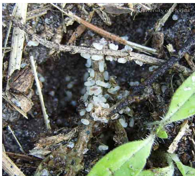
Figure 6. Bigheaded ant, Pheidole megacephala (Fabricius), brood found under a stone on soil.

As with all ants, the BHA has complete metamorphosis (holometabolous). Colonies can have large numbers of fertile queens (Wilson 2003) and year-round brood production in tropical and sub-tropical areas. In some areas, colonies can form a "virtually continuous supercolony that excludes most other ant species" (Wilson 2003). Although Vanderwoude et al. (2000) report that in Australia dispersal of new colonies is through budding without a nuptial flight, in south Florida nuptial flights of alates (winged reproductives) can be observed during the winter and spring (Scheffrahn, unpublished observations). Fertilized queens shed their wings and find a nest site where they will begin laying eggs.