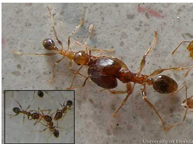
Figure 9. Trophallaxis between major and minor workers, and between two minor workers (insert), of the bigheaded ant, Pheidole megacephala (Fabricius).

The BHA can be found nesting in disturbed soils, lawns, flowerbeds, under objects, such as bricks, cement slabs, or flower pots, around trees or water pipes, along the base of structures, and walkways, where displaced soil is usually observed from the action of ants digging below the surface. Well-cared-for lawns may have BHA infestations that are less noticeable, except along the edges where lawns meet walkways where piles of soil are often deposited. BHA populations expand into neighboring areas by following along these lawn-walkway edges