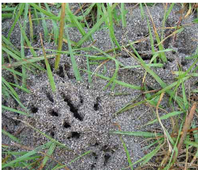
Figure 12. Red imported fire ant, Solenopsis invicta Buren, nest in sandy soil.