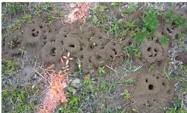
Figure 10. Bigheaded ant, Pheidole megacephala (Fabricius), nest site in sandy soil after rain.

or roadways. Population movements into new areas to establish nests and subsequent displacement of other ant populations can be rapid (Hoffman 2006; Warner, unpublished observations).