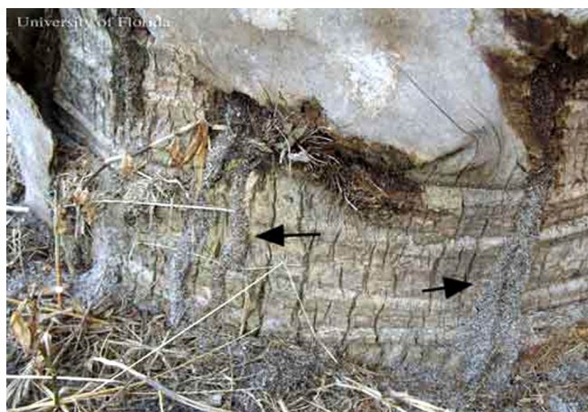
Figure 1. Debris caused by bigheaded ants, Pheidole megacephala (Fabricius), inside a structure on a tiled floor. Arrows indicate trailing ants.