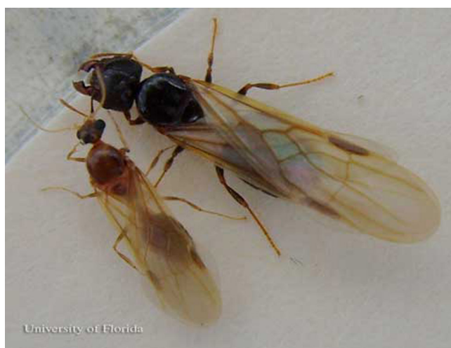
Figure 7. Bigheaded ant, Pheidole megacephala (Fabricius), alates. Male (left), female (above, right). Credits: R.H. Scheffrahn, University of Florida

According to Hoffman 2006, incubation time of eggs ranges from 13 to 32 days. Duration of the larval stage ranges from 23 to 29 days. Duration of the pupal stage ranges from 10 to 20+ days. Life spans of minor workers have been shown to be 78 days at 21°C, and 38 days at 27°C. Queens are reported to lay up to 292 eggs per month.