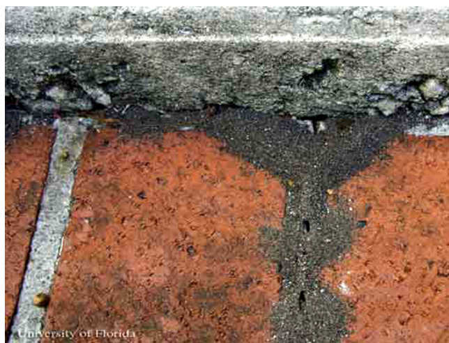
Figure 3. Soil displaced by bigheaded ants, Pheidole megacephala (Fabricius), excavating underneath walkways or driveways.

Workers are dimorphic (major and minor workers). The BHA receives its common name from the large-sized head of the major worker, or "soldier." Minor workers are small (2 mm) reddish brown ants. The majors are much larger (3 to 4 mm), but only constitute about 1% of foragers. The front