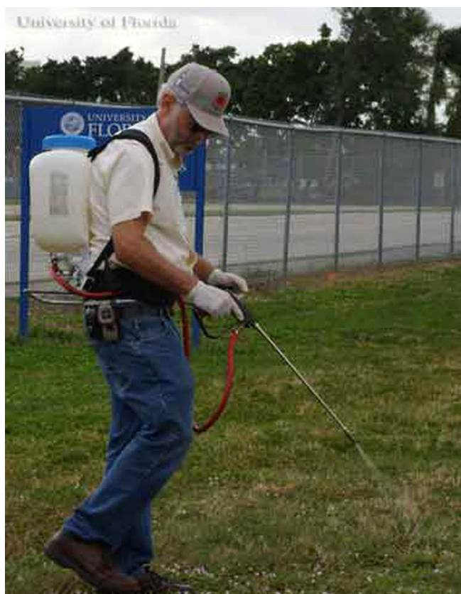
Figure 13. Senior author spraying a residual product on a bigheaded ant, Pheidole megacephala (Fabricius), test plot at the University of Florida's Ft. Lauderdale Research and Education Center.

residential perimeter treatments must have supplemental applications done to the lawns, flowerbeds, around trees, along walkways and on driveways made of bricks. The senior author has spoken to numerous lawn treatment companies and it seems to be a universal policy that ants are not considered to be pests of lawns and these companies will not make treatments for BHA. Even so, since ants are, after all, insects, insecticidal treatments to lawns will most likely have an impact on the ant populations. Since this ant reproduces so prolifically, and nest sites are often protected by being under objects, lawns and flowerbeds will probably need to be treated at least four to five times per year at maximum label rates. One-time treatments for the BHA will be of very limited value.