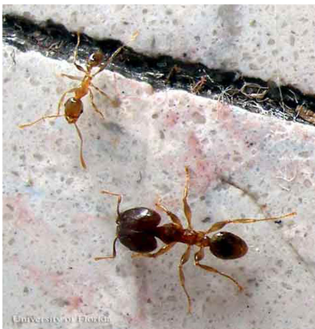
Figure 5. Bigheaded ant, Pheidole megacephala (Fabricius), minor (upper left) and major (lower right) workers.