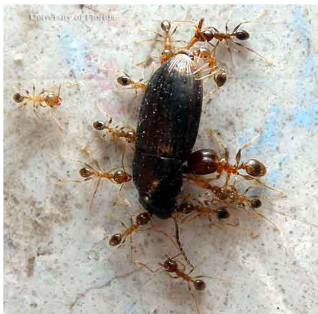
Figure 8. Bigheaded ant, Pheidole megacephala (Fabricius), minor workers and one major worker combine their strength to move a dead beetle.

to a food source. Foraging tunnels having numerous entrances can be seen along the soil surface. Arthropod prey are dissected by workers and brought back to the nest.