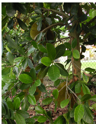
Jackfruit leaves. Fig. 3. Jackfruit leaves.