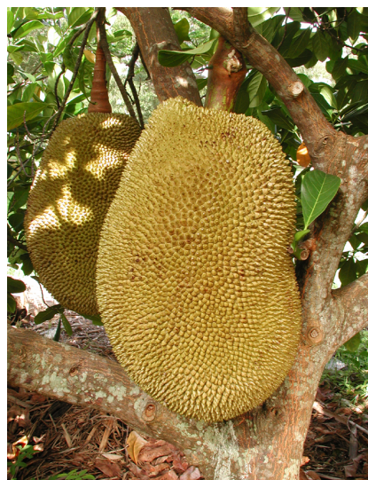
'Black gold' jackfruit. Fig. 5. 'Black Gold' jackfruit.

small fruited, weighing 3 to 10 pounds (1.4-4.5 kg) each. The skin is extremely rough and thick. Fruit skin color is green when immature and green, greenish yellow to brownish-yellow when ripe. The inside of the fruit contains the edible, sweet, aromatic, crispy, soft or melting pulp that surrounds each seed. Between the seeds and edible pulp is the inedible "rag". Pulp color varies from amber to yellow, dark yellow or orange. Seeds are 3/4 to 1 1/4 inches (2 to 3 cm) long, oval; the number per fruit varies from 30 to 500. The time from flowering to fruit maturity ranges from 150 to 180 days.