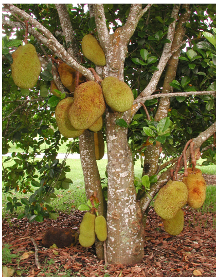
Jackfruit tree. Fig. 2. Seedling jackfruit tree.