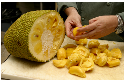
Jackfruit. Fig. 1. Cleaning a ripe jackfruit.