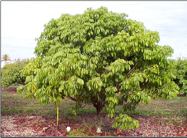
Figure 2.a