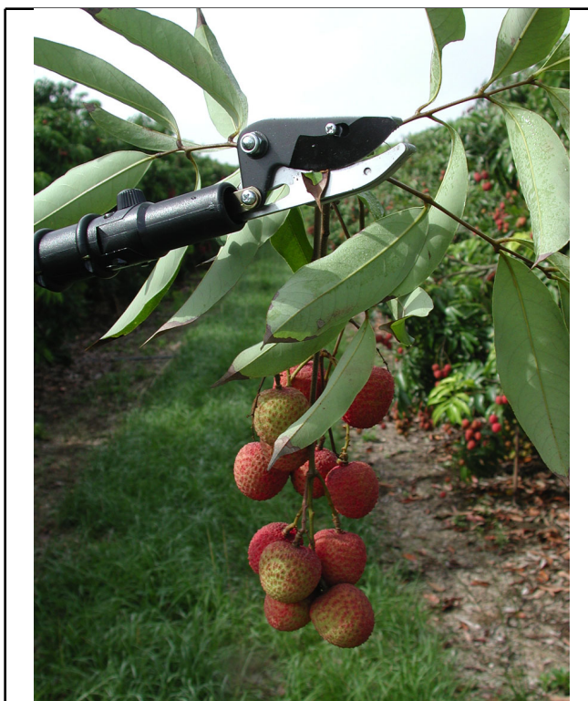
Figure 11.c