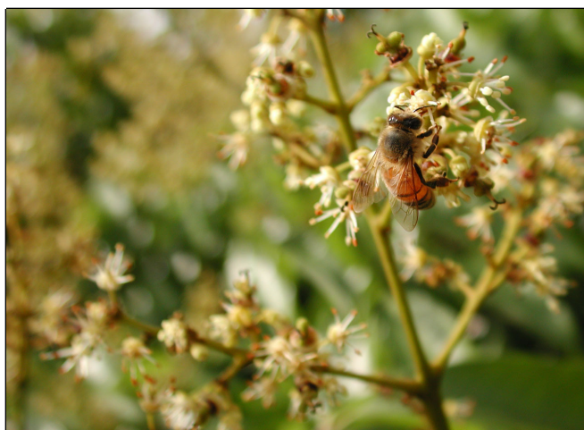
Figure 7.a