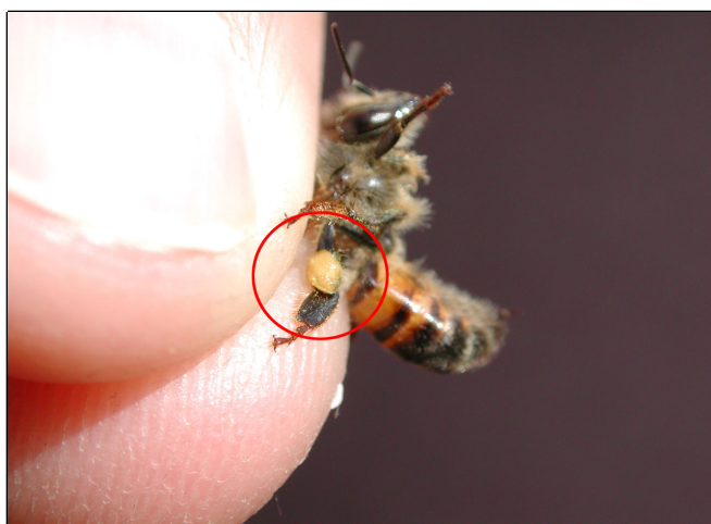
Figure 7.b

Lychee Pollination. Lychee flowers are pollinated by bees and wind.