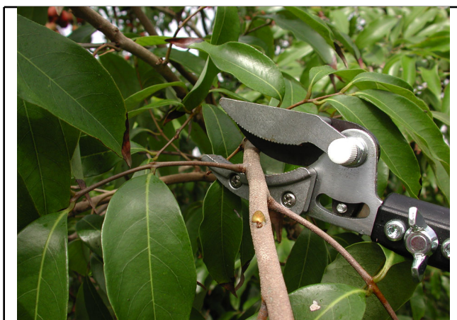
Figure 11.b