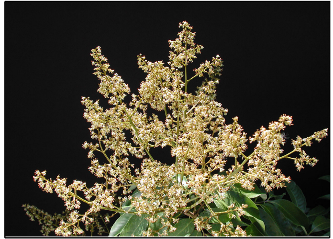
Figure 4.a