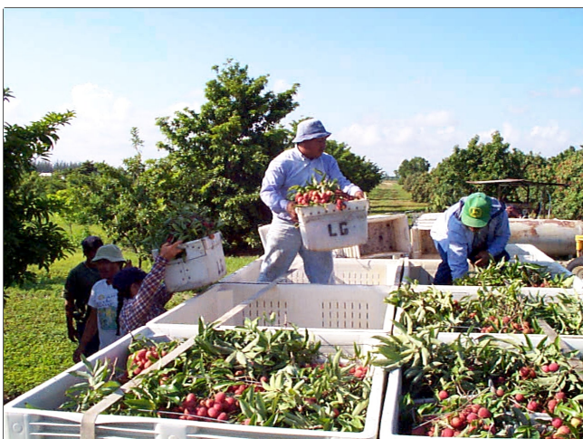
Figure 10.b