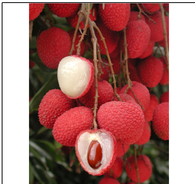
Lychee Fruit. Fig. 4. 'Brewster' lychee fruit.

inflorescence) which emerges at the ends of branches anytime from late December to April (more commonly February and March) in Florida. There are three flower types: two male types (called M1 and M2) and one female (called F). In general, the M1 flowers open first, female flowers (F) open second, and M2 flowers open third.