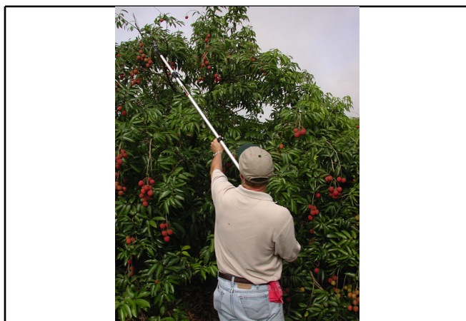
Figure 11.a