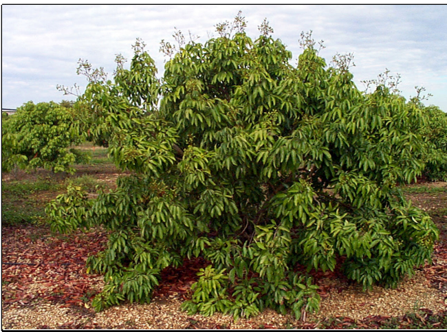
Figure 2.b