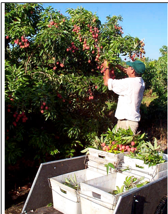
Figure 10.a

Unreliable bearing is the major constraint to lychee production. Cultivars vary greatly in their bearing habit. Mature 'Brewster' trees (15 to 20 ft tall; 4.6 to 6.1 m tall) may bear 200 to 300 lb (91 to 136 kg) of fruit in a good year; however, most trees bear a good crop only about 1 year out of 3 or 4. In contrast, well-cared-for, mature 'Mauritius' trees may bear every year, with good yields in alternating years. On average, yields range from less than 50 lbs to 125 lbs (23-58 kg) per tree per year over a period of years.