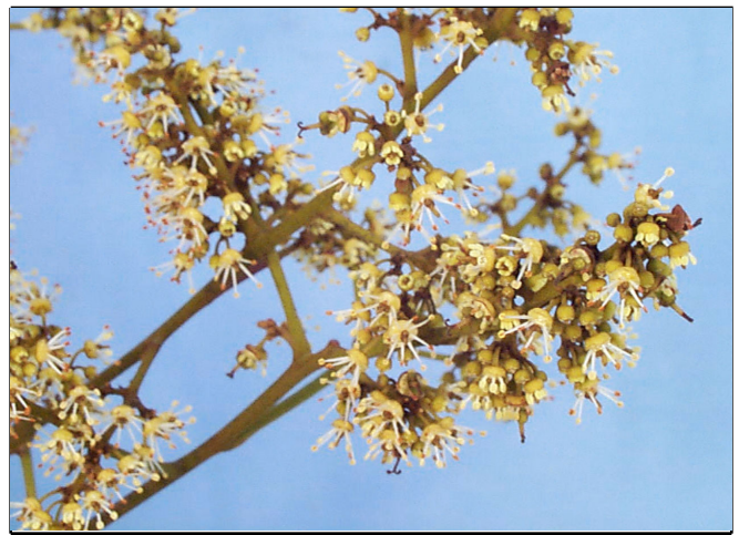
Figure 4.b

Lychee Tree. Fig. 2. Lychee tree and lychee tree in bloom.