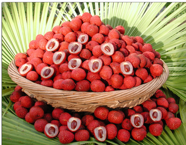
'Brewster' lychees. Fig. 1. 'Brewster' lychee fruit.