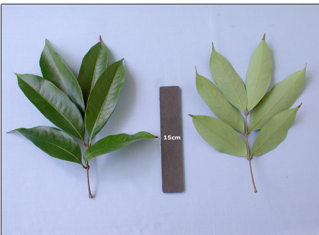
Lychee leaves. Fig. 3. Upper and lower surfaces of the compound lychee leaf.

Lychee Tree. Fig. 2. Lychee tree and lychee tree in bloom.