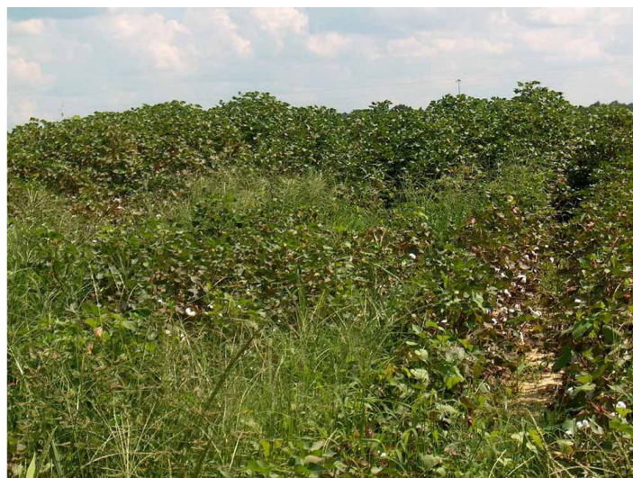
Figure 2. In the forefront are weed problems in the conventional cotton, and in the background are fewer weeds in the sod-rotated cotton.

even weeds that are adapted to certain rotations. Also, by spacing out crops, diverse rotations enable growers to rotate herbicides with different modes of action. This can delay and may prevent the development of herbicide-resistance in weeds. Diverse rotations improve soil health and result in healthier plants that can outcompete weeds. Our studies from Quincy have shown fewer weeds and weed biomass for the sod-based peanut/cotton cropping system. We also observed rapid canopy development and early season weed suppression in cotton and peanuts after bahiagrass. Figure 2 contrasts weed densities for cotton in the traditional peanut/cotton rotation and cotton in the sod-based peanut/cotton rotation. Cotton in the sod rotation grew taller and had better weed suppression compared to cotton in the conventional rotation.