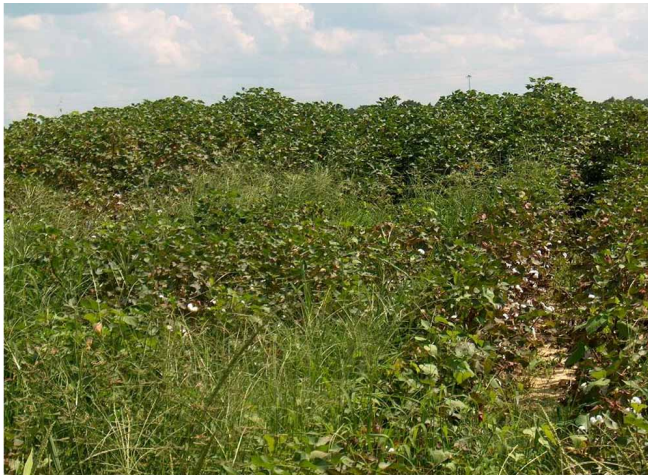
Figure 2. In the forefront are weed problems in the conventional cotton and in the background are less weeds in the sod-rotated cotton.

Sod-Based Peanut/Cotton Rotation-Soil Health Part 1. http://edis.ifas.ufl.edu/AG256