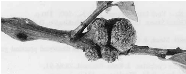
Figure 2. Young spine-bearing potato gall caused by the gall wasp Callirhytis quercusclaviger (Ashmead).

If sufficiently mature, twig galls exhibit spines or horns. Older galls become very woody, discolored, and horns will be absent (Ashmead 1881). Galls are pathologically developed tissues. Cell hypertrophy (over-growth) and hyperplasia (cell proliferation) result in gall formation (Mani 1964).