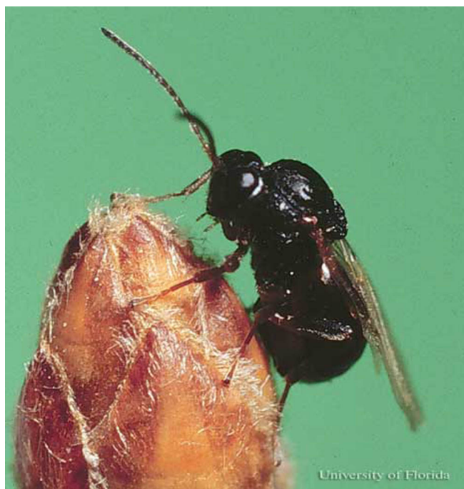
Figure 6. Adult gall wasp, Callirhytis cornigera (Osten Sacken).