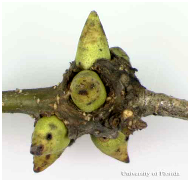
Figure 4. Mature (with horns) spine-bearing potato gall caused by the gall wasp Callirhytis quercusclaviger (Ashmead).