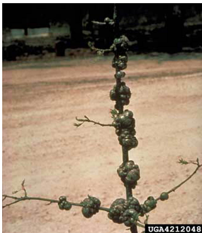
Figure 9. Mature horned oak galls caused by the gall wasp Callirhytis cornigera (Osten Sacken).

Management of these gall wasps is difficult. Prune infested branches where possible. Systemic insecticides may prove somewhat useful. In several large infestations investigated in Florida, the common variables were extremely high densities of laurel oak growing on sandy soils that are deeply