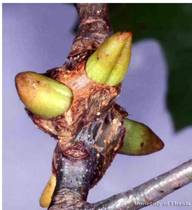
Figure 1. Mature (with horns) spine-bearing potato gall caused by the gall wasp Callirhytis quercusclaviger (Ashmead).

Generally, individual trees or small groups of trees become slightly to moderately infested by these Callirhytis spp. Widespread infestations are not common (Kinsey 1935). However, severe gall wasp infestations have been observed in several Florida counties. Extremely high numbers of twig galls of C. quercusclaviger have occurred on thousands of laurel oaks in several locations. These infestations have affected young to mature trees in woodlands and residential areas. The overabundance of twig galls has resulted in notable levels of branch dieback, crown thinning, and tree mortality.