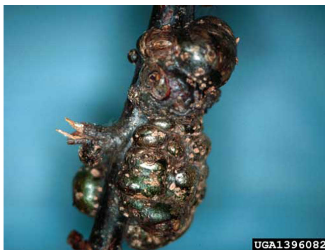
Figure 10. Young horned oak galls caused by the gall wasp Callirhytis cornigera (Osten Sacken).

drained, strongly acidic, and with low fertility (e.g., Alpin and Blanton soils). The high oak density apparently resulted from exclusion of fire – laurel oak is very susceptible to fire (Fowells 1965). Today, laurel oaks are often considered weeds due to their success in establishment and resulting densities. The stress of an ongoing, multi-year drought cycle may exacerbate the effects of the galls on the trees.