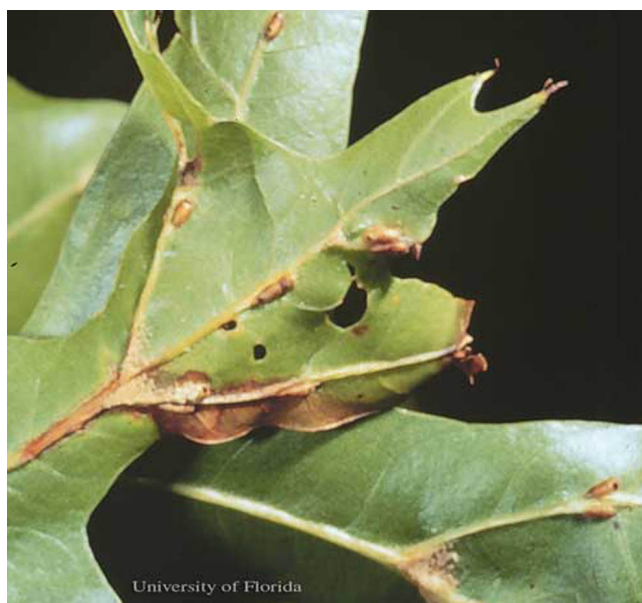
Figure 7. Leaf vein galls of the gall wasp, Callirhytis cornigera (Osten Sacken).

The galls provide shelter, protection, and food for the immature wasps (Hutchins 1969). Inside a gall, the larvae are surrounded by tissues (nutritive zone) rich in nutrients (Askew 1984). As the larvae reach maturity small spines or horns become evident on the gall. An adult wasp emerges from each horn (Johnson and Lyon 1976).