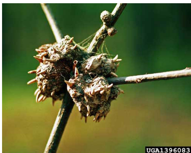
Figure 5. Mature horned oak galls caused by the gall wasp Callirhytis cornigera (Osten Sacken). Credits: USDA Forest Service, www.forestryimages.org