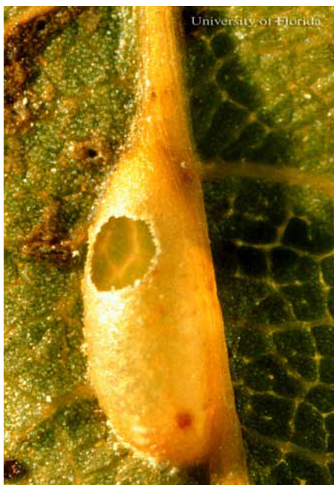
Figure 8. Adult emergence hole in a leaf vein gall of the gall wasp, Callirhytis cornigera (Osten Sacken).