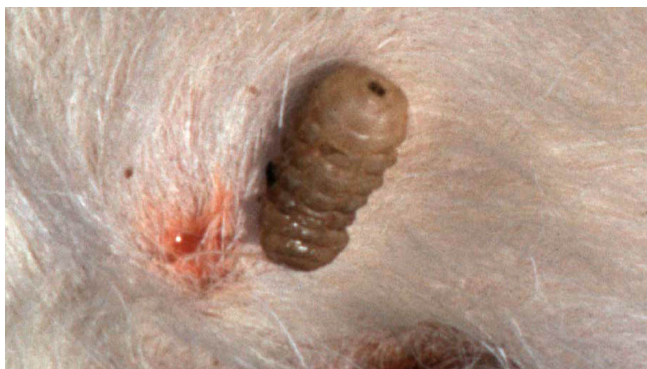
Figure 1. Northern cattle grub.

Cattle grubs (Figure 1) are the immature stages of warble flies or heel flies (Figure 2). Two species of cattle grubs occur in the United States -- the common cattle grub, Hypoderma lineatum , and the northern cattle grub, Hypoderma bovis . The common cattle grub is found in Florida; however the northern cattle grub is usually found in cattle shipped to Florida from other states. Recent observations have indicated that the northern cattle grub may be becoming established in Florida.