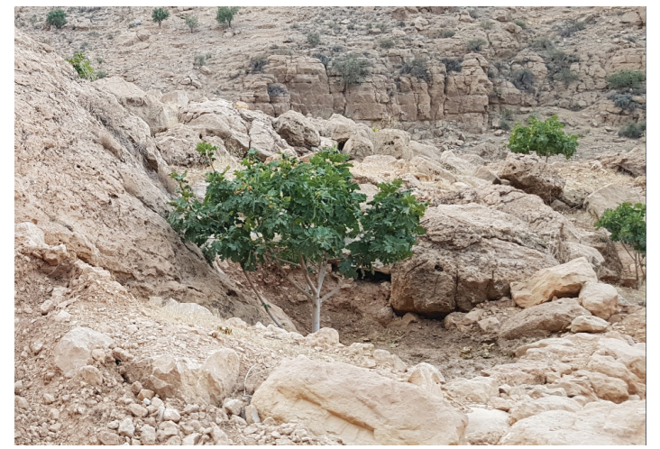
Figure 1. Self-growth fig tree (wild type) in central Iran (Shiraz).

The fig ( Ficus carica L; family Moracea) originated in the Old World Tropics—Asia Minor and the Mediterranean region (Figure 1). In the Mediterranean, the fig has been cultivated since as early as 5,000 BCE.