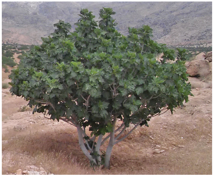
Figure 12. Multitrunk training system.

Trees tend toward a bushy habit with many suckers arising from the root and crown area. Fig trees do not require pruning to be productive. For commercial production, fig trees are sometimes pruned to a central leader or to a modified central leader, but such pruning is usually futile because these trees often freeze back and regrow in bush form (Figure 12). Freeze-damaged wood should be eliminated after regrowth commences (see next section).