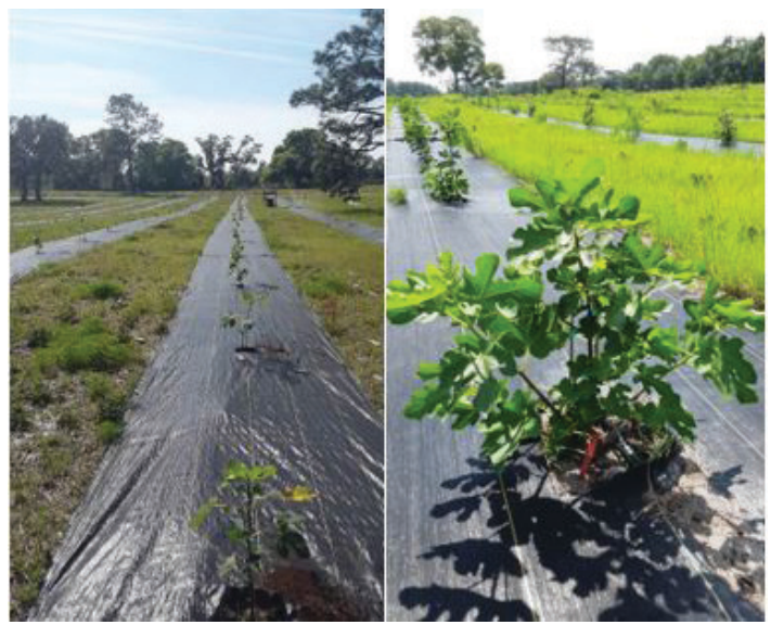
Figure 11. Plantation site for growing fig trees with plenty of sun.

In Florida, bare-rooted fig plants can be planted during the dormant season, from December to late February. Container-grown plants can be planted any time of the year, provided they receive irrigation. The spacing of 10–16 ft (3–5 m) between plants and 13–20 ft (4–6 m) between rows is used for orchards, and similar spacing should be maintained for dooryard trees (Figure 11).