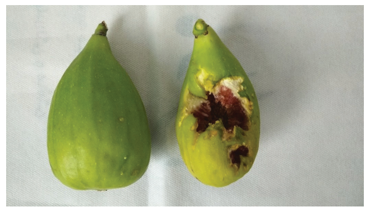
Figure 13. Fig fruit damaged by either bird or insect.

Fig trees are a moderately sustainable crop but suffer from a number of animal and disease pests (Figure 13). Fig tree roots and fruit are a favorite food of birds, gophers, rabbits, and squirrels. Root knot nematodes can also be a limitation for fig trees planted in sandy soils but are not usually a problem in fertile or loamy soils. Organic amendments or mulches reduce nematode damage. A number of insects and diseases can attack fig fruit cultivars with an open eye.