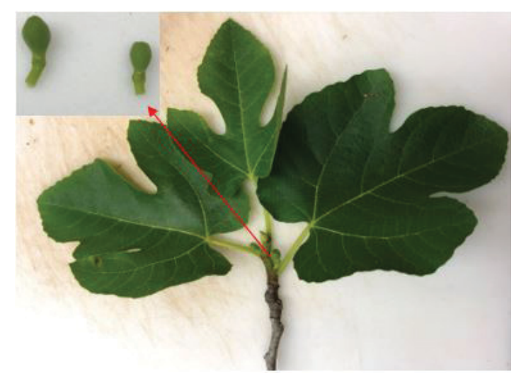
Figure 6. Fig tree flower bud.