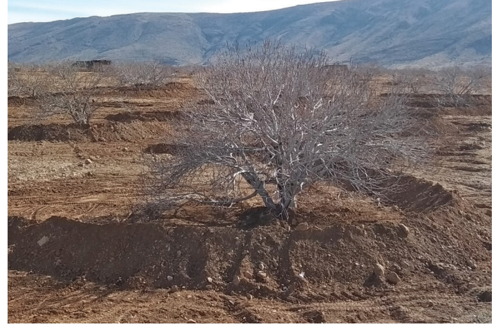
Figure 3. Fully dormant fig tree in Shiraz, Iran.