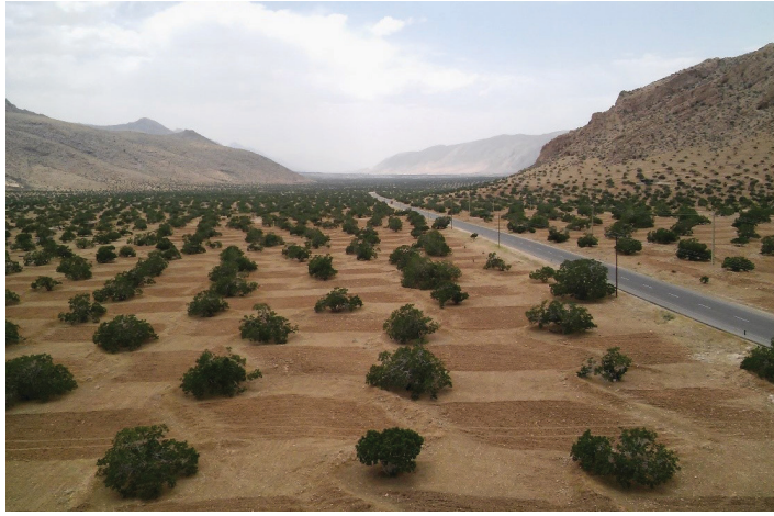
Figure 2. Rain-fed fig trees (dryland) production in Shiraz, Iran.