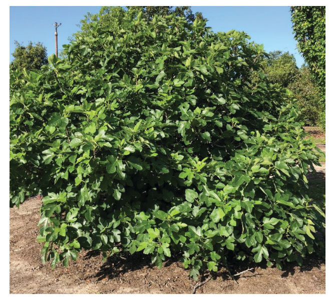
Figure 4. Fig tree growth habit.

The fig is a deciduous tree that can reach 50 feet in height (Figure 4). However, in the southeastern United States, this tree is seldom taller than 25 feet due to periodic cold injury to the trunk and limbs. Most fig trees in the southeastern United States are multiple-branched shrubs. Fig wood is weak and decays rapidly. Small branches tend to be more pithy than woody. When branches are cut or damaged, they produce copious quantities of a milky latex that can be a skin irritant. This latex contains a protein-degrading enzyme called ficin, which is similar to another enzyme found in papaya. Fig trees produce roots that can be very deep in well-drained soils. The lateral spread of roots can be substantial.