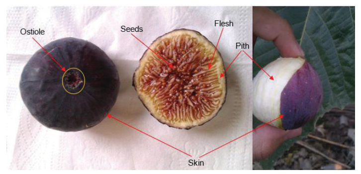
Figure 7. Fig fruit anatomy.