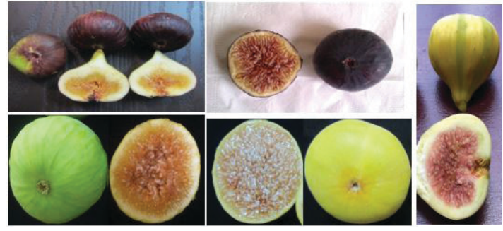
Figure 9. Fruit skin color among different fig varieties.

There are many fig cultivars that grow well in Florida, each with different fruit characteristics. Fig cultivars can have different skin color, including black, purple, pink, yellow, green, or yellow/green (Figure 9).