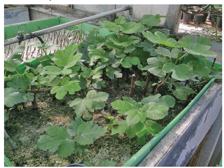
Figure 10. Hardwood cutting propagation.

Fig trees are usually propagated by using dormant cuttings. Select dormant wood about 6 inches long and less than 1 inch in diameter (Figure 10). The basal end of the cutting should be 2-year-old wood.