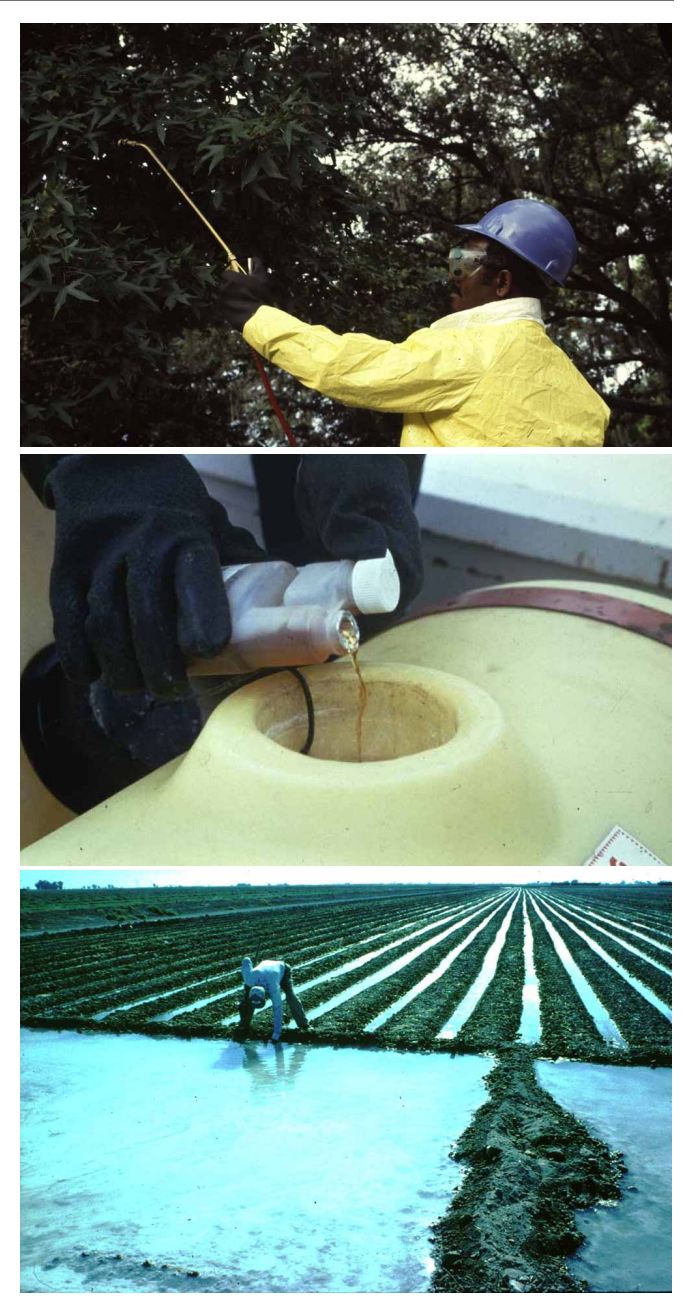
Figure 4. Typical agricultural establishment pesticide handler tasks.