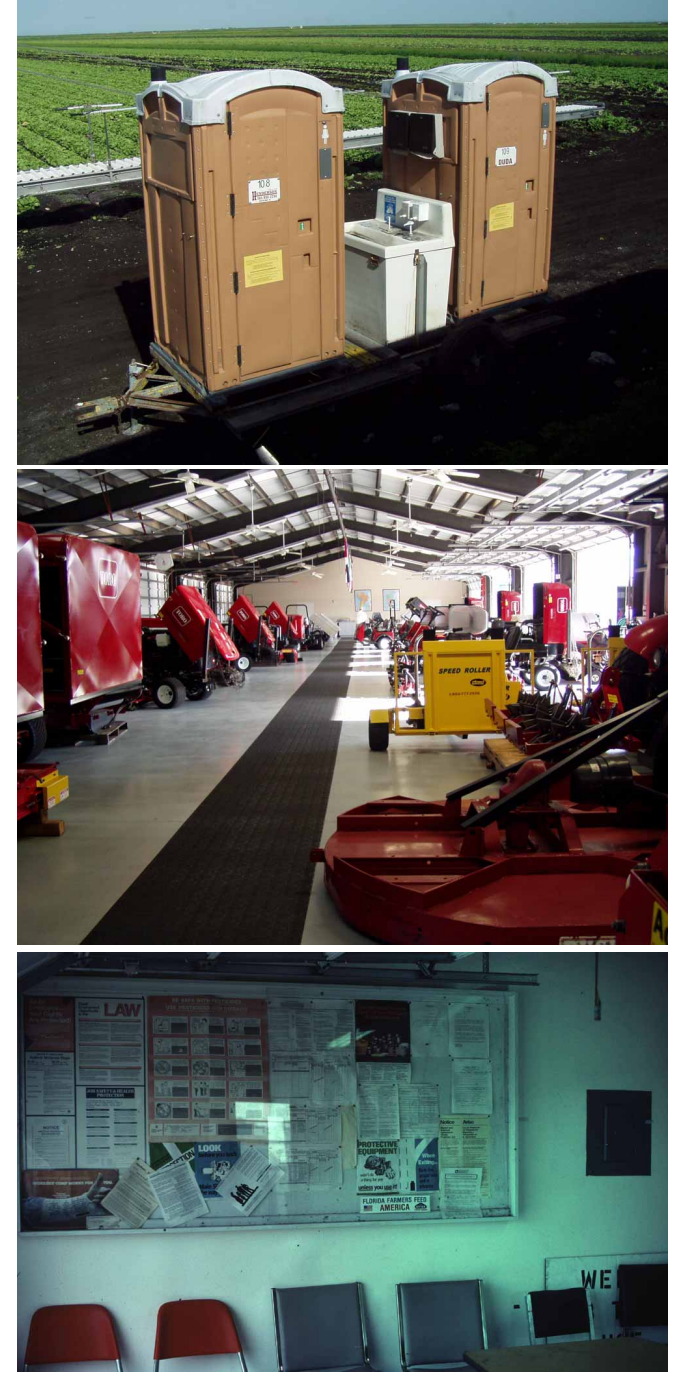
Figure 2. Sites that are commonly central locations on many agricultural establishments.