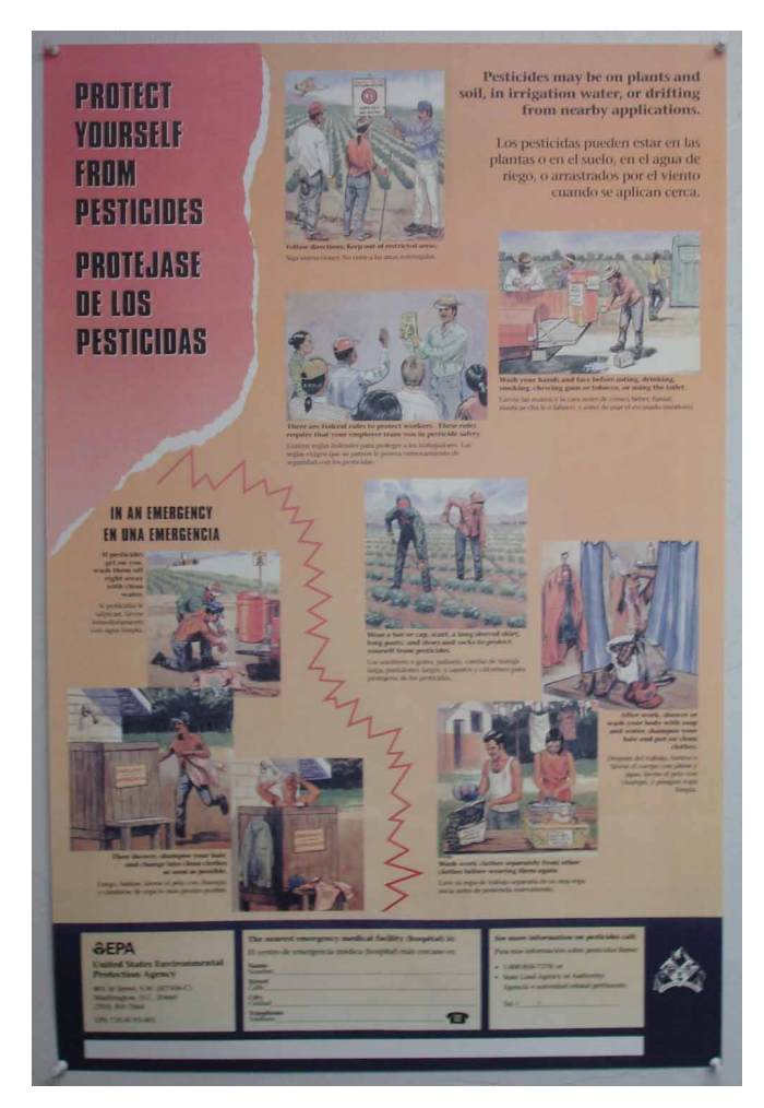
Figure 1. WPS safety poster developed by EPA.

http://www.epa.gov/agriculture/epa-735-b-05-002.pdf ).