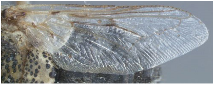
Figure 7. Wing of an adult Oestrus ovis L.