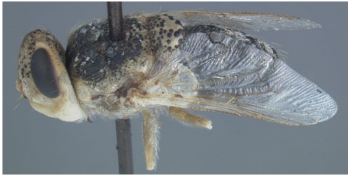
Figure 6. Lateral view of an adult Oestrus ovis L.

Adults range from 0.39 inches (10 mm) to 0.47 inches (12 mm) in length (Abdellatif et al. 2011). Sheep bot fly adults have a dark gray hairy body with dull-yellow head and legs (Figures 1 and 6). The wings are transparent and membranous, normally 0.31 inches (8 mm) in length (Figure 7). Adult flies do not feed, though they may absorb water from their mate while mating. This life stage is relatively short, lasting up to three weeks. During this stage, females produce up to 500 larvae (Capelle 1966).