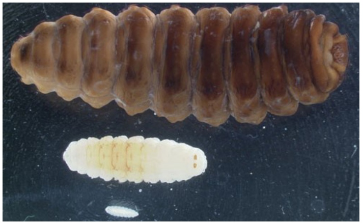
Figure 5. Size comparison of Oestrus ovis L. larval instars, from top to bottom: L3 (up to 30 mm long), L2 (3 to 14 mm long), and L1 (1 mm long).

The L3 larvae are cylindrical in shape and transition from yellow-white to brown in color just prior to molting (Figure 5). They are 0.94 inches (24 mm) to 1.18 inches (30 mm) in length with oral hooks that are robust and more sharply curved. When development in this stage is complete, the L3 travel out of the nasal sinuses to the nostrils, where they are expelled by sneezing action of the host (Russell et al. 2013).