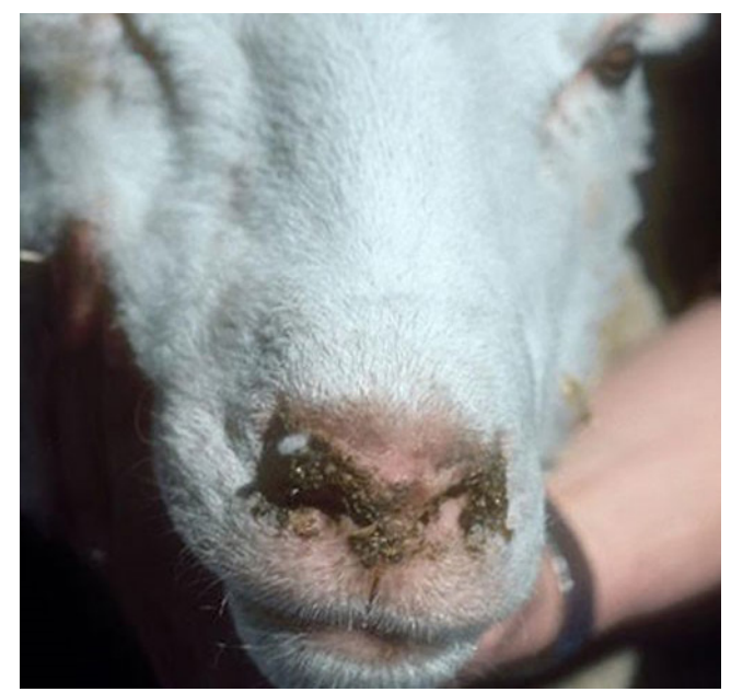
Figure 8. Oestrus ovis L. infestation of a sheep resulting in nasal discharge symptom.

Myiasis is the infestation of animal tissue with fly larvae. Sheep are typically not physically harmed by an infestation of Oestrus ovis. In most cases, animals do not show symptoms of infection (Carvalho et al. 2015); however, clinical signs of infestation in some sheep have included weight loss by up to 9.9 pounds (4.5 kilograms), decreased wool production up to 17.6 ounces (500 grams), and decreased milk production up to 10% (Russell et al. 2013). Damages to animal health can result in economic losses. Additional symptoms of an infestation include sneezing and nasal discharge. In dry, hot climates, dust can accumulate on the nasal discharge of sheep and goats, leading to difficulty breathing (Figure 8) (Dorchies et al. 1998). Irritation of nasal passageways may occur because of the larval spines and oral hooks. Animals can experience hypersensitivity to the presence of the parasite's antigens resulting in an immune response (Tabouret et al. 2001). Also, secondary bacterial infections and major inflammation may arise when larvae die inside the nasal sinuses of sheep (Özdal et al. 2016).