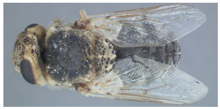
Figure 1. Adult sheep bot fly, Oestrus ovis L.

The sheep bot fly, Oestrus ovis L., (Figure 1) is an obligate parasite that is found worldwide (Özdal et al. 2016). It cannot complete its life cycle without utilizing the nasal passages, frontal and maxillary cavities (Allaie et al. 2015), and sinuses of most domesticated sheep, but has been observed in goats. Unlike other flies, females are known to larviposit. This means the eggs are hatched while still inside the female fly, and she will deposit a droplet containing live larvae on the nose of a sheep (Russell et al. 2013).