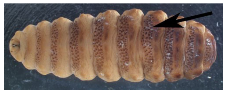
Figure 4. Late-stage just prior to molting L3 (1.18 inches (30 mm) in length) of Oestrus ovis L. with spines visible along the back of the larva (arrow).

Once larvae travel through the nasal cavities of the host, molting occurs into the L2 stage. L2 larvae are 0.12 inches (3 mm) to 0.55 inches (14 mm) in length, with physical structures mostly similar to L1. As L2, larvae trigger an immune reaction in their host including an increase of inflammatory cells and parasite-specific immunoglobulins such as IgG and IgA (Silva et al. 2012). To avoid the