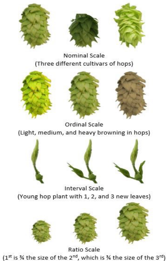
Figure 2. Examples for the nominal, ordinal, interval, and ratio scales in hops ( Humulus lupulus ).

Finally, ratio data involves assigning numbers to indicate how a sample compares to a control (e.g., twice as strong, half as sweet, etc.). As illustrated in Figure 2, the sizes of three hop cones were analyzed; the first cone has a height that is \frac{1}{4} as tall as the second, which is only \frac{1}{4} as tall as the third.