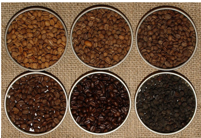
Figure 4. Six coffee roasting grades. From top left to bottom right: light cinnamon, cinnamon, normal, French roasting, espresso and open fire.

Grading is routinely used in meat, dairy, coffee, and tea, and it is primarily a way of protecting the consumer from product substitution or adulteration. Figure 4 illustrates six grades commonly used to describe the degree to which coffee beans have been roasted. By enforcing a series of standards associated with different grades, consumers can be guaranteed that they are getting what they paid for. This also allows producers to earn more money for their products; as an item goes up in grade or as that grade becomes more associated with quality, retailers can charge a premium for that product. There are some drawbacks to the grading system; namely, it requires the use of expert graders trained in the appropriate method, something that takes time and money. For that reason, traditional grading scales are being replaced with more automated sensory evaluation techniques (e.g., mechanization, computer imaging).