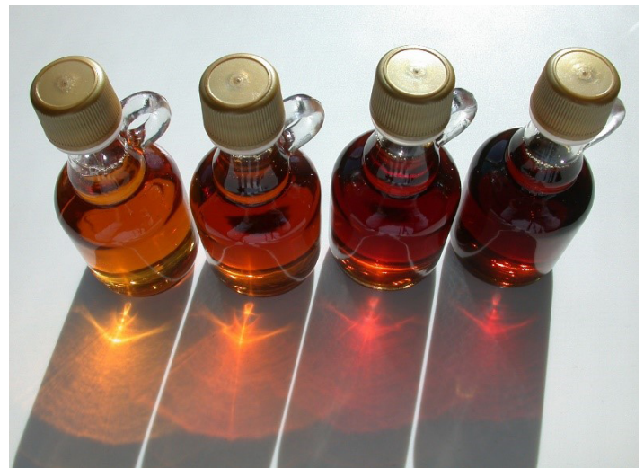
Figure 1. Four grades (from left to right, Vermont Fancy, Grade A Medium Amber, Grade A Dark Amber, and Grade B) of maple syrup.

This publication is the second in a series designed to assist producers in the small-to-medium-sized sensory evaluation of their horticultural crops, summarizing the types of sensory data available and their associated collection methods, with the guidelines outlined in this publication taken from the 4th edition of Sensory Evaluation Techniques (Meilgaard, Civille, and Carr 2016).