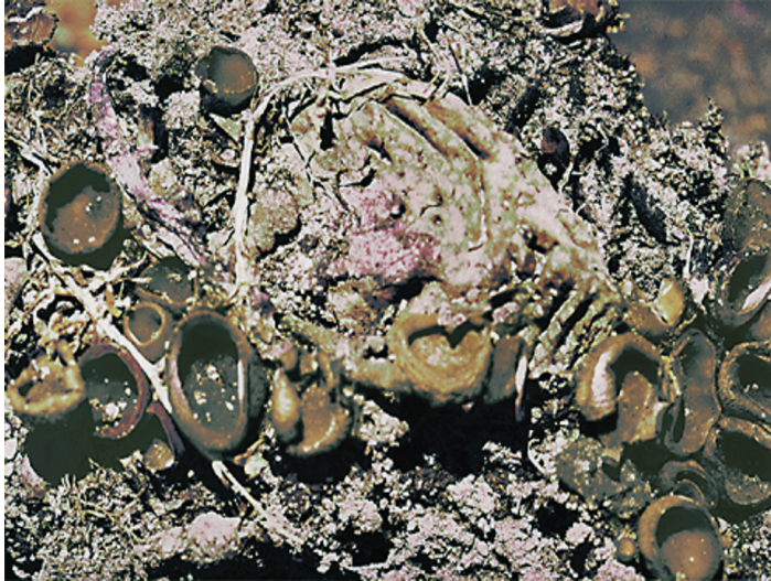
Figure 3. The overwintering structure (apothecia) of the brown rot fungus, which is growing on a fruit mummy.

Wilting and powdery masses of secondary asexual spores called conidia will be observed on the flower shuck on infected blossoms. The infection can spread from the flower, into the spur, then the twig, where it will form a canker. Conidia will continue to be produced throughout the early summer from these cankers. Conidia can infect blossoms, green twigs, and green through fully ripe fruit.