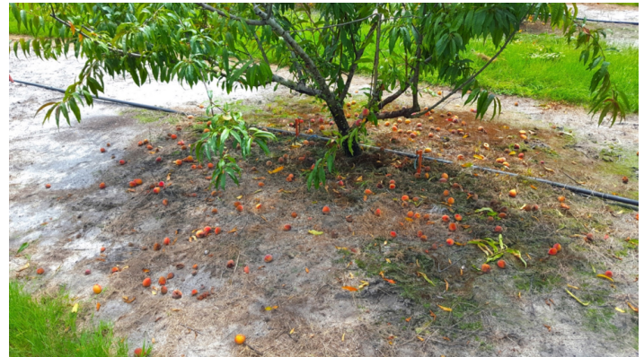
Figure 8. Without proper management, losses from brown rot infection can be 100 percent.

Weak, dead, and cankered branches and twigs should be pruned throughout the winter and spring. Pruning the canopy to create more space between branches can help reduce inoculum by increasing sunlight and airflow. The use of microjet irrigation versus rain/overhead irrigation is recommended to avoid wetting fruits, flowers, branches, and twigs (Rungjindamai et al. 2014). Opening the canopy can improve chemical treatment coverage overall, which will show better results as well as use resources more effectively. Thinning fruits along the branch is extremely important because fruits making contact with each other show a higher incidence of infection due to increased contact with inoculum. Fruits that appear stunted should be thinned as well to remove another possible source of inoculum (Bush et al. 2015). Follow UF/IFAS recommendations to avoid excess nitrogen fertilizer, because too much nitrogen can lead to the greater susceptibility of the tree to disease (Byrne et al. 2012).