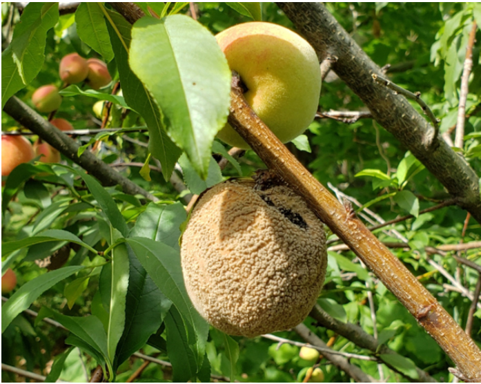
Figure 7. The brown rot fungus is sporulating on a mature peach.