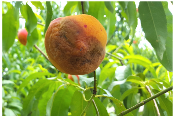
Figure 6. Early infections of the fungus that causes brown rot to appear as soft, brown spots.

Young, immature fruits are susceptible to infection, but infections remain dormant, and symptoms do not typically develop until fruits near maturity. Fruits become more susceptible to infection as they mature. The first symptoms on mature fruit will appear as soft, brown spots that can quickly engulf the entire fruit (Figure 6). These spots will expand and produce spores (conidia) until covered in a powdery, tan mass. If allowed to come into contact with other plant material, these spores can cause the death of other branches (Beckerman 2015). Infected fruits will decay and shrivel until brown to black in color, either detaching from the tree or remaining attached (Biggs et al. 1995).