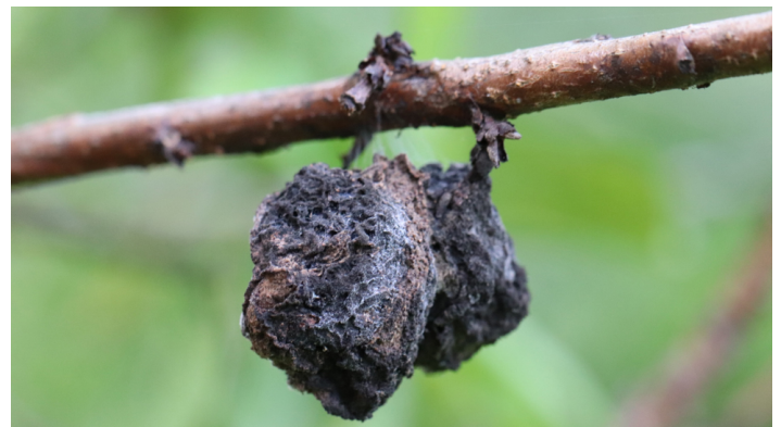
Figure 2. Peach mummies are the most significant source of overwintering brown rot fungal inoculum.

Infection can occur over a broad range of temperatures (32°F to 86°F; 0°C–30°C), with an optimum temperature range of 72°F to 77°F (22°C–25°C). However, if plant material remains wet for 24 hours or more, brown rot fungus infection is most likely to occur, regardless of the air temperature (Bush et al. 2015).