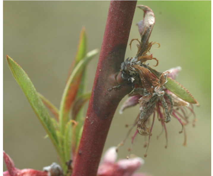
Figure 5. Blighted blossom and shoot and twig canker on a peach tree.

potential to girdle and kill a shoot, resulting in twig blight. At this point, the leaves on the blighted twig will wilt and turn brown, but they can remain attached to the branch for a few weeks (Bush et al. 2015).