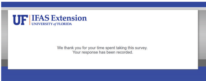
Figure 19. Final survey completion message and thank you.