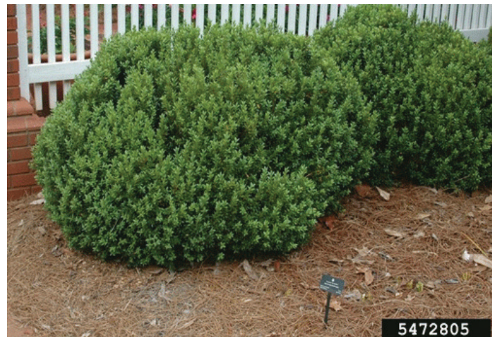
Figure 1. Hedged Buxus sp. shrubs in a residential landscape.

States (Hoover 2001). This small fly is native to Europe and was first detected as a pest of boxwood in the United States in 1910 (Felt 1910).