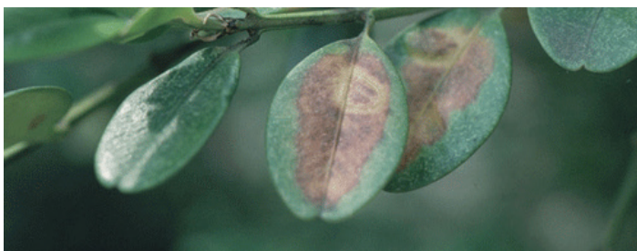
Figure 6. Discolored leaves from old blistering damage caused by boxwood leafminer, Monarthropalpus flavus (Schrank).

Once larvae are fully developed, nearly transparent circular spots or windows appear on the lower surface of the leaf. Breaking open these blisters or windows with your thumbnail typically reveals two to six larvae within a single leaf. Infested leaves appear yellow, discolored, and are smaller than healthy leaves (Figure 6).