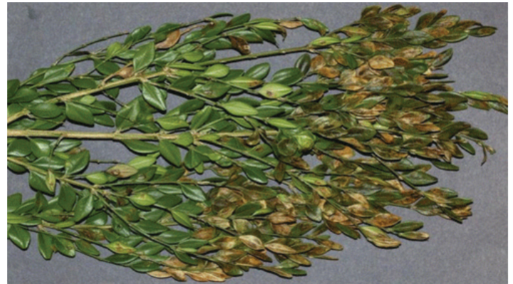
Figure 7. Severely infested foliage by boxwood leafminer, Monarthropalpus flavus (Schrank).

During heavy infestations, boxwood leaves become severely damaged and turn brown, causing them to drop prematurely, leaving behind bare branches or entire plants (Figure 7). A severely infested plant usually dies after a year (Barnes 1948). Prolonged infestations of boxwood leafminer can cause branch dieback and make them more susceptible to damage from plant pathogens and adverse environmental conditions such as freezing, drought, and severe heat (Hoover 2001).