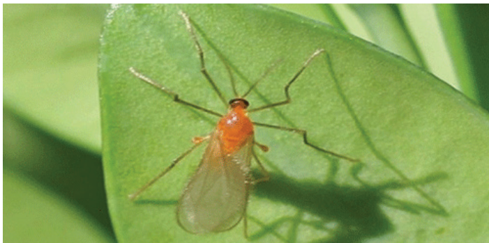
Figure 2. Monarthropalpus flavus (Schrank) adult resting on a Buxus sp. leaf.

Larvae of boxwood leafminer are yellowish-white to green and are about 3 mm (0.12 inches) long (Hoover 2001). Pupae are whitish to dark yellow, and about 3 mm (0.12 inches) in length. Adults are orange-yellow to red, approximately 2.5 mm (0.1 inches) long, gnat-like flies (Figure 2) (Russell 2013). Adults have 14 antennal segments. Upon casual observation, adult leafminers are often described as mosquito-like insects swarming in boxwoods. During severe infestations, leafminer damage is highly visible on healthy bright green boxwood foliage.