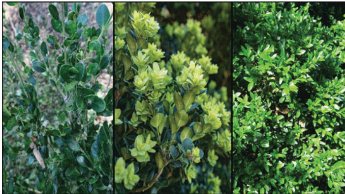
Figure 8. Boxwood cultivars resistant to boxwood leafminer, Monarthropalus flavus (Schrank), attack. (left) Buxus microphylla var. japonica . (middle) Buxus sempervirens ‘Vardar Valley’. (right) Buxus sinica var. insularis ‘Justin Brouwers’.

Credits: Left: Maryann Debski, North Carolina State University, Bugwood Image ID 639172; Middle: Kristi Traynor, North Carolina State University, Bugwood Image ID 680730; Right: Maryann Debski, North Carolina State University, Bugwood Image ID 627035