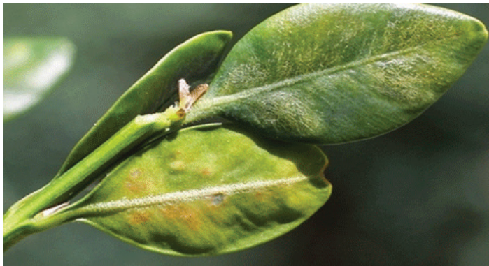
Figure 5. Boxwood leafminer, Monarthropalpus flavus (Schrank), mines and blisters along the upper and lower surfaces of leaves, respectively.

Boxwood leafminer larvae mine or tunnel between upper and lower parts of leaf tissue causing irregular blisters on the lower surface and slight elevations on the upper surface of the leaf (Russell 2013). A leaf blister is a swollen or thickened area of a leaf, which on the surface often appears crinkled, yellow or brownish in color, and distorts the leaf structure. Early indications of attack include light green or yellow spots on the upper leaf surface (Barnes 1948). As damage progresses, irregular blisters in the form of olive green or brownish discolorations appear on the lower surface of the leaf (Figure 5). Since leaf blisters are a physical separation in the leaf's vascular tissue, it disrupts the flow of nutrients within the leaf resulting in premature leaf drop.