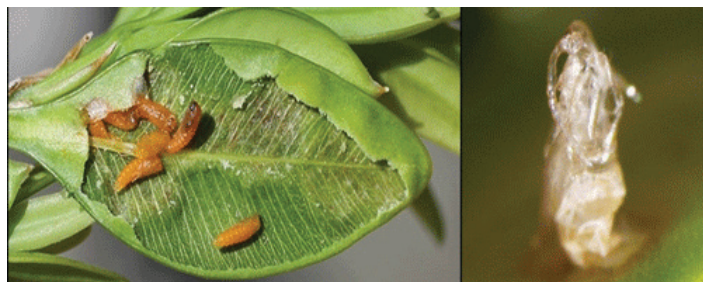
Figure 4. (Left) Boxwood leafminer, Monarthropalpus flavus (Schrank), pupae exposed after removing external leaf layer. (Right) Pupal exuvia (empty pupal case) of emerged boxwood leafminer, Monarthropalpus flavus (Schrank).

Larvae feed throughout the summer and fully develop into pupae by the winter (Figure 4) at which point they tend to go dormant within the leaf tissue (Barnes 1948). Adults emerge in the spring as temperatures warm and the spring flush of boxwood leaves emerge (Russell 2013).