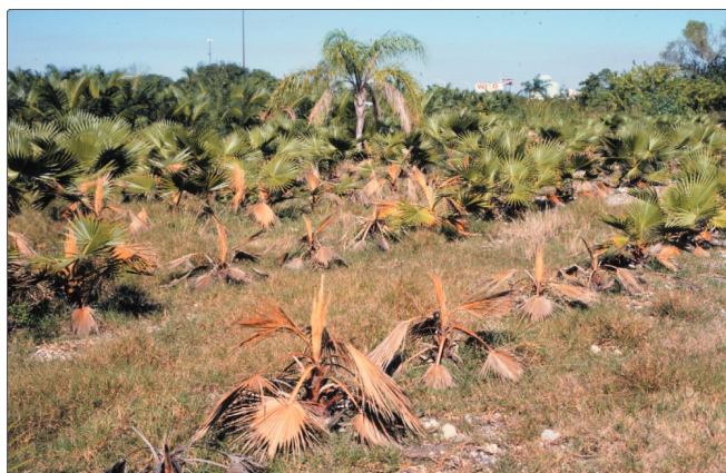
Figure 4. Multiple Washingtonia robusta in this field nursery are being affected by Phytophthora bud rot. Those most affected were juvenile palms in a low-lying area.

hurricane (Figure 4). Bud rots caused by Thielaviopsis do not appear to occur that frequently, and while the disease may be related to occurrence of tropical storms, it has been observed year round. In container nurseries, however, bud rots caused by Phytophthora and Thielaviopsis can occur at any time.