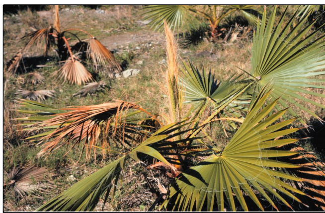
Figure 1. Spear leaf and next youngest leaf exhibiting typical symptoms of Phytophthora bud rot.

symptom observed is usually the lack of new leaves being produced, especially the spear leaf, and an open-topped crown (Figure 2). The diseased palm did go through the discoloration and wilting of the youngest leaves, but you may have missed seeing that symptom.