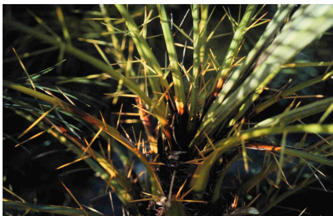
Figure 3. Note dark lesions caused by Pestalotiopsis on petioles of this Phoenix roebelenii , especially at base of young leaves emerging from bud.

While all palms are probably susceptible to diseases caused by this fungus, pygmy date palm ( Phoenix roebelenii ) appears to be affected quite often in Florida, especially during the winter months. With these palms, a bud rot has been observed that can kill the palm (Figure 3). This has been observed on juvenile and mature palms.