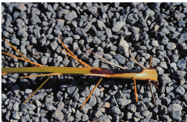
Figure 2. Petiole lesion on Phoenix roebelenii due to Pestalotiopsis .

If the pathogen is restricted to only causing leaf spots, the disease may not be very damaging to the palm, especially a mature palm in the landscape. However, with juvenile palms that have no trunk and only a few leaves, the palm could be severely affected by the leaf spots.