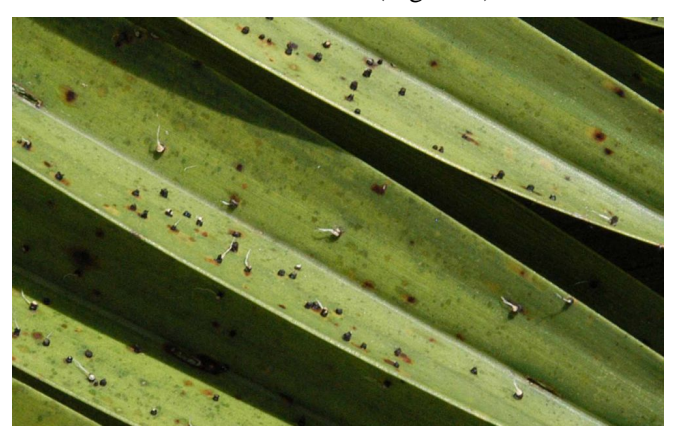
Figure 1. The small black bodies are sori (fruiting bodies) of Graphiola phoenicis that have erupted through the leaflet epidermis.

above the leaf epidermis. The number of sori indicates the level of infection (Figure 3).