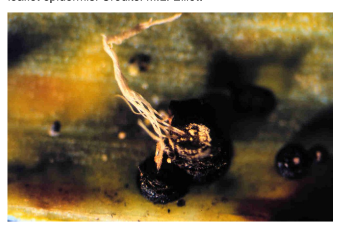
Figure 2. Close-up of sori of Graphiola phoenicis with filaments protruding.