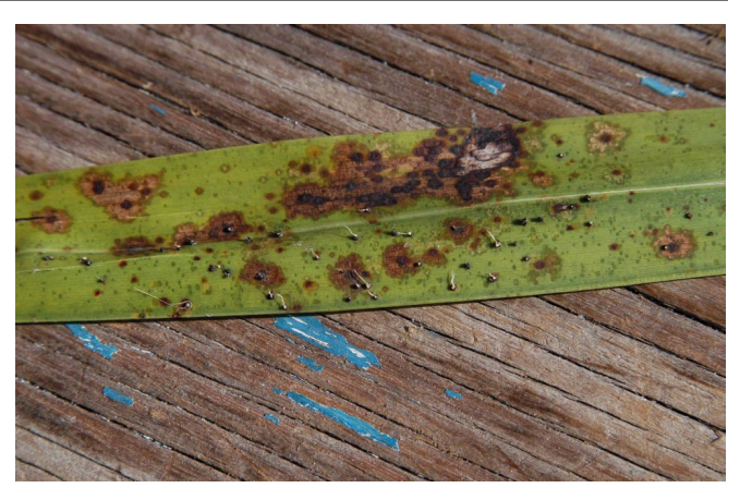
Figure 5. MIxed infection of Graphiola phoenicis and Stigmina palmivora (large brown spots). Note that some Stigmina leaf spots have a sorus of Graphiola phoenicis within the leaf spot.

After the fungus penetrates (infects) the leaf tissue, it has very limited growth within the leaf tissue, with most growth occurring just below the sorus (black fruiting body). The time span from infection to spore production is 10 to 11 months. This is unusual when compared to most leaf pathogens that have a life cycle often measured in weeks. This