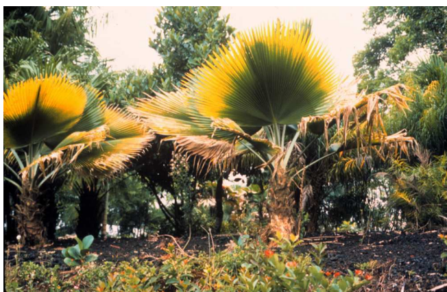
Figure 13. Severe Mg deficiency in Pritchardia sp. showing broad yellow bands around the periphery of the oldest leaves.