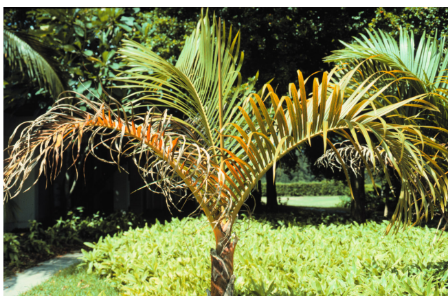
Figure 10. Potassium-deficient Hyophorbe verschafeltii showing progression of symptoms from oldest to youngest leaves.

species of palms, it occurs primarily as a result of improper fertilization. Magnesium deficiency is caused by insufficient Mg in the soil. Magnesium is readily leached from sandy and other soils having little cation exchange capacity. High levels of K or Ca in the soil can also induce or exacerbate Mg deficiencies.