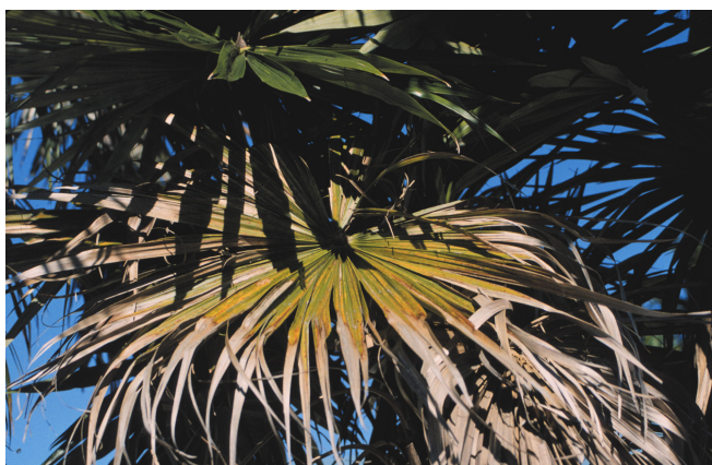
Figure 4. Potassium deficiency in Livistona chinensis showing leaf discoloration and tip necrosis.