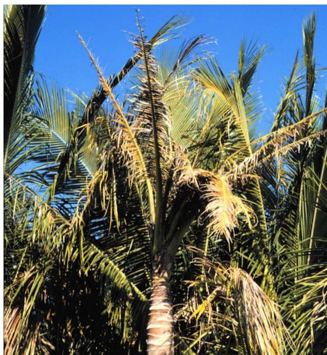
Figure 11. Late stage potassium deficiency in Cocos nucifera showing small chlorotic and necrotic new leaves and tapering of the trunk. This palm died shortly after this photo was taken.

Symptoms of Mg-deficient palms occur on the oldest leaves as broad chlorotic bands along the margins with the central portion of the leaves remaining distinctly green (Figures 12 and 13). In severe cases, only the rachis and adjacent portions of the leaflets remain green on the oldest leaves, but younger leaves show progressively wider bands of green along the centers of leaves. In Phoenix spp., leaflet tips on the oldest leaves may be necrotic, but this necrosis is due to K deficiency superimposed on Mg-deficient leaves. In palmate-leaved species with