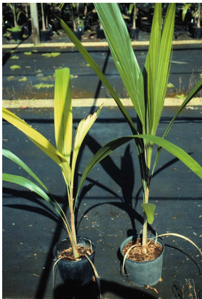
Figure 24. Severely Fe-deficient Syagrus romanzoffiana seedling on the left showing severe chlorosis and leaf tip necrosis.

insufficient B in the soil. Boron is readily leached through most soils, with a single heavy rain event temporarily leaching most available B out of the root zone. When this leaching stops, B released from decomposing organic matter will again provide adequate B for normal palm growth in most cases.