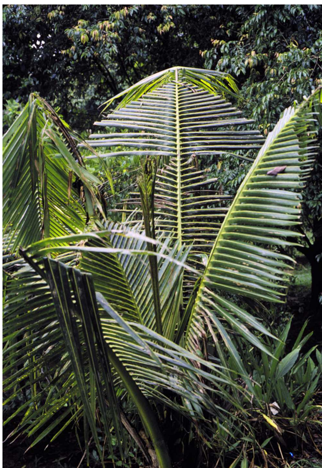
Figure 30. These Cocos nucifera leaves show the effects of a series of temporary B deficiency events, each causing an inverted “V” within the leaf.

Boron deficiency in its acute form produces yet other symptoms. Often leaves emerge greatly reduced in size and crumpled in a corrugated fashion (accordion-leaf) (Figures 37 and 38). Palms may grow out of these symptoms or the deficiency can kill the palm.