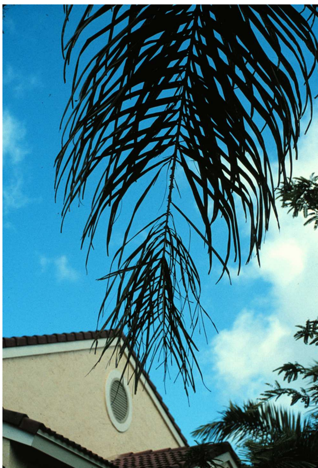
Figure 27. Small, thin leaflets at the tip of B-deficient Syagrus romanzoffiana new leaf. These leaflets are beginning to fall off.

Another symptom associated with chronic B deficiency in S. romanzoffiana is the production of weak, narrow leaflets towards the tips of newly emerging leaves. These leaflets often drop off, leaving the rachis tip devoid of leaflets (Figure 27 and 28).