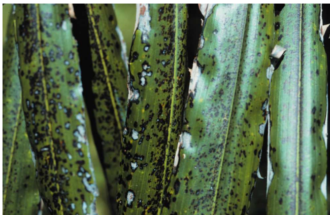
Figure 8. Potassium-deficient older leaf of Arenga tremula showing extensive necrotic spotting and margins.

necrotic and frizzled except for the base of the leaf, leaflet bases, and the rachis. Symptoms decrease in severity from tip to base of a single leaf and from old to new leaves within the canopy (Figures 9 and 10). In severe cases, the entire canopy will consist of a reduced number of leaves, all of which will be chlorotic, frizzled, and stunted (Figure 11). The trunk will begin to taper (pencil-pointing) and death of the palm often follows.