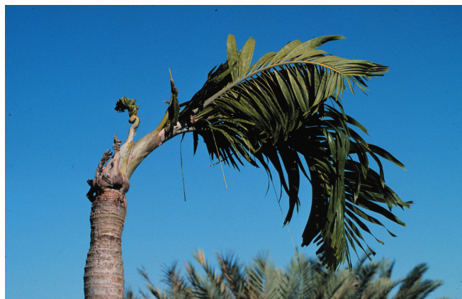
Figure 34. Boron deficiency in Adonidia merrillii (Christmas palm) showing sharp bending in the stem. Note that previous leaves were tiny indicating a temporarily acute B deficiency, but subsequent leaves were larger, suggesting the deficiency is now chronic.

These symptoms are very similar to those of lethal yellowing in species affected by that disease. The calyx end of fallen coconuts from LY-infected Cocos nucifera will be blackened, whereas coconuts from B-deficient trees will not have this blackened end (link to LY).