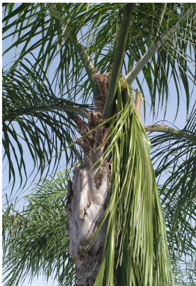
Figure 36. Boron deficiency in Syagrus romanzoffiana showing sharp bending in new leaf petiole.