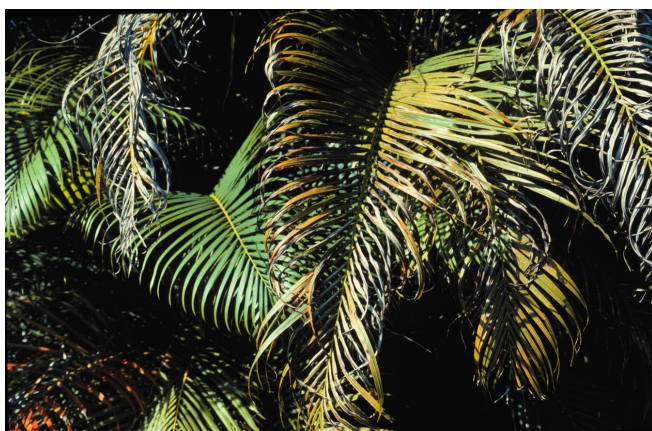
Figure 9. Potassium deficiency on Dypsis lutescens showing discoloration towards the leaf base, but extensive necrosis towards the leaf tips.