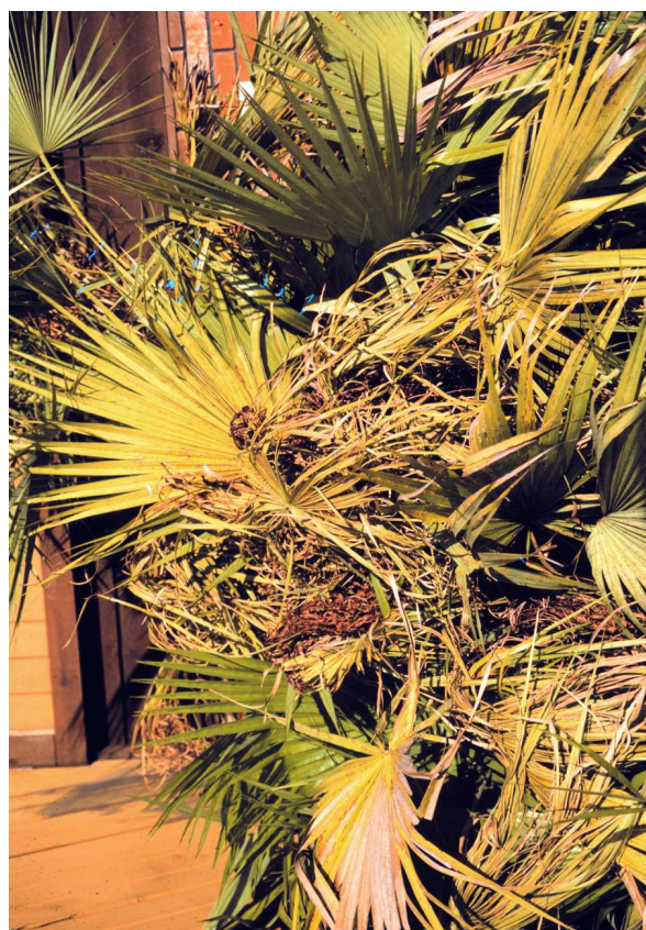
Figure 19. Manganese deficiency or "frizzle top" in Acoelorrhapha wrightii (paurotis palm).

Iron deficiency appears as interveinal or uniform chlorosis of the newest leaves (Figure 23). Older leaves remain green. In severely Fe-deficient palms, new leaflets may have necrotic tips, growth will be stunted, and the meristem or bud may eventually die (Figure 24). Early symptoms in Syagrus romanzoffiana (queen palm), Rhapis spp. (lady palms), and some Licuala spp. may appear as