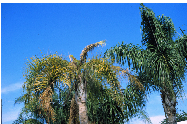
Figure 17. Manganese-deficient Syagrus romanzoffiana on left showing frizzled new leaves, but normal length older leaves.