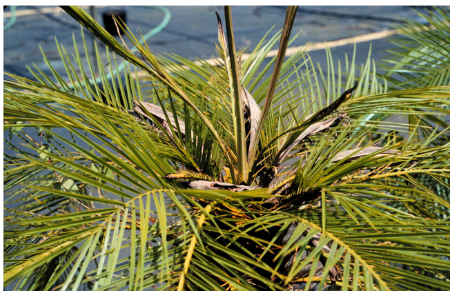
Figure 32. Multiple unopened spear leaves caused by B deficiency in Phoenix roebelenii .