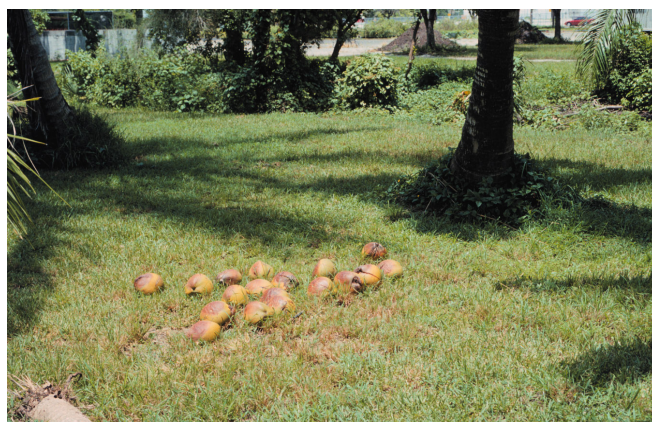
Figure 40. Premature fruit drop in Cocos nucifera caused by B deficiency.