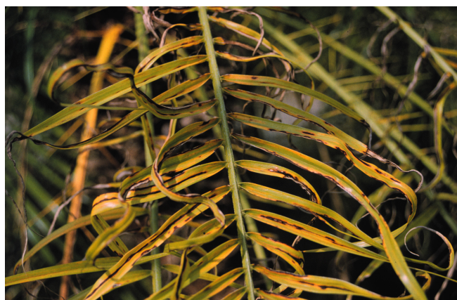
Figure 16. Manganese-deficient new leaf of Phoenix roebelenii showing longitudinal necrotic streaking.