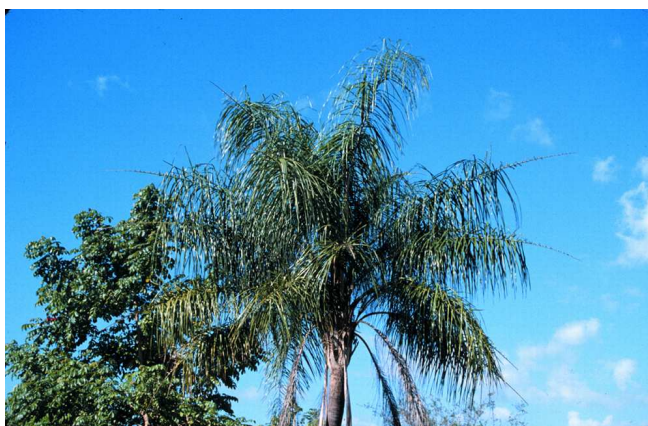
Figure 28. Bare leaf tips caused by chronic B deficiency in Syagrus romanzoffiana .

Boron deficiency can be very transient in nature, often affecting a developing leaf primordium for a very short period of time (e.g., 1 to 2 days). This temporary shortage of B can cause necrosis of the primordial spear leaf for a distance of about 1 to 2 cm.