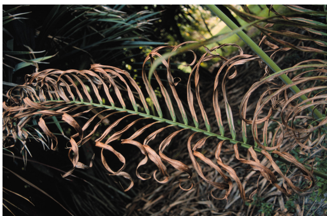
Figure 3. Potassium-deficient older leaf of Dypsis cabadae showing leaflet tip necrosis, but no spotting.

pattern of discoloration holds for most palm species that show discoloration as a symptom. In P. canariensis (Canary Island date palm), leaflets show fine (1-2 mm) necrotic and translucent yellow spotting and extensive tip necrosis. These necrotic leaflet tips in most Phoenix spp. are brittle and often break off, leaving the margins of affected leaves irregular.