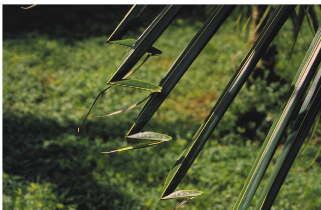
Figure 26. Hookleaf in Cocos nucifera , a symptom of mild B deficiency.

One of the earliest symptoms of B deficiency on Dypsis lutescens and Syagrus romanzoffiana is transverse translucent streaking on the leaflets. In many species including Cocos nucifera , Elaeis guineensis , and S. romanzoffiana , mild B deficiency is manifested as sharply bent leaflet tips, commonly called “hookleaf” (Figure 26). These sharp leaflet hooks are quite rigid and cannot be straightened out without tearing the leaflets. In some species, these “hooks” drop off.