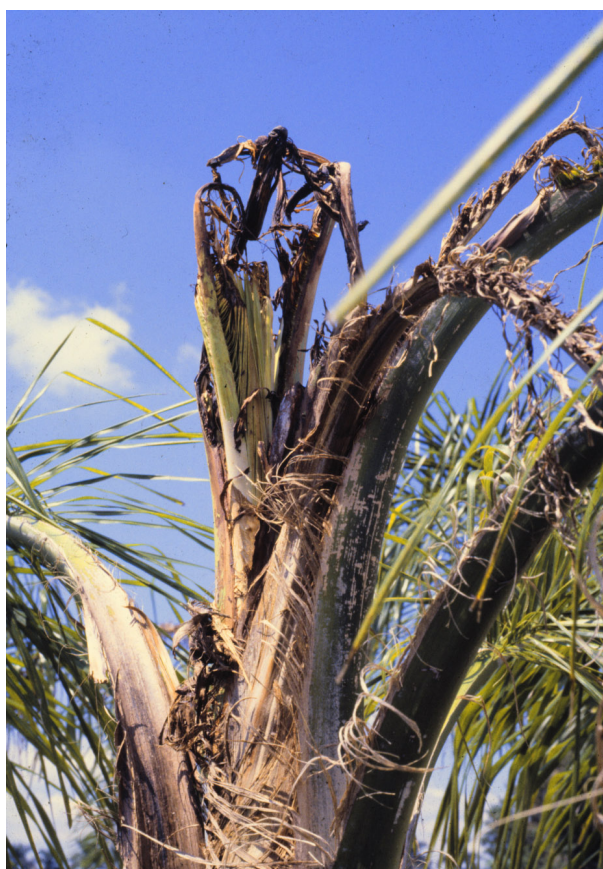
Figure 22. Severe Mn deficiency on Syagrus romanzoffiana showing only necrotic petiole stubs emerging. This palm died shortly after this photo was taken.