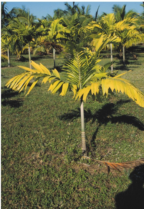
Figure 1. Nitrogen deficiency in Ptychosperma elegans (solitaire palm) showing uniform chlorosis of the older leaves.

Dictyosperma album (hurricane palm) are mottled with yellowish spots that are translucent when viewed from below (Figure 2). In other palms such as Dypsis cabadae (cabada palm), Howea spp. (kentia palms), and Roystonea spp. (royal palms), symptoms appear on older leaves as marginal or tip necrosis with little or no yellowish spotting present (Figure 3). The leaflets in Roystonea , Dypsis , and other pinnate-leaved species showing marginal or tip necrosis often appear withered and frizzled.