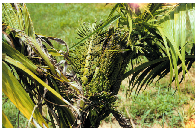
Figure 38. Severe B deficiency in Heterospatha elata (sagisi palm) showing small crumpled new leaves.