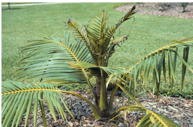
Figure 21. Manganese deficiency in Cocos nucifera caused by amending the backfill with composted sewage sludge.