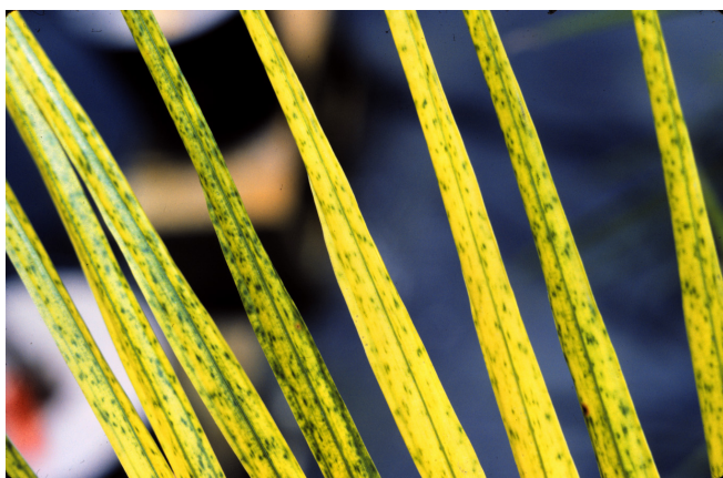
Figure 25. Iron-deficient new leaf of Syagrus romanzoffiana showing green spotting on chlorotic background.

leaves as they mature and are replaced by younger leaves.