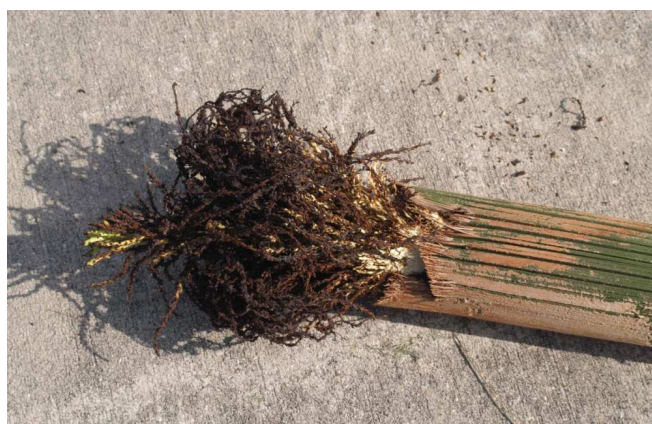
Figure 39. Necrotic inflorescence of B-deficient Syagrus romanzoffiana .