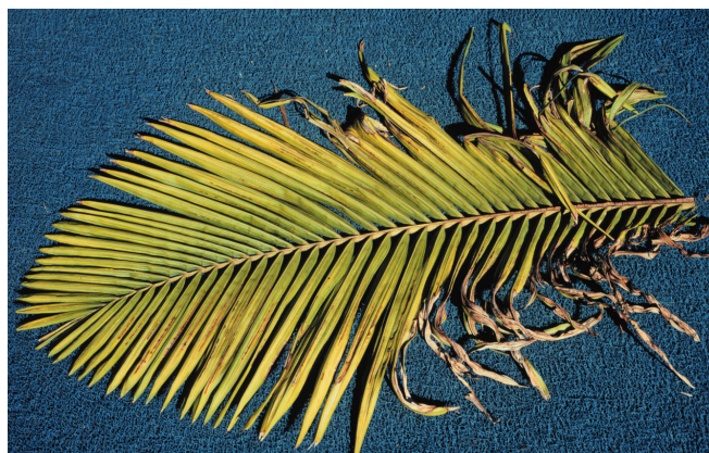
Figure 20. Manganese-deficient new leaf of Archontophoenix alexandrae showing progression of symptoms from leaf tip to leaf base.

chlorotic new leaves covered with green spots about 1/8 inch in diameter (Figure 25).