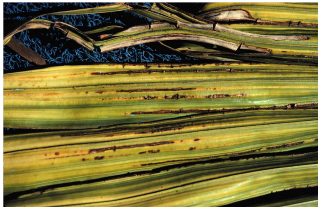
Figure 15. New leaf of Mn-deficient Archontophoenix alexandrae (Alexandra palm) showing interveinal necrotic streaking.

leaves of Mn-deficient Cocos nucifera , necrotic leaflet tips fall off and the leaf has a singed appearance (Figure 21). In severely Mn-deficient palms, growth stops and newly emerging leaves consist solely of *Figure 22). Death of the meristem usually follows.