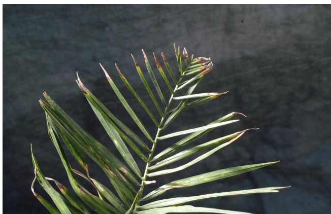
Figure 29. A temporary B deficiency can cause this inverted “V”-shaped leaf tip truncation. In this case the species is Phoenix roebelenii .

When such leaves eventually expand, this “point” necrosis affects the tips of all leaflets intersected by that necrotic point, the net result being the appearance of a blunt, triangular truncation of the leaf tip (Figure 29). This pattern can be repeated several times during the development of a single leaf of Cocos nucifera (about 5 weeks) (Figure 30). Similar patterns have been observed in fan palms (Figure 31).