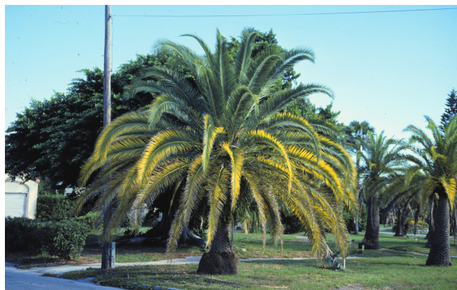
Figure 12. Magnesium deficiency in Phoenix canariensis showing broad yellow bands along the margins of the oldest leaves.

deeply dissected leaves, the chlorosis may appear as broad yellow bands along the margins of individual leaflets (Figure 14). Magnesium deficiency is never fatal in palms.