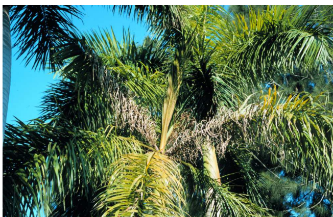
Figure 18. Manganese deficiency in Roystonea regia showing small frizzled new leaves, but full-sized older leaves.

deficiency, since the root surface area available for interception and uptake of Fe will be greatly reduced in root rotted palms. High soil pH is the most common cause of Fe deficiency in broadleaf trees and shrubs, but in palms it usually does not cause Fe deficiencies. Excessive uptake of other nutrient ions such as ammonium, phosphate, manganese, zinc, copper, and other heavy metals often results in Fe deficiency symptoms being expressed.