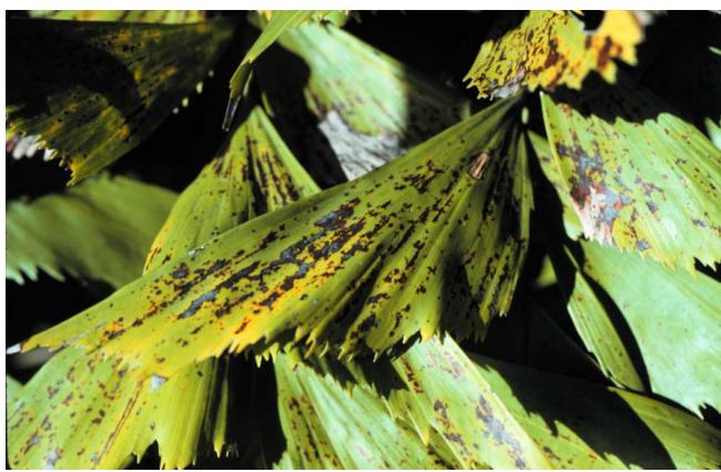
Figure 7. Potassium-deficient older leaves of Caryota mitis (clustering fishtail palm).

As the deficiency progresses, marginal and tip necrosis will also be present (Figure 9). The most severely affected leaves or leaflets will be completely