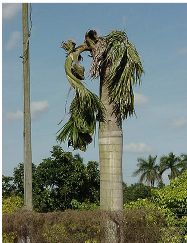
Figure 35. Severe B deficiency in Roystonea regia showing small leaves and severe epinasty.