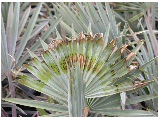
Figure 31. Boron deficiency of Bismarckia nobilis showing necrosis at two separate times during the development of this leaf.

Boron-deficient palms often abort their fruits prematurely and inflorescences (flowers) may have extensive necrosis near their tips (Figures 39 and 40).