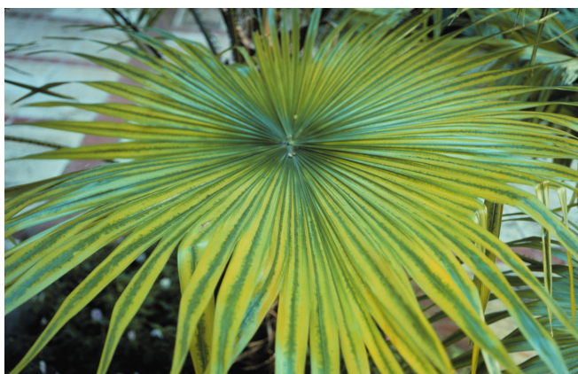
Figure 14. Magnesium-deficient older leaf of Livistona rotundifolia showing yellow bands around the margins of individual leaflets.

sufficient, cold soil temperatures may cause temporary Mn deficiency by reducing root activity levels. This is particularly common on Cocos nucifera in Florida. Composted sewage sludge and manure products have also been shown strongly bind Mn when used as fertilizers or as soil amendments for palms (Figure 21).