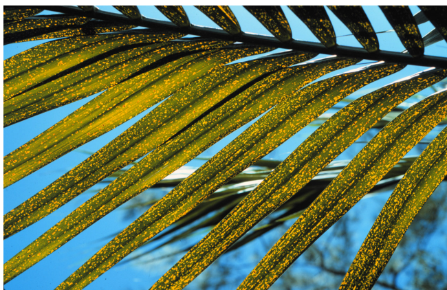
Figure 2. Potassium deficient older leaf of Dictyosperma album (hurricane palm) showing translucent yellow-orange spotting.

In fan palms such as Livistona chinensis (Chinese fan palm), Corypha spp. (talipot palm), Washingtonia spp. (Washington palms), and Bismarckia nobilis (Bismarck palm), necrosis is not marginal, but is confined largely to tips of the leaflets (Figures 4 and 5). In Phoenix roebelenii (pygmy date palm), the distal parts of the oldest leaves are typically orange with leaflet tips becoming necrotic (Figure 6). The rachis of the leaves usually remains green, however, and the orange and green are not sharply delimited as with Mg deficiency. This