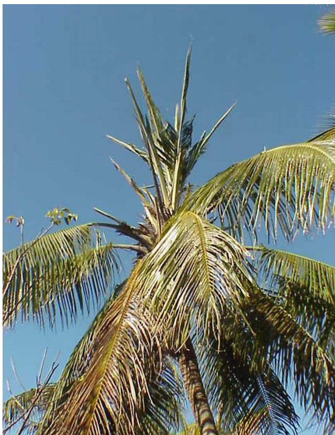
Figure 33. Severe B deficiency in Cocos nucifera , resulting in multiple unopened spear leaves.

These symptoms are very similar to those of lethal yellowing in species affected by that disease. The calyx end of fallen coconuts from LY-infected Cocos nucifera will be blackened, whereas coconuts from B-deficient trees will not have this blackened end (link to LY).