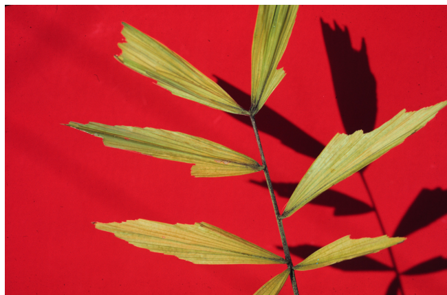
Figure 23. Iron-deficient new leaf of Caryota mitis .