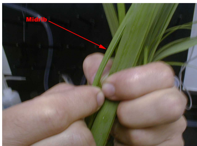
Figure 3. Removing the midrib from the leaf blade is a standard practice for sugarcane foliar analysis.

During the entire sampling process, it is important that leaves be kept as clean as possible and that they are never placed directly on the ground. After a leaf sample is taken, it should be processed on the same day that it is collected. If processing cannot be done immediately, the sample should be placed in a paper bag, labeled, and kept out of the sun to prevent excessive moisture loss. A better method of keeping samples fresh is to place them in plastic bag inside a large cooler with ice. After removing midribs from leaf blades (Figure 3), leaf blades should be rinsed in distilled water to remove soil and dust particles that may contaminate the samples (Figure 4). Place rinsed samples in dry labeled sample bags ready for drying in the oven (Figure 5). Typically, leaf samples are dried in the oven at 125°F. Depending on how the laboratory receives leaf tissue samples, the tissue may be ground (usually to pass a 1 mm screen) or sent out as dried, un-ground samples.