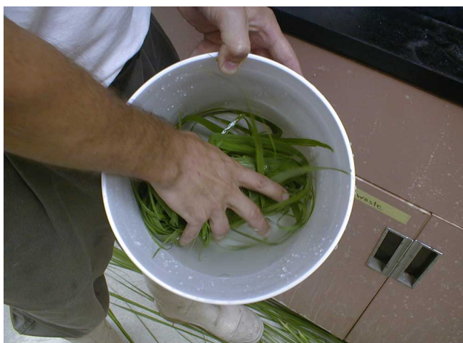
Figure 4. Rinsing leaf blades to remove soil and dust particles.