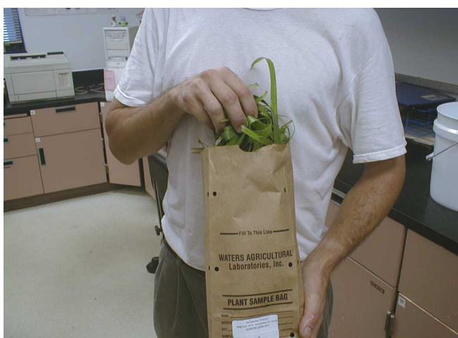
Figure 5. Place rinsed leaf blade samples in sample bags and put in a drying oven.