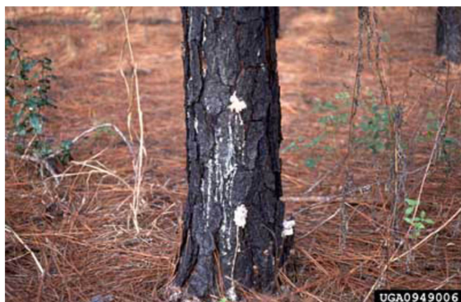
Figure 5. Pitch tubes of the black turpentine beetle, Dendroctonus terebrans (Olivier), occur on the lower trunk and may be as large as a half dollar.