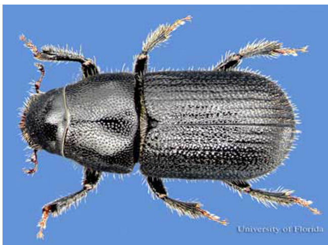
Figure 1. Dorsal view of an adult black turpentine beetle, Dendroctonus terebrans (Olivier). Its large size, trapezoidal pronotum, and rounded declivity distinguish it from all other bark beetles infesting pines in the South.