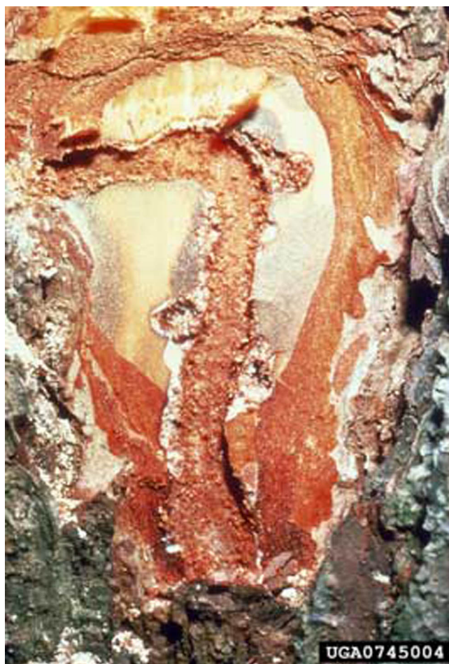
Figure 7. The egg gallery produced by adult black turpentine beetles, Dendroctonus terebrans (Olivier), starts with a short horizontal segment, then extends downward as the female produces eggs.

The BTB is capable of vectoring blue stain fungi into the sapwood of its hosts (Barras and Perry 1971, Rane and Tattar 1987). Because BTB-attacked trees