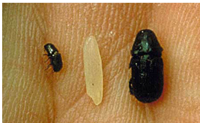
Figure 3. The adult black turpentine beetle, Dendroctonus terebrans (Olivier), (right) is 5 to 8 mm in length, much larger than the southern pine beetle, Dendroctonus frontalis Zimmermann, (left). A grain of rice (middle) is inserted for size comparison.

Adult females initiate attack on the lower tree bole or root collar by boring a hole through the outer bark. Trees with sufficient resin pressure typically produce a large mass of resin and reddish boring dust called a "pitch tube" at the site of attack. A female beetle that successfully overcomes this resinous host