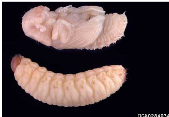
Figure 4. The pupa (top) and larva of the black turpentine beetle, Dendroctonus terebrans (Olivier).

defense mechanism initiates gallery construction in the phloem and is then joined by a male. Tree colonization is mediated through beetle pheromones and volatile host attractants (Smith et al. 1993).