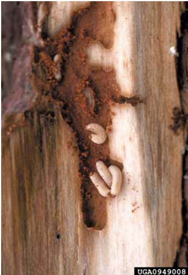
Figure 8. Feeding larvae of the black turpentine beetle, Dendroctonus terebrans (Olivier), and fan- or D-shaped larval gallery.