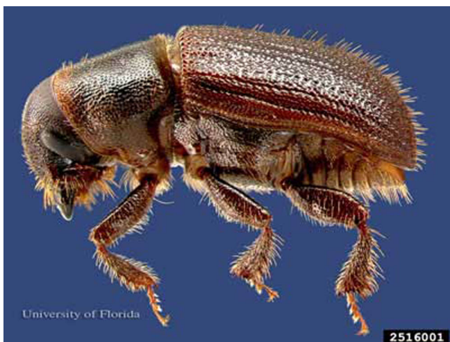
Figure 2. Lateral view of an adult black turpentine beetle, Dendroctonus terebrans (Olivier). Some adults have the red-brown coloration shown here although the majority are black.

Mature larvae are about 12 mm long, creamy white, legless, and have reddish-brown heads. Pupae are waxy-white and of size similar to adults (Goyer et al. 1980, USDA Forest Service 1985).