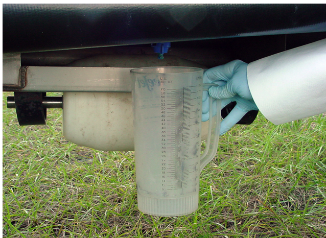
Figure 2. Collecting flow from nozzle during calibration.

equipment. Personal protective equipment, at a minimum, should include at least chemical proof gloves, long sleeve shirt, long pants, shoes and socks. Additional personal protective equipment should be worn if previously applied chemical required additional items to be worn.