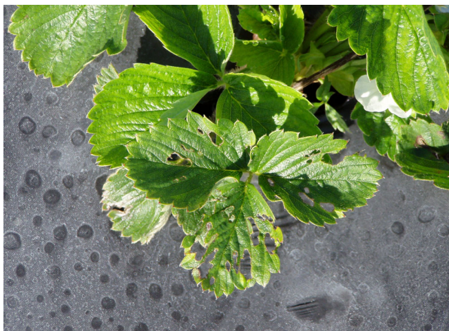
Figure 11. Feeding damage of lepidopterous larvae in strawberries.