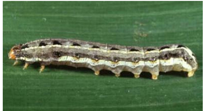
Figure 9. Larvae of the southern armyworm, Spodoptera eridania . Larvae possess dark triangular marks along the sides of the body.