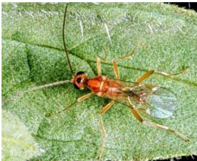
Figure 14. Meteorus spp., a parasitic wasp of armyworms.

brown or some other color depending on the sap color of the host plant. These slow-moving insects with pear-shaped bodies range from 1/16 to 1/8 inch long. A few aphids have wings but all have a pair of cornicles (or "exhaust pipes"), one on each side of the rear end.