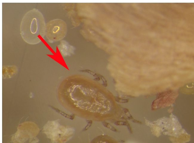
Figure 5. Neoseiulus californicus , predatory mite that feeds on the twospotted spider mite.

There is a second spider mite of moderate concern found occasionally in Florida. The tumid mite, Tetranychus tumidus , is a dark red to purplish, robust mite (Fig. 7). The injury sustained by the strawberry plants resembles the damage caused by the twospotted spider mite. The tumid mite and the twospotted spider mite can coexist in the strawberry crop. In some instances, tumid mite densities have been higher than densities of the twospotted spider mite. Control of this pest is somewhat easier to accomplish than that of the twospotted spider mite. In general, miticides that control twospotted spider mite will control the tumid mite. Some broad-spectrum