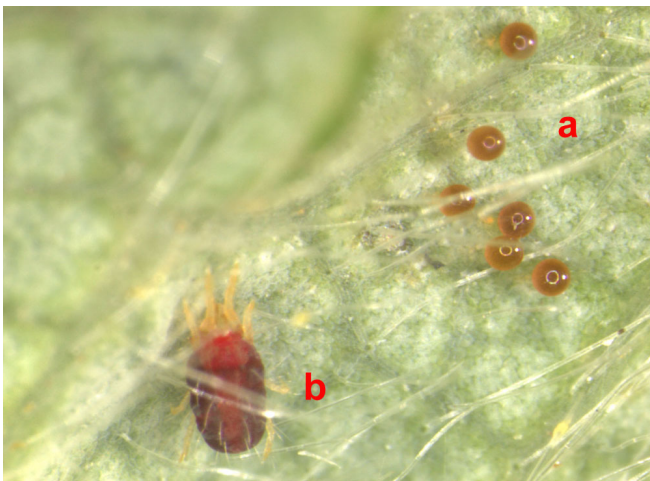
Figure 7. Eggs (a) and adult (b) of the tumid mite on strawberries.