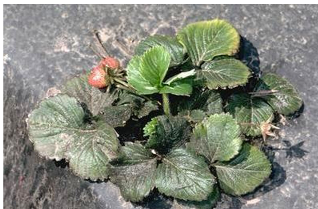
Figure 17. Damage caused by aphids on strawberries. Characteristic sooty mold (black fungi).