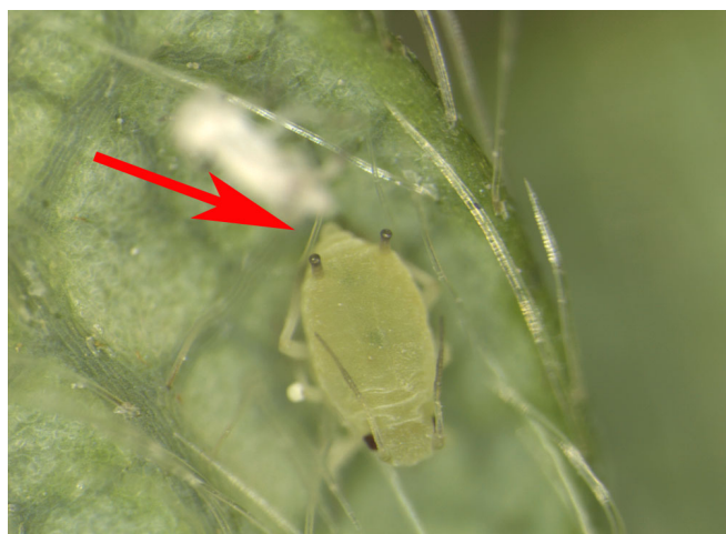
Figure 15. The cotton aphid, Aphis gossypii . It can be recognized by its characteristic dark, relatively short cornicles.