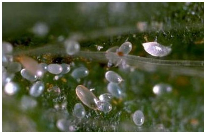
Figure 25. Heavy infestation of cyclamen mite in strawberries.

Widespread infestations in Florida strawberry fields occur only occasionally and usually are related to an infested northern nursery. Cyclamen mites can be found in the crevices of leaf wrinkles, on unopened and opened flowers, on newly formed fruit and in the plant bud. Once these pests are introduced into a field in Florida, they can move along runners to infest neighboring plants and they can be carried by bees, other insects, birds, field workers, or machinery to infest other fields. The movement of mites along the soil or on plastic mulch is not likely since the mite requires the humid environment of plant surfaces.