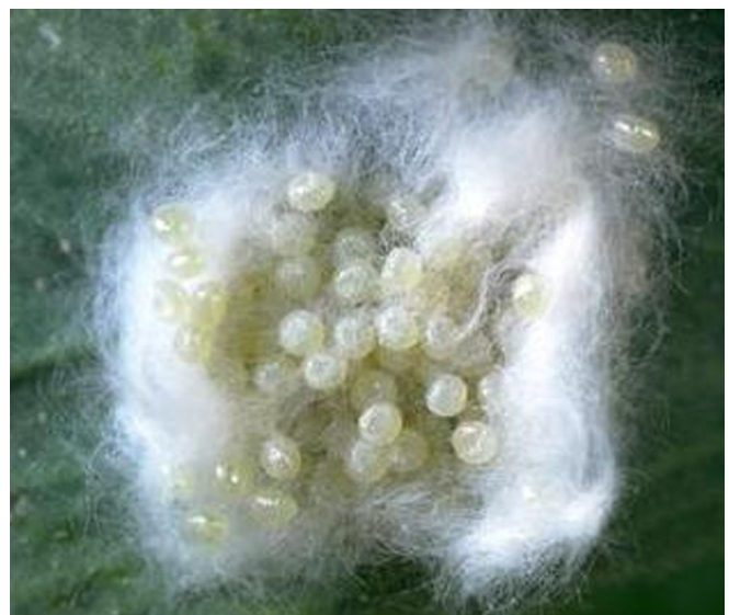
Figure 10. Egg mass of armyworms.