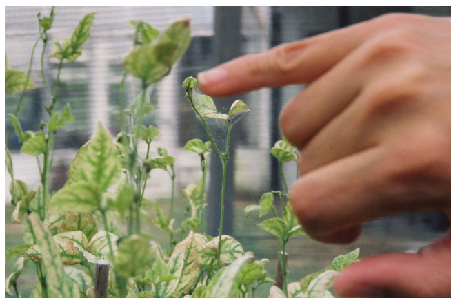
Figure 2. Twospotted spider mite's web-like system used as a means of transportation.