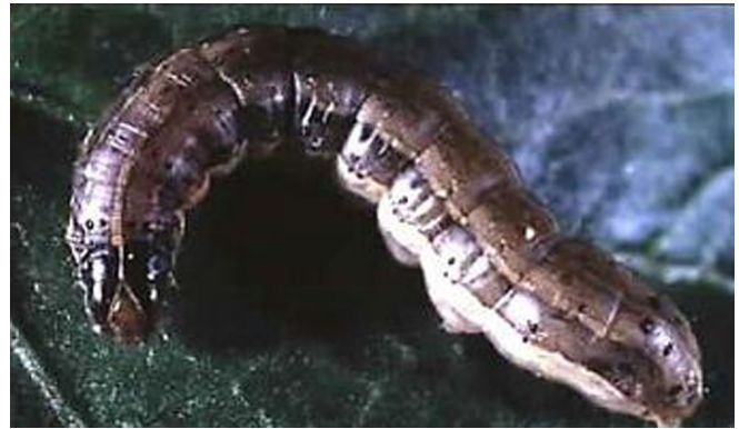
Figure 8. Larvae of the fall armyworm, Spodoptera frugiperda . Larvae possess two dark bands along the side of the body and an inverted "Y" on the head.

worms can occasionally be present in strawberries (Fig. 12).