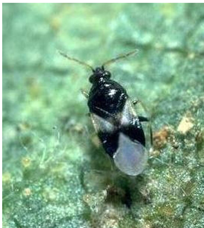
Figure 24. Orius spp, the insidious predatory flower bug.

Widespread infestations in Florida strawberry fields occur only occasionally and usually are related to an infested northern nursery. Cyclamen mites can be found in the crevices of leaf wrinkles, on unopened and opened flowers, on newly formed fruit and in the plant bud. Once these pests are introduced into a field in Florida, they can move along runners to infest neighboring plants and they can be carried by bees, other insects, birds, field workers, or machinery to infest other fields. The movement of mites along the soil or on plastic mulch is not likely since the mite requires the humid environment of plant surfaces.