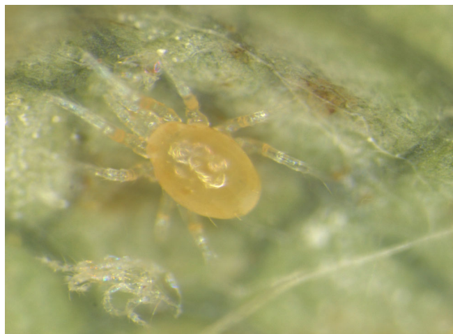
Figure 4. Phytoseiulus persimilis , predatory mite that feeds on the twospotted spider mite.

Naturally occurring thrips also prey on the twospotted spider mite (Fig. 6).