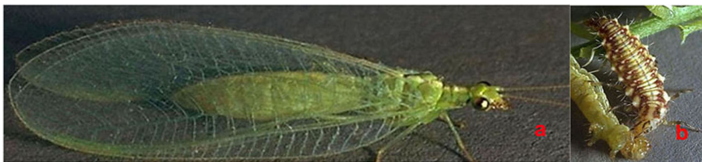
Figure 20. Lacewing adults (a) and larvae (b), such as Chrysoperla spp., can control aphids.