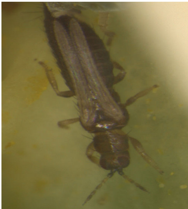
Figure 21. Frankliniella bispinosa , the most common thrips in Florida strawberries.