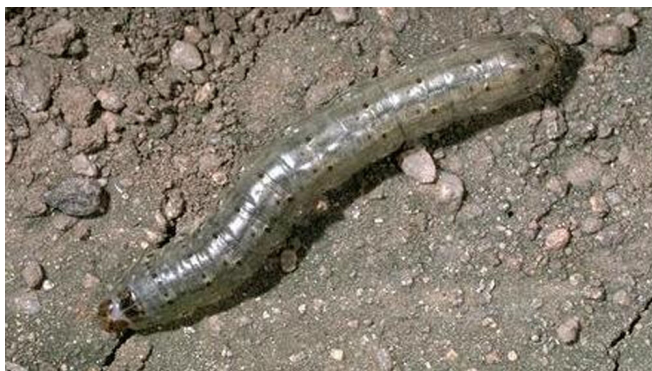
Figure 12. The cutworm, Agrotis ipsilon , can occasionally be present in the strawberry crop.