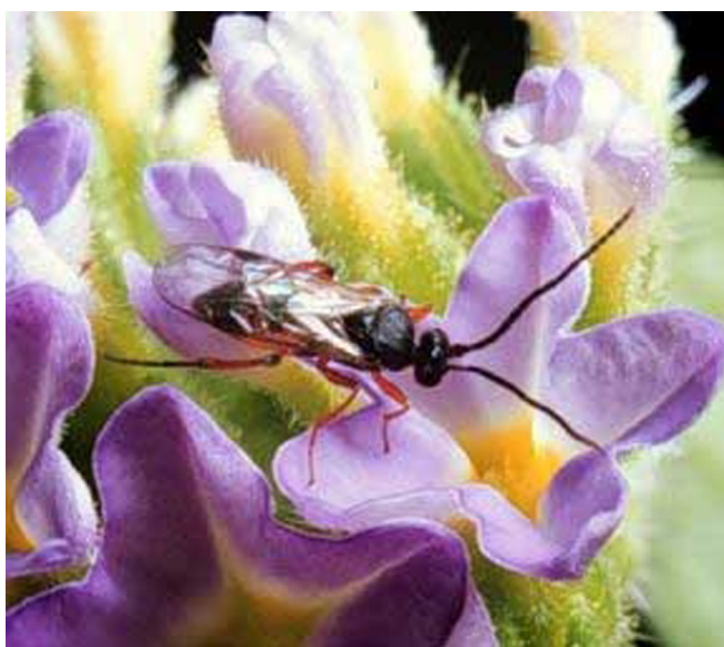
Figure 13. Cotesia spp., a parasitoid wasp of armyworms.

There are two species of aphids frequently found in Florida strawberries, the strawberry root aphid ( Aphis forbesi ) and the cotton aphid (also known as the melon aphid) ( Aphis gossypii ) (Fig. 15). In 2005, the yellow rose aphid, Rhodobium porosum (Fig. 16), has been added as a new record for strawberries in Florida. In general, aphids may be green, black,