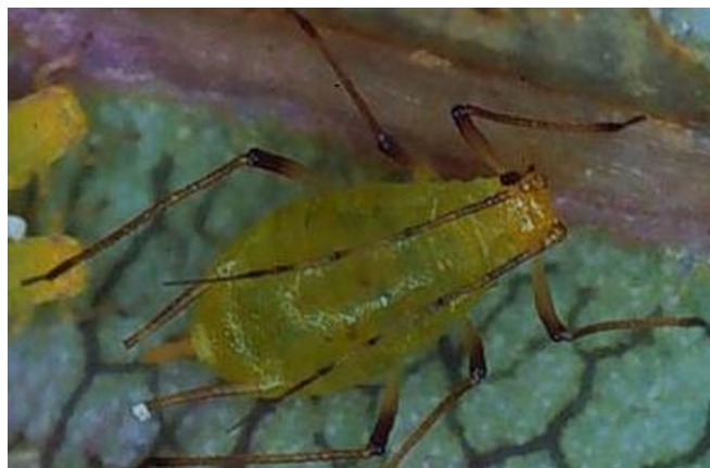
Figure 16. The yellow rose aphid, Rhodobium porosum , a new host record for Florida.