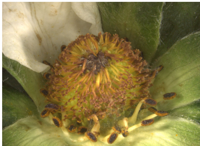
Figure 23. Damage caused by thrips on strawberries. Thrips rasp portions of the strawberry flower.