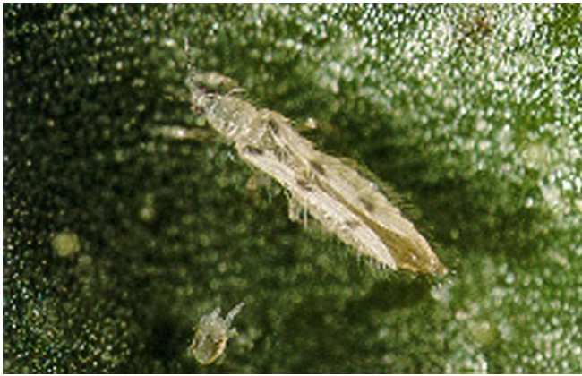
Figure 6. The six-spotted thrips, Scolothrips sexmaculatus , a predatory thrips that feeds on the twospotted spider mite.

insecticides, such as methomyl, kill the tumid mite but not the twospotted spider mite. Accordingly, applications of such broad-spectrum insecticides may render the tumid mite unnoticeable.