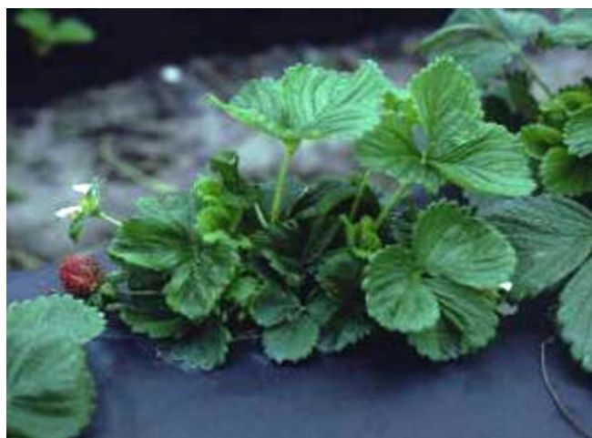
Figure 26. Damage caused by cyclamen mites.