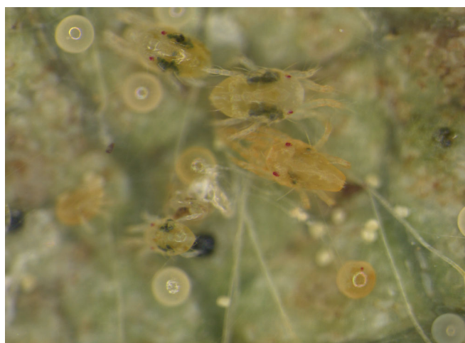
Figure 3. Eggs, nymphs, and adults of the twospotted spider mite on a strawberry leaflet.