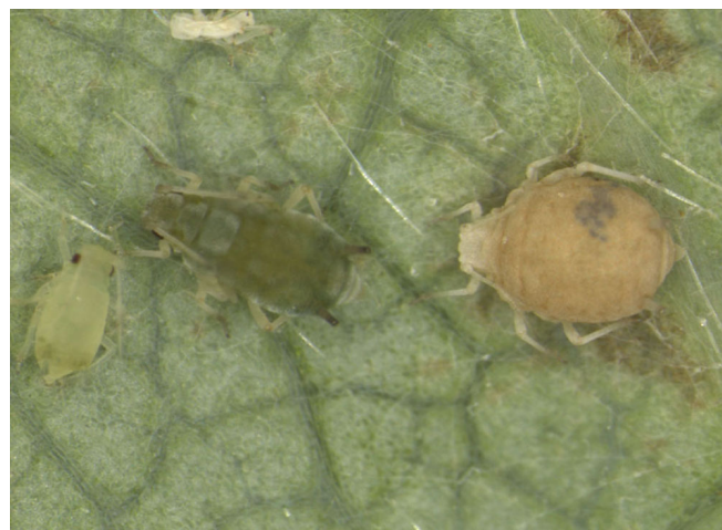
Figure 18. Aphid parasitized (right) by the wasp Aphidius colemani .

Well-established strawberry plants can tolerate low (1-5 aphids per leaflet) to medium (10-15 aphids per leaflet) levels of aphids. Usually, parasitic wasps (Fig. 18), predators (Figs. 19 and 20), and diseases that contribute to aphid control can be found in the field. Several insecticides are available to control aphids when necessary (e.g., methomyl).