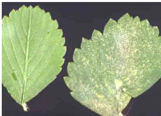
Figure 1. Damage caused by the twospotted spider mite on strawberries. Upper side of leaflet undamaged (left) and damaged (right) by spider mites.

greenhouses, and open fields. The twospotted spider mite feeds on the sap of the leaves causing chlorosis (Fig. 1). As few as 10 or even fewer mites per leaflet can cause economic losses. They disperse easily by walking from leaflet to leaflet or by winding through their spider web-like system (Fig. 2). They develop through an incomplete metamorphosis including eggs, nymphs, and adults (Fig. 3).