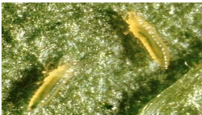
Figure 22. Immature stages of thrips (nymphs).