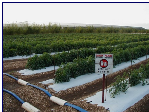
Figure 2. Application of the QIC prototype to automatic soil moisture based irrigation of tomatoes at UF Tropical Research and Education in Homestead, FL.

reducing irrigation water by 70% on drip irrigated tomato in South Florida (Fig. 2).