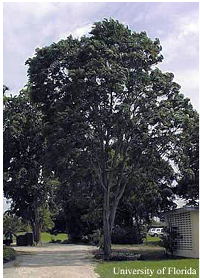
Figure 10. Tropical-cedar, Cedrela odorata.

West Indies mahogany ( S. mahagoni [Jacquin]), which is native to southern Florida, the Bahamas, and the Greater Antilles except Puerto Rico. This is one of the most popular shade trees in urban areas of