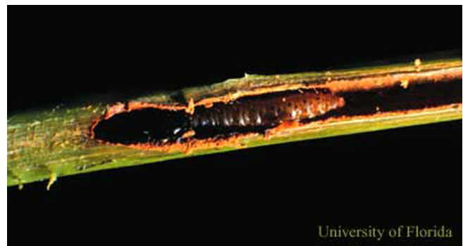
Figure 6. Twig of West Indies mahogany split to reveal larva of mahogany shoot borer, Hypsipyla grandella (Zeller).

Mahogany shoot borers attack new shoots and are seldom seen attacking hardened-off shoots. In southern Florida, where the flush of new growth of West Indies mahogany takes place from April to June (Howard and Solis 1989), mahogany shoot borers attack shoots from early spring to mid-summer, with