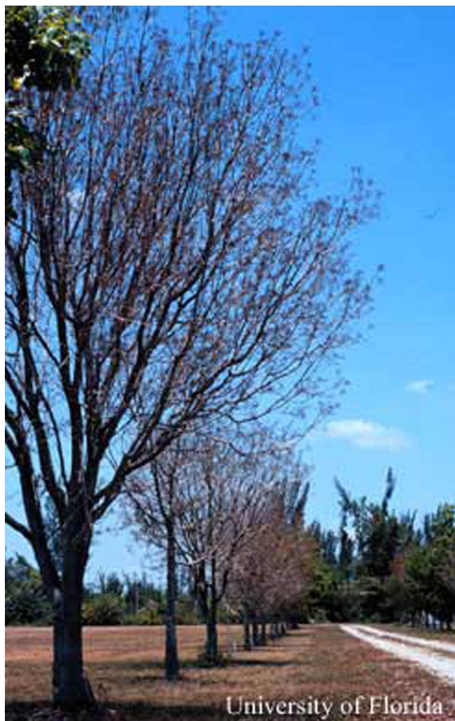
Figure 7. West Indies mahogany, Swietenia mahagoni , undergoing spring flush.

pronounced peaks in May (Howard 1991). In the tropics, mahogany shoot borers are active all year (Taveras et al. 2004b), with high shoot borer activity typically occurring with growth flushes of mahoganies subsequent to periods of high rainfall. Population increases in spring have been observed in some studies in the tropics, i.e., at the beginning of the rainy season (Roovers 1971, Bauer 1987).