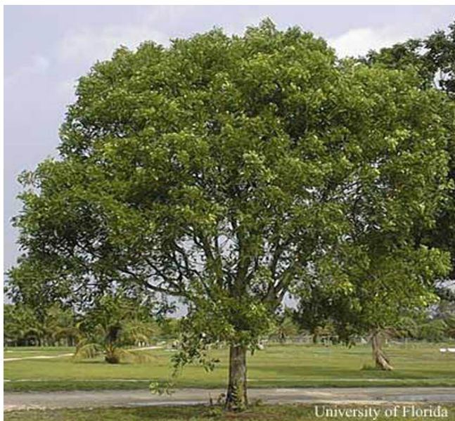
Figure 11. West Indies mahogany, Swietenia mahagoni.