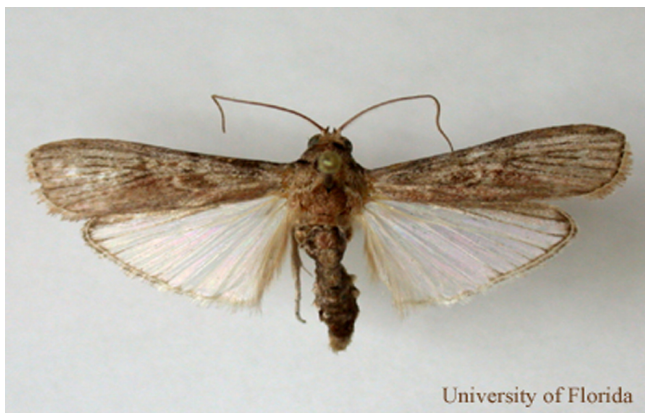
Figure 1. Mahogany shoot borer, Hypsipyla grandella (Zeller), adult moth, pinned specimen.

Adults: The adults of H. grandella are brownish to grayish-brown in color with a wingspan measuring about 23 to 45 mm. The forewings are gray to brown with shades of dull rust red on the lower portion of the wing. The middle to outer areas of the forewings appear dusted with whitish scales with black dots toward the wing tips. Wing veins are distinctively overlaid with black. The hind wings are white to hyaline with dark colored margins.