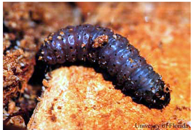
Figure 3. Mahogany shoot borer, Hypsipyla grandella (Zeller), larva.