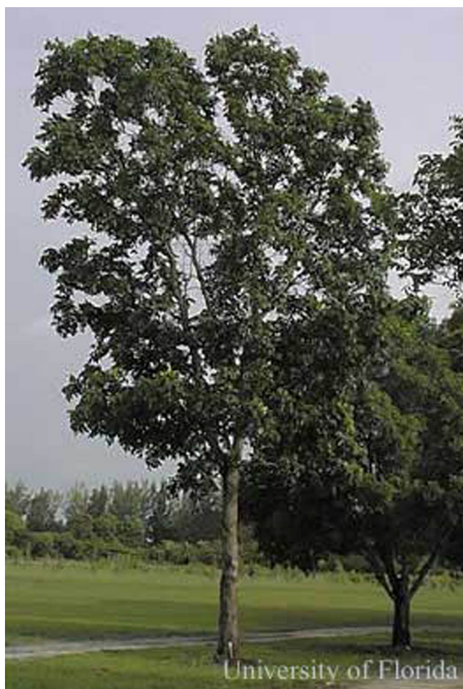
Figure 14. Honduras mahogany, Swietenia macrophylla .

Mahogany shoot borer attack reduces the grade and thus the monetary value of young mahoganies grown in nurseries for use as ornamentals, their chief use in Florida (Howard and Meerow 1993). Because attacks ultimately result in a reduction in the number and length of straight, clear logs, mahogany shoot borers are a major pest of mahoganies, cedros, and other meliaceae timber trees grown for timber in the tropics. They attack a higher percentage of trees where mahoganies are grown in plantations than where these trees grow interspersed in natural forests, and this insect has been a major impediment to the establishment of mahogany plantations. Methods of growing mahoganies in plantations as a way of lessening the impact of logging on natural forests are urgently needed (Lamb 1966, Newton et al. 1993, Mayhew and Newton 1998, Floyd and Hauxwell 2001).