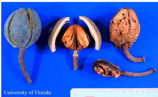
Figure 9. West Indies mahogany, Swietenia mahagoni , seed capsules and their parts damaged by mahogany shoot borer, Hypsipyla grandella (Zeller). Left to Right: Capsule in initial stage of dehiscence, dehisced insect-free capsule, core damaged by larvae, dehisced capsule with larval damage.

such as African mahoganies ( Khaya spp.) have been attacked when planted in the American Tropics.