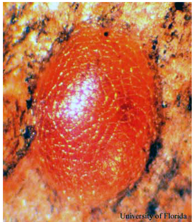
Figure 2. Mahogany shoot borer, Hypsipyla grandella (Zeller), egg.

Pupa: The pupae of H. grandella are brownish-black in color and enclosed in a silken cocoon.