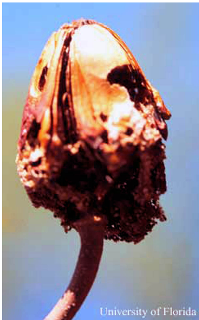
Figure 8. West Indies mahogany, Swietenia mahagoni , seed capsule damaged by mahogany shoot borer, Hypsipyla grandella (Zeller).

capsules of West Indies mahogany is mostly limited to the period during which the capsules dehisce, i.e., in spring prior to and simultaneous to the new shoot flush (Howard and Gilblin-Davis 1997). The pupal stage takes place inside the hollowed twig or in the seed capsule, or in the leaf litter or soil under host trees. Average duration of the pupae stage is 10 days (Ramirez Sanchez 1964).