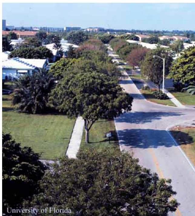
Figure 13. West Indies mahogany, Swietenia mahagoni , as a shade tree in urban area of Florida.

Some meliaceous tree species that are native to the tropics of the Eastern Hemisphere are attacked by mahogany shoot borer ( H. grandella ) when grown as exotics in the Americas; in their native ranges they are generally hosts of this insect's Eastern Hemisphere counterpart, H. robusta . An example is