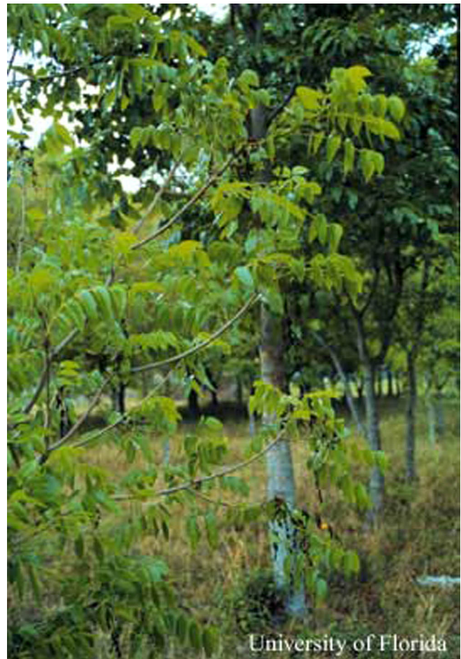
Figure 5. Young West Indies mahogany tree with several shoots damaged by mahogany shoot borer, Hypsipyla grandella (Zeller).