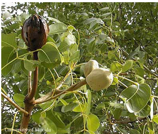
Figure 12. West Indies mahogany, Swietenia mahagoni , foliage and seed capsules.

Caribbean Region, West Indies mahogany was extensively logged, after which the more extensively distributed Honduras mahogany on the mainland of the Americas became the major source of mahogany timber.