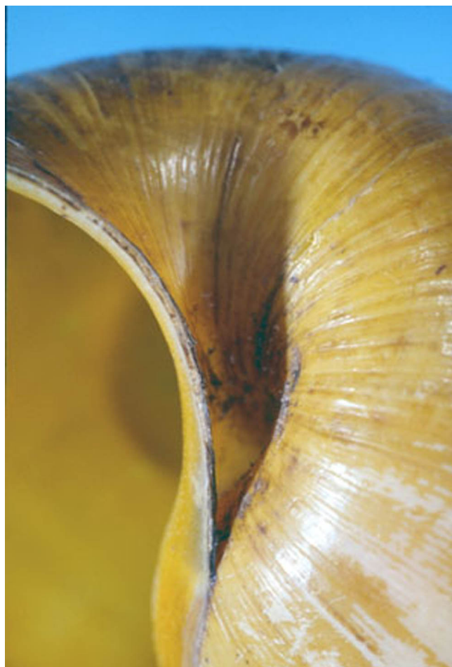
Figure 4. Channeled applesnail, Pomacea canaliculata (Lamarck) showing the deep groove or channel giving it its name.

southern China and Japan. In contrast to the other Florida applesnails, this species feeds aggressively on many types of aquatic and terrestrial plants. In Hawaii, it feeds on taro and rice whereas in southeastern Asia it has been a serious rice pest. It also can host the rat lung worm that can infect