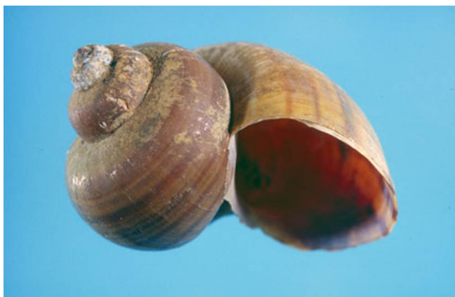
Figure 5. Spiketopped applesnail, Pomacea bridgesi (Reeve).

2' . Shell without deep groves separating whorls (Fig. 5); adult shells 40-60 mm high; coloration usually greenish with darker and lighter bands in nature . . . . spiketopped applesnail, Pomacea bridgesi (Reeve)