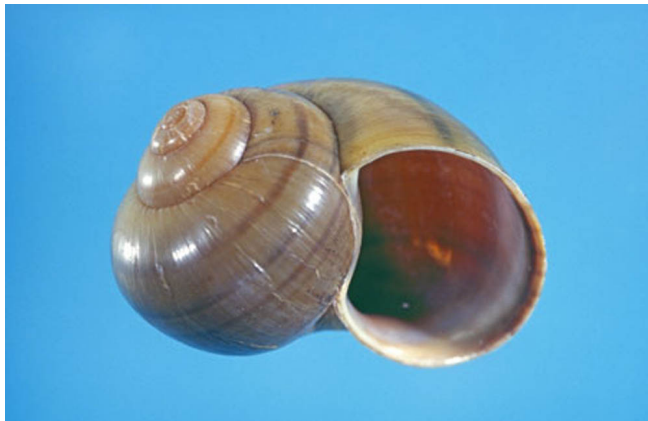
Figure 2. Florida applesnail, Pomacea paludosa (Say).

1. Apical spire of shell strongly rounded or arched, apical whorls bluntly rounded and not elevated (Fig. 2); adult shells about 40-70 mm high . . . Florida applesnail, Pomacea paludosa (Say)