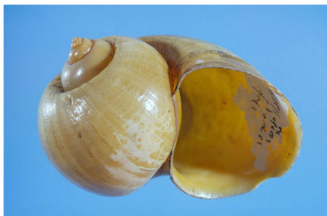
Figure 3. Channeled applesnail, Pomacea canaliculata (Lamarck).

This large applesnail (shell height up to 100 mm) was introduced into South Florida from the Paraguay River System at least as early as 1978. Like the giant African snail, this snail was purposely released into Hawaii, Philippines and Taiwan in the 1980s to be cultured for human consumption. However, there was little interest in eating these snails and the species spread rapidly from Indonesia to