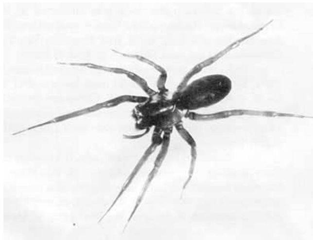
Figure 2. Female Metaltella simoni (Keyserling), a Cribellate spider.