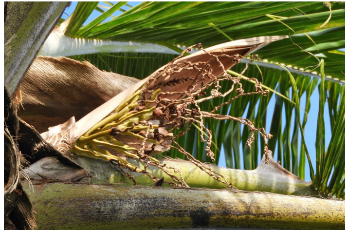
Figure 2. Necrotic inflorescence on a Coconut palm infected with LBD.