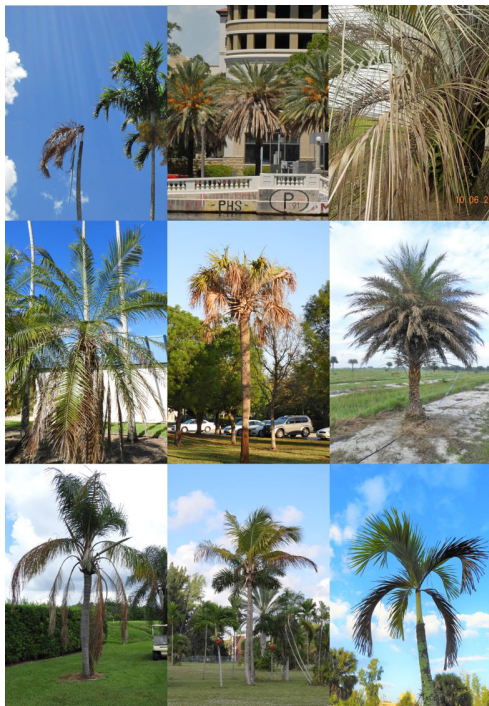
Figure 4. Various ornamental palms displaying symptoms of LBD.

Management of LBD involves removal of infected palms and preventative injection of antibiotics. Current data suggests that once palms start showing symptoms, the label rate for the antibiotic oxytetracycline-hydrochloride is not sufficient for symptom reversal. Because of this, upon symptom development and/or a positive test result, a palm is considered lost and should be removed immediately to reduce the amount of time this source of phytoplasma exists in the environment. The longer it is left, the higher probability that further spread will occur. Sampling healthy-looking palms around symptomatic palms can help get ahead of the disease because healthy-looking palms can also test positive. Even though no symptoms are present, those palms still need to be removed because there will not be sufficient time for the antibiotic to take effect before symptoms develop. Also, by testing healthy-looking palms, you can identify which palms are not infected and start preventative injections with the antibiotic.