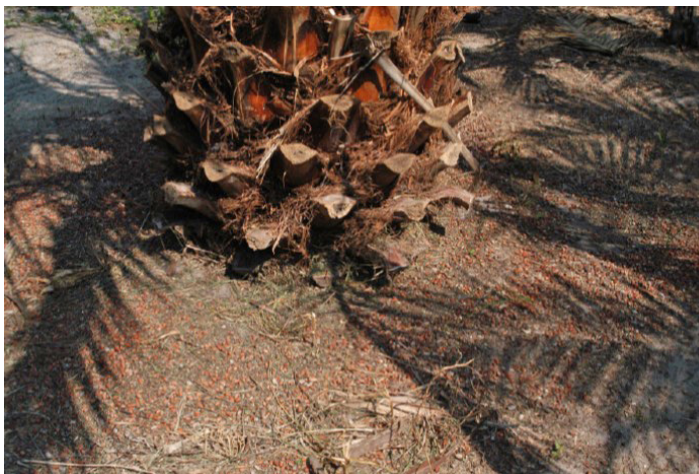
Figure 1. Premature fruit drop is an early symptom of LBD.

The first symptoms of LBD are variable. However, if fruit is present, the first symptom is generally premature fruit drop (Figure 1). If fruit has not set but inflorescences are present, they will become necrotic (Figure 2). Note that if the palm is not old enough to produce fruit, if it is not putting out an inflorescence at the time of infection, or if the inflorescences are trimmed, then these will not be reliable indicators for infection status. Inflorescence necrosis/fruit drop progresses to discoloration of the oldest leaves (closest to the ground) that gradually advances to younger leaves (Figure 3). The final stage of the disease is the collapse of the spear leaf, indicating that the heart or bud of the palm (apical meristem) has died and the palm has completely declined with no chance of saving it. The length of time between infection and symptom development (latent period) appears to be about four to five months. From symptom development to collapse of spear leaf is about two to three months, but this is highly variable. In some cases, no leaf discoloration is observed, but the spear leaf will collapse and the palm will test positive. Symptom progression occurs at different rates in different palm species.