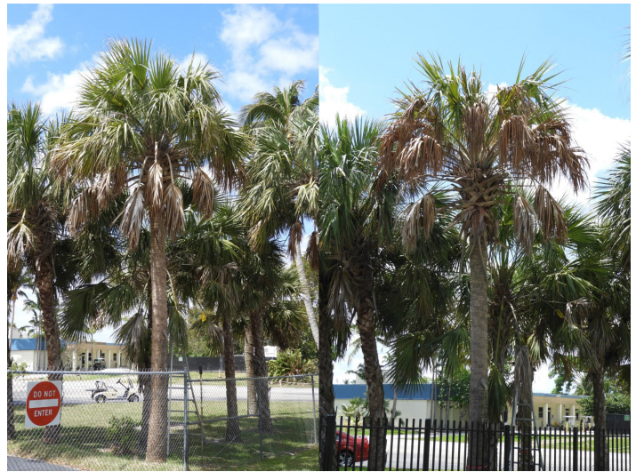
Figure 3. Symptom progression of LBD in a Sabal palmetto demonstrating discoloration of older leaves first, March 2018 (left); then three months later where more, younger leaves are affected and spear leaf has collapsed (right).