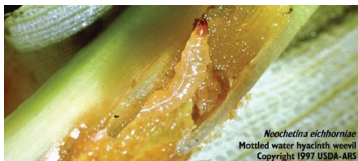
Figure 4. Larva of Neochetina eichhorniae Warner inside leaf tissue of water hyacinth, Eichhornia crassipes (Mart.) Solms.

The larvae have three instars (developmental stages) (Figure 4, Deloach 1975). The width of the head capsule of the larvae increases with each molt, progressing from 0.36 mm for the first instars, 0.56 mm for the second instars, to 0.76 mm for the third instars.