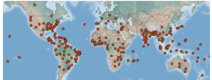
Figure 6. Global distribution of water hyacinth, Eichhornia crassipes (Mart.) Solms, the primary host plant of Neochetina eichhorniae Warner. Red dots represent areas with reported occurrence of water hyacinth.