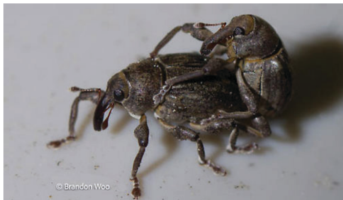
Figure 3. Female (left) and male (right) of Neochetina eichhorniae Warner. Compared to females, males are shorter and have rostrums that are shorter and thicker, weakly curved and shiny from the insertion point of the antennae to the distal end (apex), and distinctly clubbed on the apex. Females have rostrums that are longer and moderately slender, are strongly curved with a nearly cylindrical cross section and shiny from a small distance in front of the eye to the apex, and uniformly increase in thickness from its base towards the apex.

The eggs are long, slender, and flexible. They measure approximately 0.88 mm long by 0.44 mm wide and are typically found beneath the epidermal layer in the leaf blades (lamina) or leaf petioles (the stalk that attaches a leaf blade to the stem) of water hyacinth (Deloach 1975).