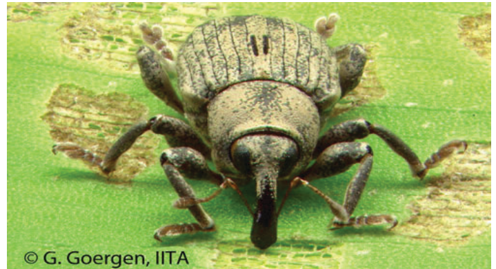
Figure 1. Female of Neochetina eichhorniae Warner feeding on water hyacinth. The adults are mottled dark brown to black and have two parallel tubercles.

The Integrated Taxonomic Information System (ITIS) lists the following synonym for Neochetina eichhorniae : Neochetina eichborniae Zoological Record, 1979 Missp.