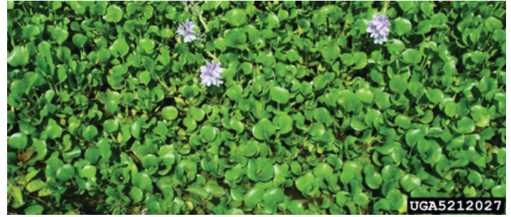
Figure 5. Dense mat of water hyacinth, Eichhornia crassipes (Mart.) Solms, covering a body of water.

to Brazil but has now invaded freshwater drainage basins in over 50 countries (Figure 6, Winston et al. 2014).